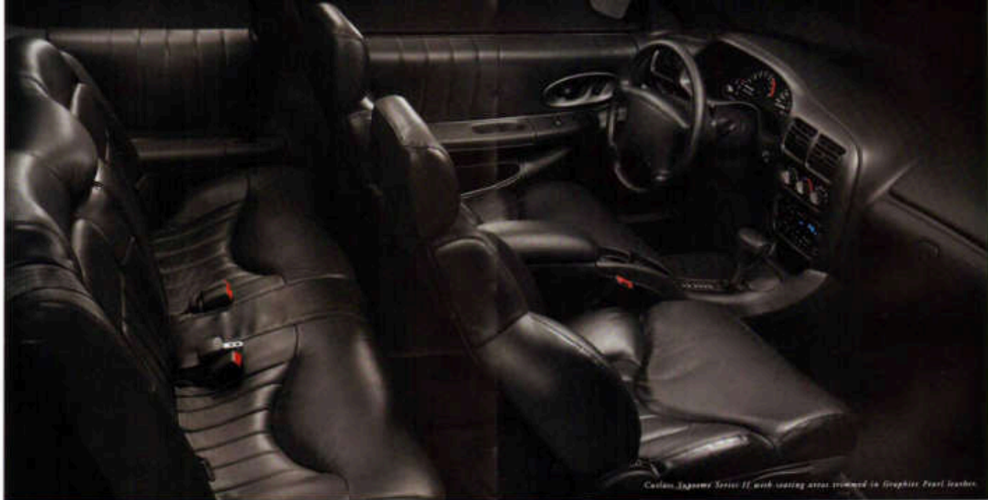
Cadillac Supreme Series II with leather seats trimmed in Graphite Pearl leather.