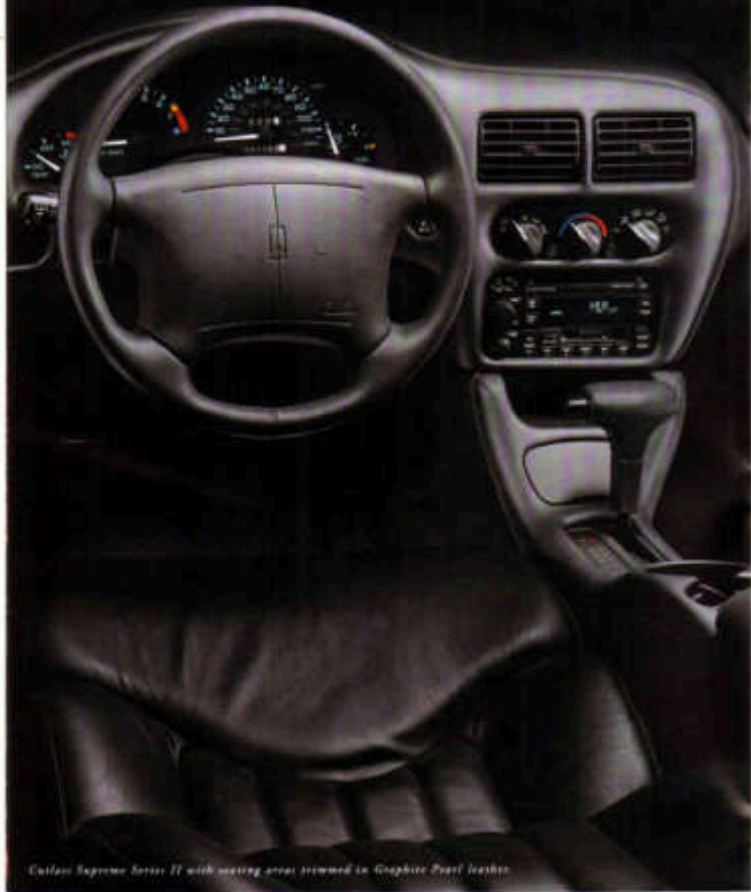
Cadillac Supreme Series II with seating areas trimmed in Graphite Pearl leather.

Oldsmobile introduces a step-in. BETTER way for you to step in a car.