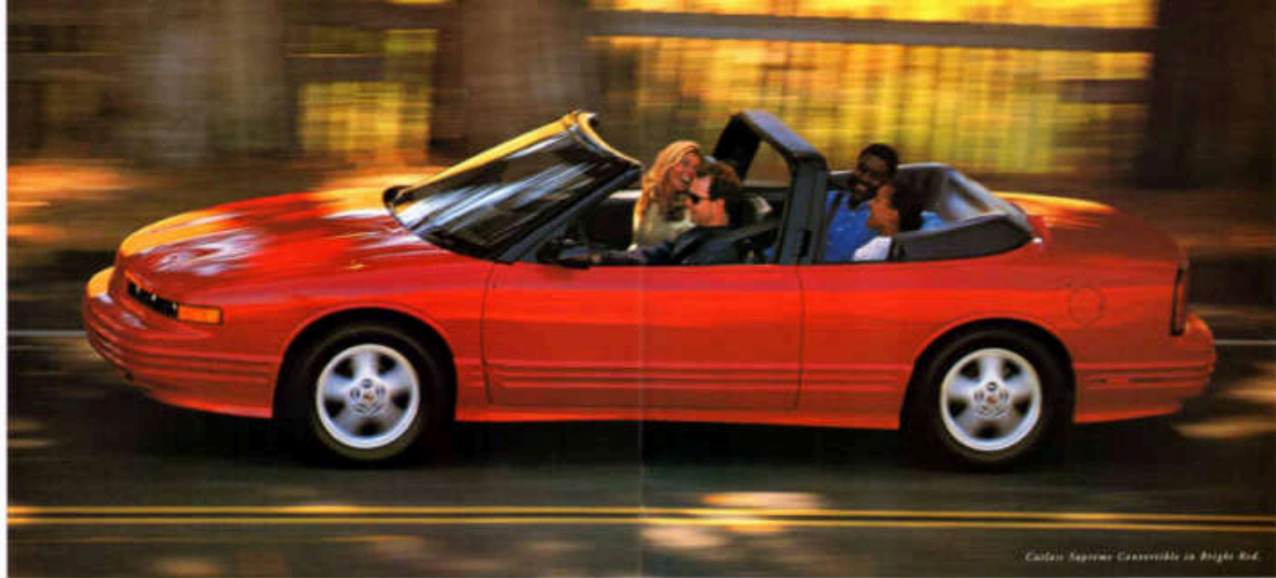
Cadillac Supreme Convertible in Bright Red.