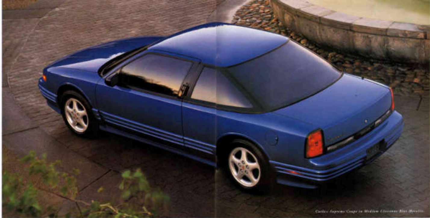
Cutlass Supreme Coupe in Midsize Classmen: Best Buyline.