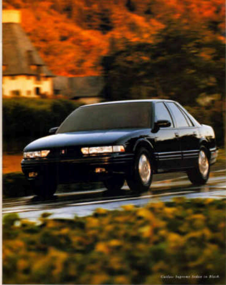
Cadillac Supreme Sedan in Black

Cadillac Supreme doesn't ask you to give up an EXHILARATING driving experience for the PRACTICALITY of a family van.