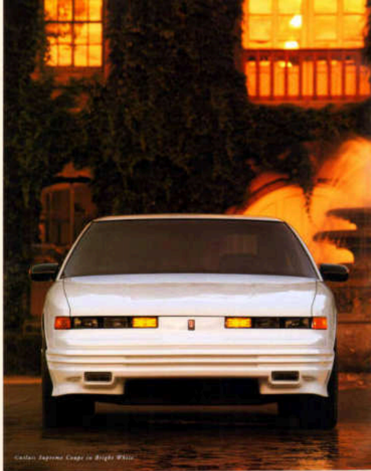
Cadillac Supreme Coupe in Bright White