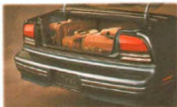
A power moon release opens to a roomy 15.5 cu ft of cargo space. There's 14.9 cu ft in the cargo. Series III models have a split-folding rear seat back to expand your capacity for long or oddly shaped items.

The controls, for instance, are presented in an elegant arc so you can see them and reach them. (After all, it's your cockpit.) How's it feel? Slide behind the wheel. It's like wearing your favorite cotton sweater. Reclining front bucket seats, contoured to fit your contours, are standard. Surrounded by style, leg-stretching spaciousness, and all the comfort of a hug from mom, you'll find Cutlass Supreme a wonderful place from which to take on the world.