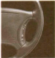
Steering wheel touch controls, standard on Series III models, allow you to operate the climate control and sound systems without removing your hands from the steering wheel or taking your eyes off the road.

Real comfort starts with knowing that you can get to your destination safely. That's why the Cutlass Supreme's fully independent suspension deals with pavement as sure-footedly as a gazelle covers a prairie. Its brakes are big, 4-wheel discs with an anti-lock system to help you maintain steering control. And its standard foglamps can help enhance its excellent overall visibility. Cutlass