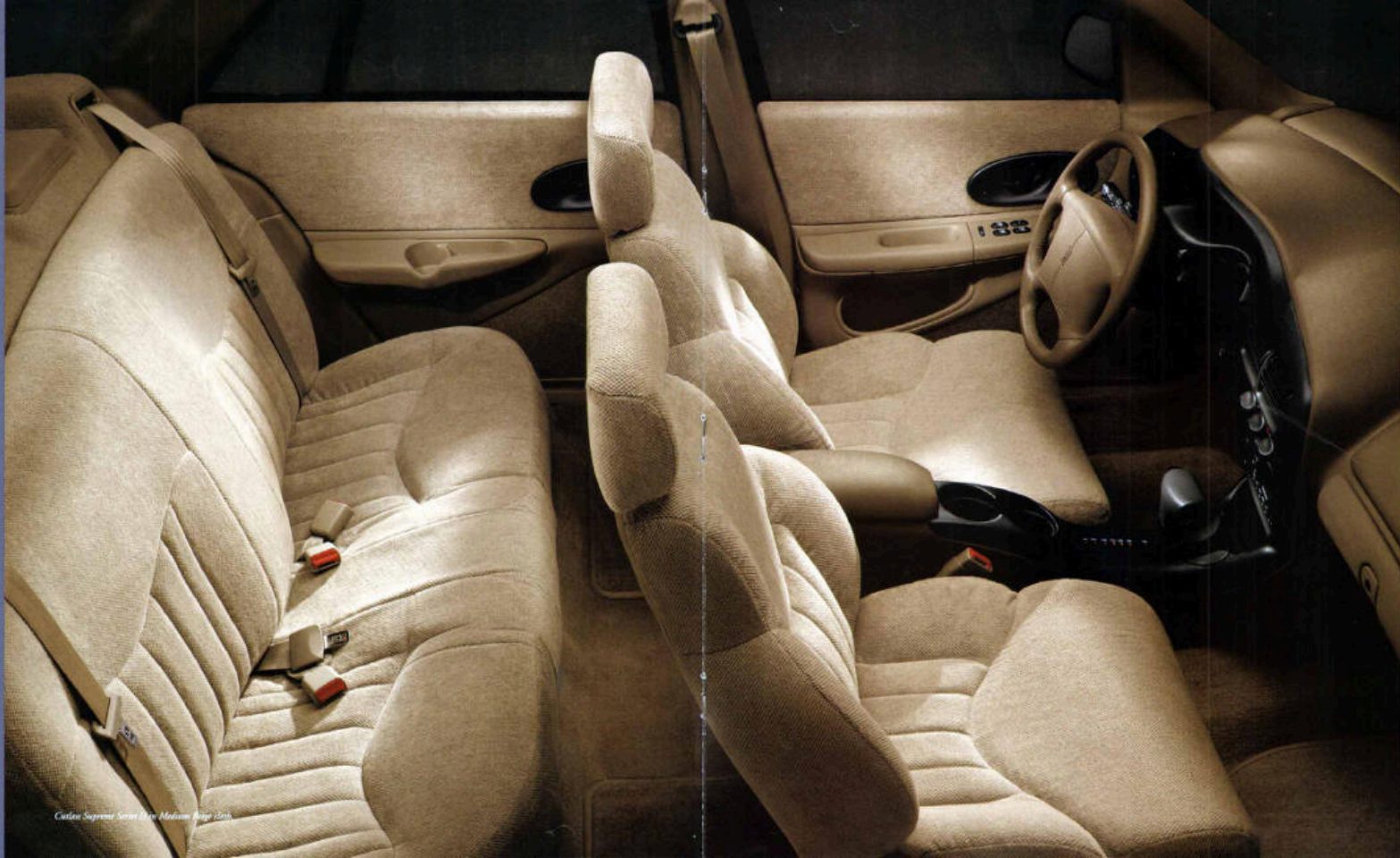
Cutlass Supreme Sedan (also Medium Body 201)

I suppose being elected to do the driving is something of a compliment to my good taste.