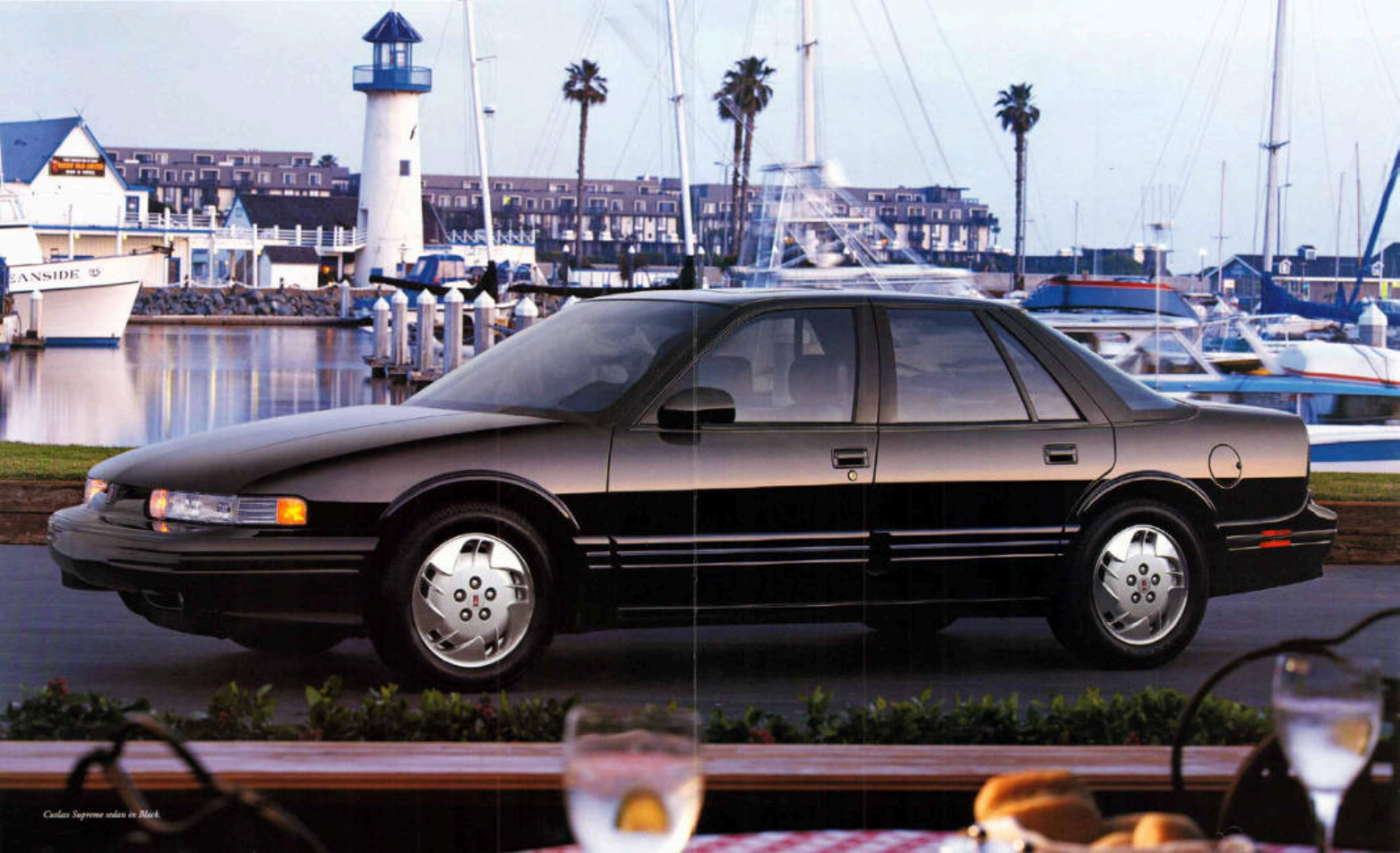
Century Supreme sedan in Black