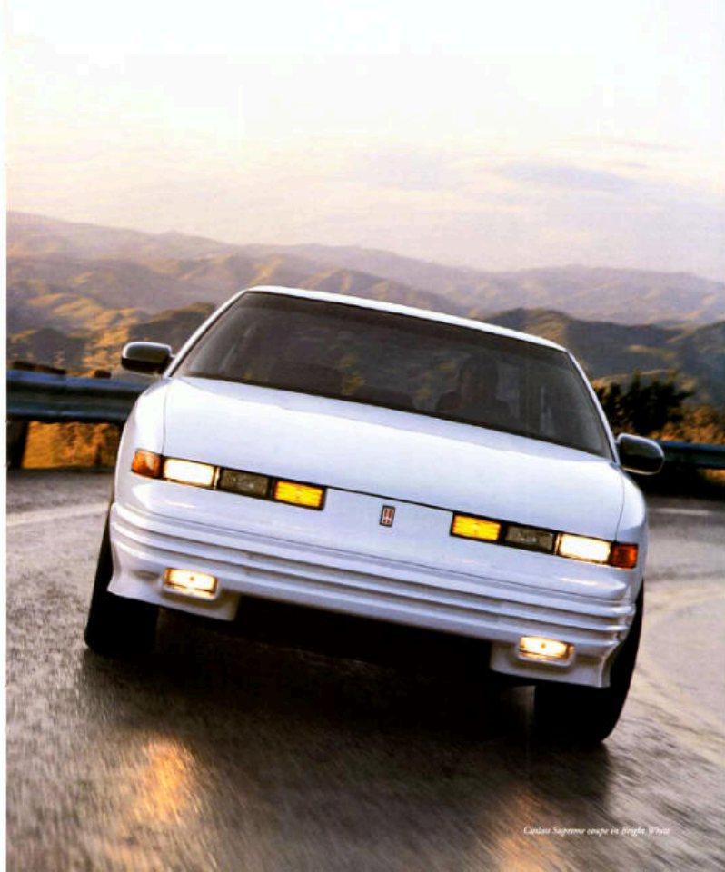
Cadillac Supreme coupe in Bright White

The salesman at the other dealership was telling me how his vehicles were "value-packed." I listened for a while, and then I asked how they compared to a Cadillac Supreme on a fraise-for-dollar basis. His fading smile was the only answer I needed. I thanked him for his time and headed right back to the Oldmobile dealer. Then it was my turn to smile.