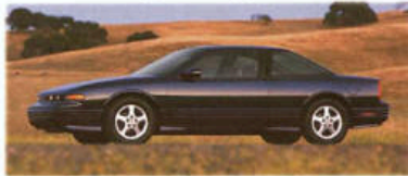
With its wrap-around rear glass design, pillar-mounted door handles, mini-quad headlamps, rear air conditioning, 5-spoke aluminum-alloy wheels and aerodynamic sleekness, the Cutlass Supreme coupe looks like nothing else on the road.

It's about getting the most for your money. And feeling you've made a smart decision. Call it value. Call it bang-for-the-buck. We call it Cutlass Supreme coupe and sedan. These solid performers do a lot more than make your money go a long way. They deliver responsive driving that takes the kinks out of the curves on your ride home. And the kind of style that makes a statement. All the while, providing a comfortable interior that respects your need