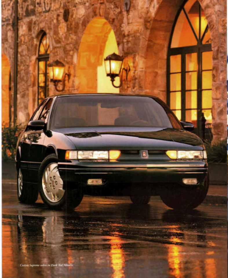
Cutlass Supreme sedan in Dark Tint Metallic.