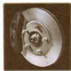
All Cutlass Supremes feature standard anti-lock brakes which prevent wheel locking, thereby helping the driver maintain steering control under maximum braking conditions, even on wet or other slippery surfaces.

Supreme also features a rigid unibody that resists torsional and bending