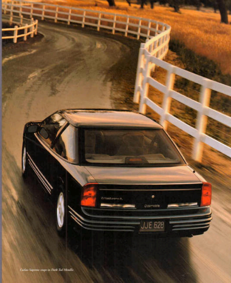
Cutlass Supreme coupe in Dark Teal Metallic.

Since I got my Cutlass Supreme, I always seem to be elected as the car-pool person. Weddings, birthday parties, you name it. I haul everybody. I can see why. It's one of the best-looking cars around, so who wouldn't want to show up in it. Plus, there's all that interior room so everybody has enough space. I suppose being elected to do the driving is something of a compliment to my good taste.