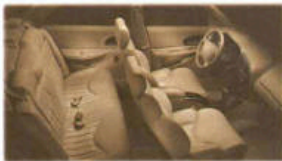
Cutlass Supreme's spacious interior, with reclining front bucket seats, provides comfort even after many hours behind the wheel. Series III is shown with standard leather-trimmed seating areas.