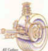
All Cutlass Supreme models feature four- wheel independent suspension with MacPherson front struts and four-wheel anti- lock disc brakes.

3.1-liter SEI V6 engine with an advanced ignition system. It's smooth and quiet. A strong, silent type. For even greater power, a 200-horsepower, 3.4-liter DOHC V6 is available. Its 24-valve performance means effortless high-rpm operation. The transmission is car computer-controlled four-speed automatic, with shifting so seamless, it's hardly detectable. Cutlass Supreme owns its flat cornering and controlled ride to four-wheel independent tuned suspension. Stepping is provided courtesy of four-wheel anti-lock disc brakes. If balanced performance is your preference, there's no need to look across an ocean. Just look across your Oldsmobile dealer's showroom.