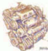
4-valve 200-horsepower 3.1-liter V6, standard, offers smooth, even performance.