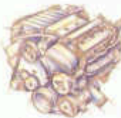
The available 200-horsepower, 3.4-liter DOHC V6 engine is part of a performance package that includes special suspension components, dual exhaust, five-spoke aluminum wheels, P225-60R15 tires, and four- door anti-rung-in-panels.

Cutlass Supreme presents performance in the grand sense: power when and where it's needed. This is a car hard to hug curves, devour straight-aways and pass when entered, deftly and smoothly, without sweating. And to do it at lower cost than similarly talented imports. Every Cutlass Supreme sports the all-new 160-horsepower,