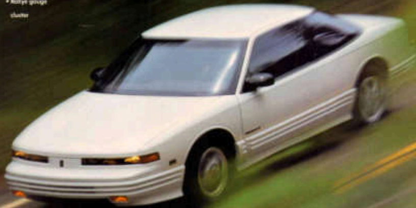
Cutlass Supreme SE, in Bright White.