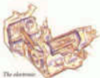
The electronic four-speed automatic trans- mission is standard. It provides precise, smooth shifting.

Cutlass Supreme presents performance in the grand sense: power when and where it's needed. This is a car hard to hug curves, devour straight-aways and pass when entered, deftly and smoothly, without sweating. And to do it at lower cost than similarly talented imports. Every Cutlass Supreme sports the all-new 160-horsepower,