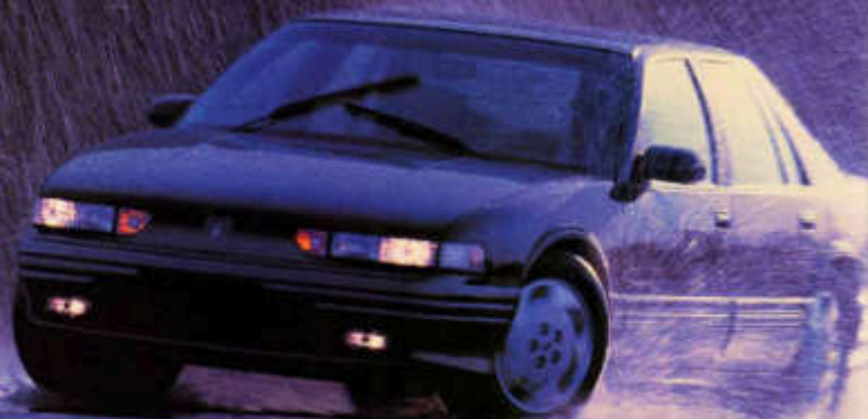
Cutlass Supreme SE in Platinum Metallic