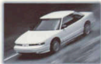
Improved rear glass, perforated disc handles and expanded headlights give the Cutlass Supreme coupe an aggressive look.

In the boldly aggressive Cutlass Supreme, expressive styling and the sheer fun of driving blend seamlessly with family-credible utility. Ample power from an advanced V6 engine and the sport-focused agility of 4-wheel independent suspension make Cutlass Supreme a true driver's machine. Dual air bags, anti-lock brakes and a spacious interior round out a very impressive package. And with its four Sates to choose from, you can have a well-equipped Cutlass Supreme that's sure to fit your budget.