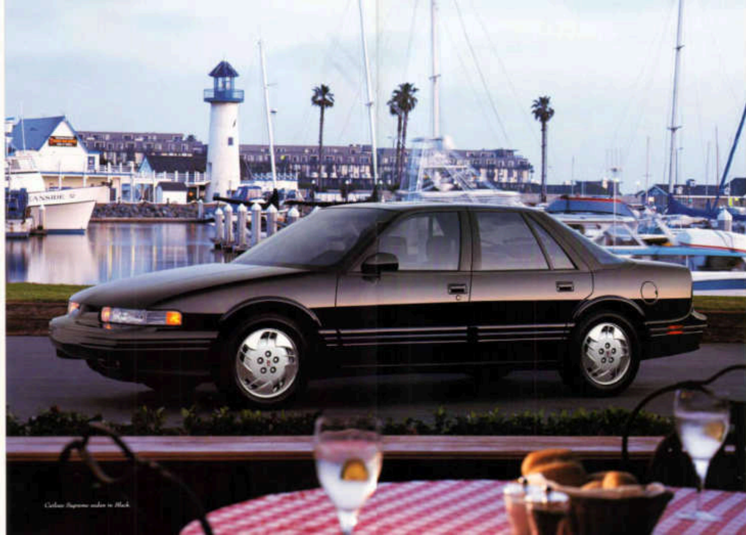
Cadillac Supreme sedan in Black.