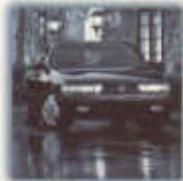
The Cutlass Supreme makes combined sophisticated performance with functional styling.

Driving pleasure meets practicality — in beautiful style.