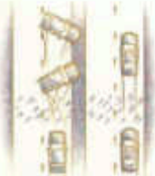
Every Eighty Eight features standard computer-controlled four-wheel anti-lock brakes (ABS) to help you maintain control. ABS minimizes the chance of wheel lockup and skidding during hard braking.