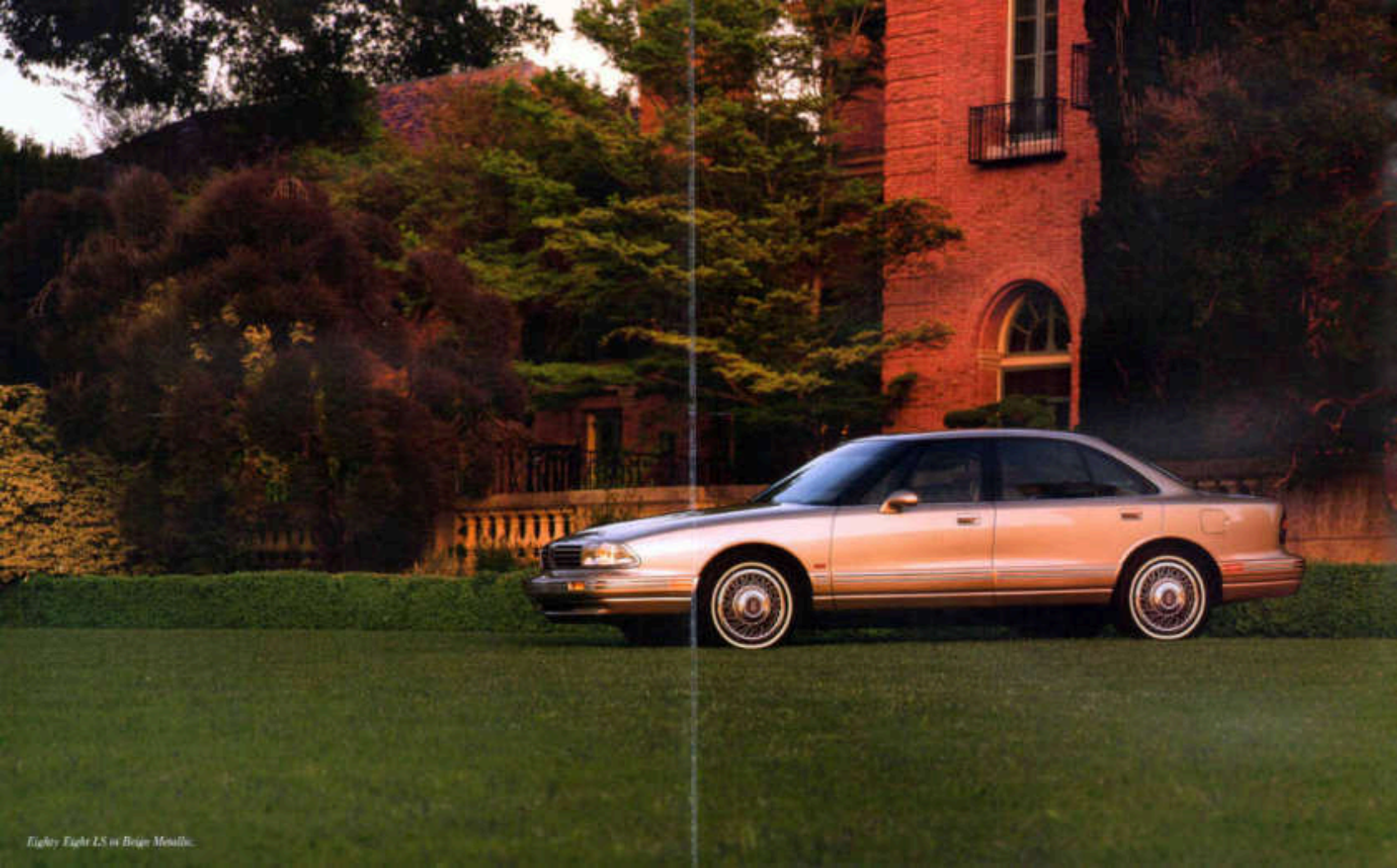
Eighty-Eight LS in Bright Metallic.