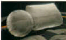
Dual air bags are standard. Remember, always wear safety belts even with an air bag.