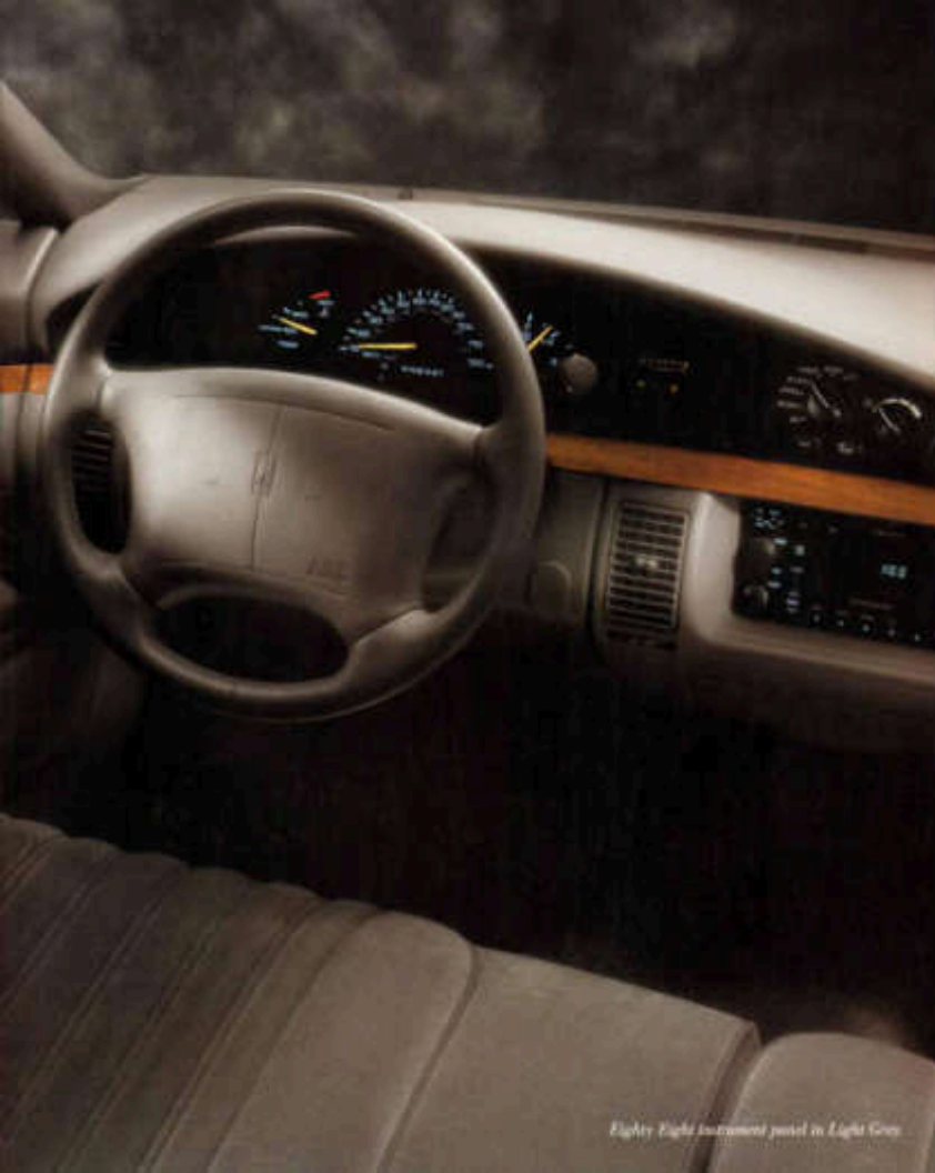
Eighty Eight instrument panel in Light Gray