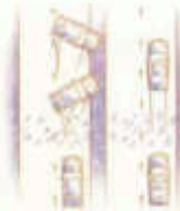
Every Ninety Eight has standard computer-controlled four-wheel anti-lock brakes (ABS) to help you maintain control by minimizing the chance of wheel lockup and skidding during hard braking.

Safety matters. We want to help you avoid accidents in the first place. And help safeguard you in your Ninety Eight... just in case. To help you keep control when reacting to unforeseen hazards, every Ninety Eight comes with four-wheel anti-lock brakes, front-wheel drive, power rack-and-pinion steering, four-wheel fully inde-