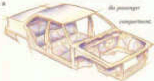
Ninety Eight's antibody structure forms a protective cocoon. Crush zones help absorb and guide crash energy away from the passenger compartment.

pendent suspension and responsive engine power. But in the event of the unavoidable, Ninety Eight helps protect you and your passengers. Dual air bags are standard. So are rear door child-security locks. The antibody steel safety cage has front and rear crush zones to help absorb and guide crash energy away from the passenger compartment. And the interior, luxurious as it is, is designed to minimize injuries by incorporating flame-retardant fabrics and impact-absorbing, padded surfaces. Safety is a critical part of every Ninety Eight. Knowing that, you can enjoy this car even more.