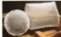
Ninety Eight features standard driver and passenger-side air bags. Remember, always wear safety belts and seat belts are not for

Safety matters. We want to help you avoid accidents in the first place. And help safeguard you in your Ninety Eight... just in case. To help you keep control when reacting to unforeseen hazards, every Ninety Eight comes with four-wheel anti-lock brakes, front-wheel drive, power rack-and-pinion steering, four-wheel fully inde-