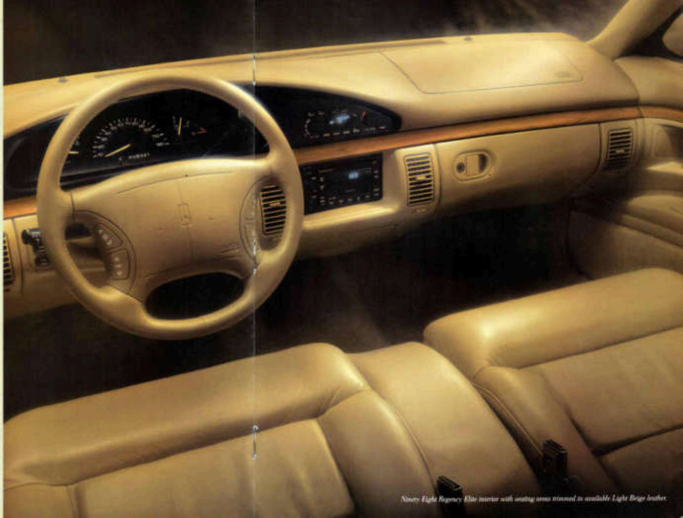
Nine's Eight Regency Elite interior with seating areas trimmed in available Light Beige leather.

An eight-speaker Dimensional Sound system is available. By surrounding, we're heard.