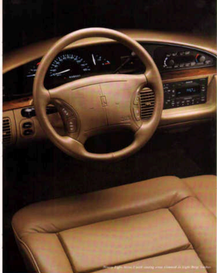
Ninety Eight Series II with cooling area climate in right-hand corner.

The standard storage console gives you the convenience of map lights, plus storage space for a garage door opener and sunglasses.