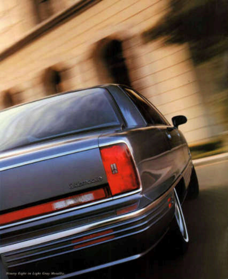
Ninety Eight in Light Grey Metallic