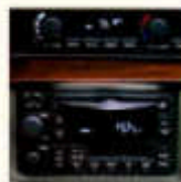
An available audio system includes both compact disc and cassette players.