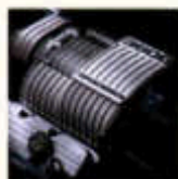
The supercharged 1000 V8 engine boasts peak output for 225 horsepower (available on Series II.)