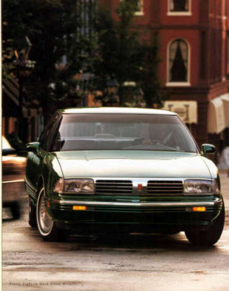
Chrysler PT Cruzer

Steering wheel track controls let you keep your eye on the road and hands on the wheel while adjusting the audio system and automatically closing windows.