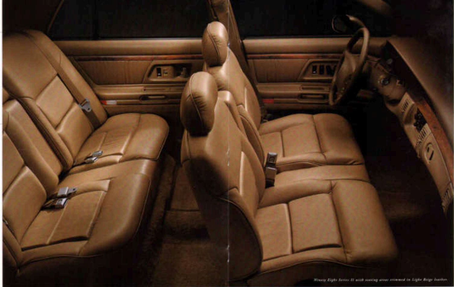
Ninety Eight Series II with seating area trimmed in Light Beige leather.

For 1985, Oldsmobile introduces a simpler, BETTER way to buy a car.