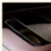
The power windows include an electric sliding glass panel with a sunshade (available on Series II.)