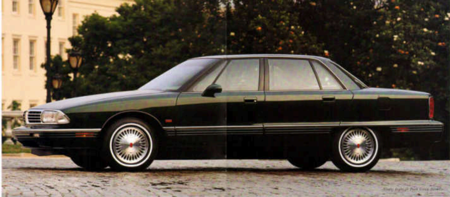
Starts right up. Pulls like a horse.