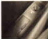
Everyone in a Silhouette enjoys and—or more—with the available eye-pleasant controls.

Make no mistake, Silhouette is a minivan. But it has enough carlike qualities to keep you wondering. You'll find the instrument panel features an analog gauge cluster and controls positioned for minimal distraction. Standard Tilt-Wheel steering adjusts to your personal preference. With the solid 3.3-liter V6 engine, automatic transmis-