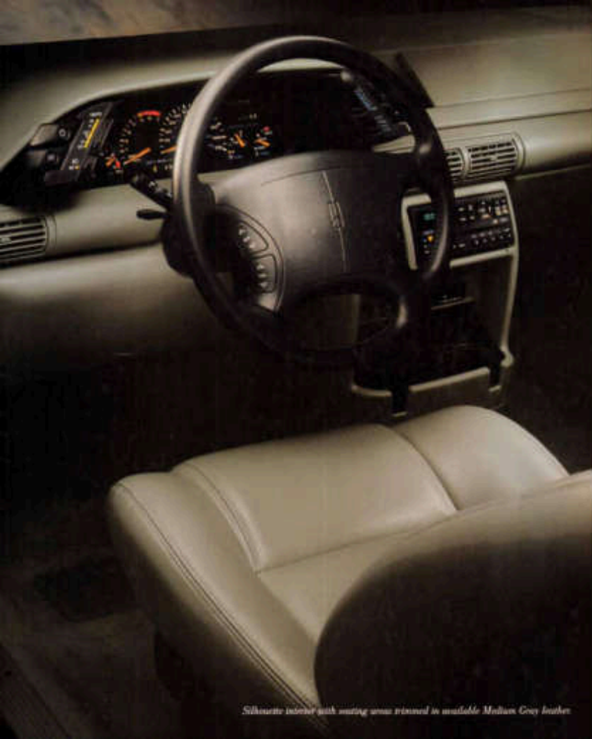
Silhouette interior with analog gauges trimmed in available Medium Gray leather.