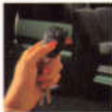
A GM exclusive, the available power sliding door may be opened up to 30 feet away with an available remote control locking system.

sion and power steering, all standard, city maneuvering or highway cruising is a breeze. And since this is an Oldsmobile, superior comfort is a priority. The ride is smooth. Seats are individually contoured, and the front buckets recline. Air conditioning with front and rear circulation is standard. And extensive acoustical refinements—the result of advanced testing—make Silhouette one of today's quietest minivans. Quiet enough to enjoy the standard AM-FM stereo system. Available steering wheel touch controls allow stereo operation without distraction. An available touring suspension includes electronic load-leveling. For an added touch, power door locks and windows, and cruise control are available. Minivan? Yes. Luxury car? Well, it's not far off.