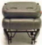
All five-row bucket seats are easy to fold down into any table or flat cargo surface. Or remove them completely—each weighs only 30 lbs, and no tools are required. How's that for flexibility and versatility?