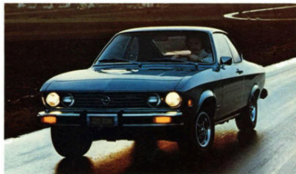
MANTA. Our most rakish-looking Opel.

And, naturally, control switches are labelled with international insignias.