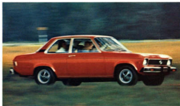
1900 SEDAN. Functional design; spirited soul.