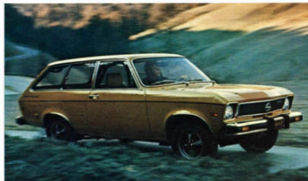
SPORTWAGON. Essentially the 1900 Sedan with a 53.3 cubic foot storage space.