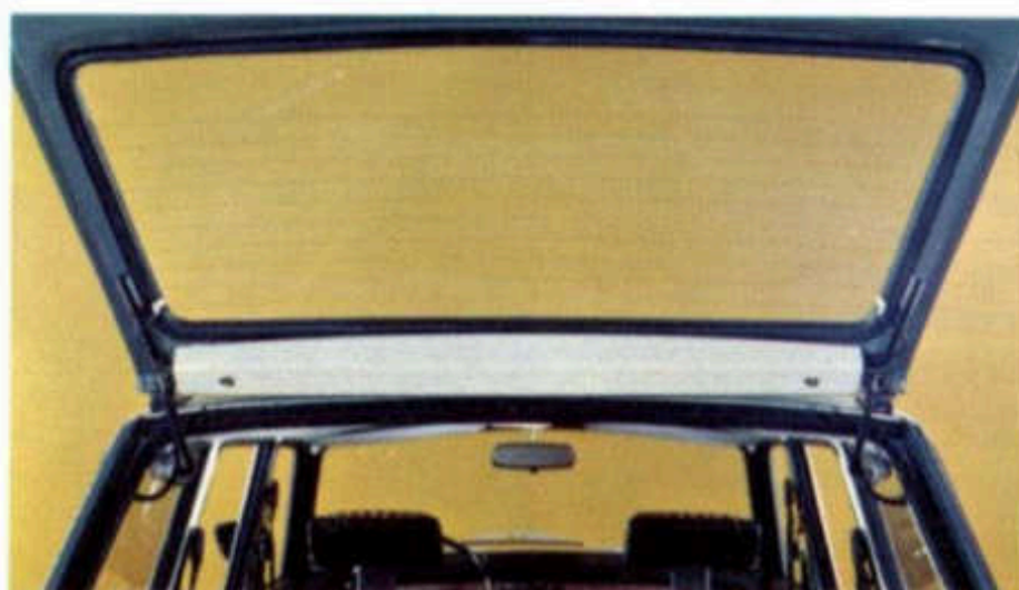
Door hinged at top for easy loading. Defroster clears rear window quickly.