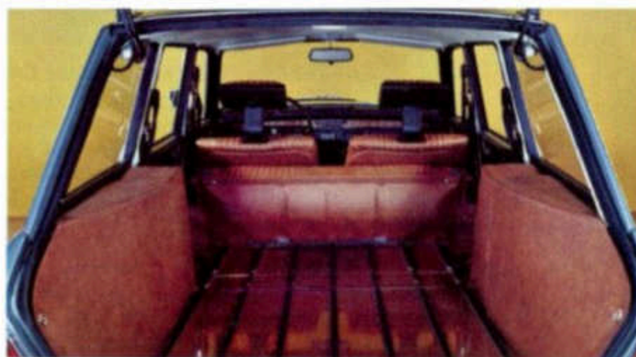
Total baggage area: 52 cubic feet.