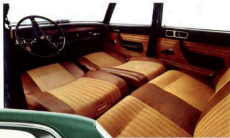
Fully reclining bucket seats