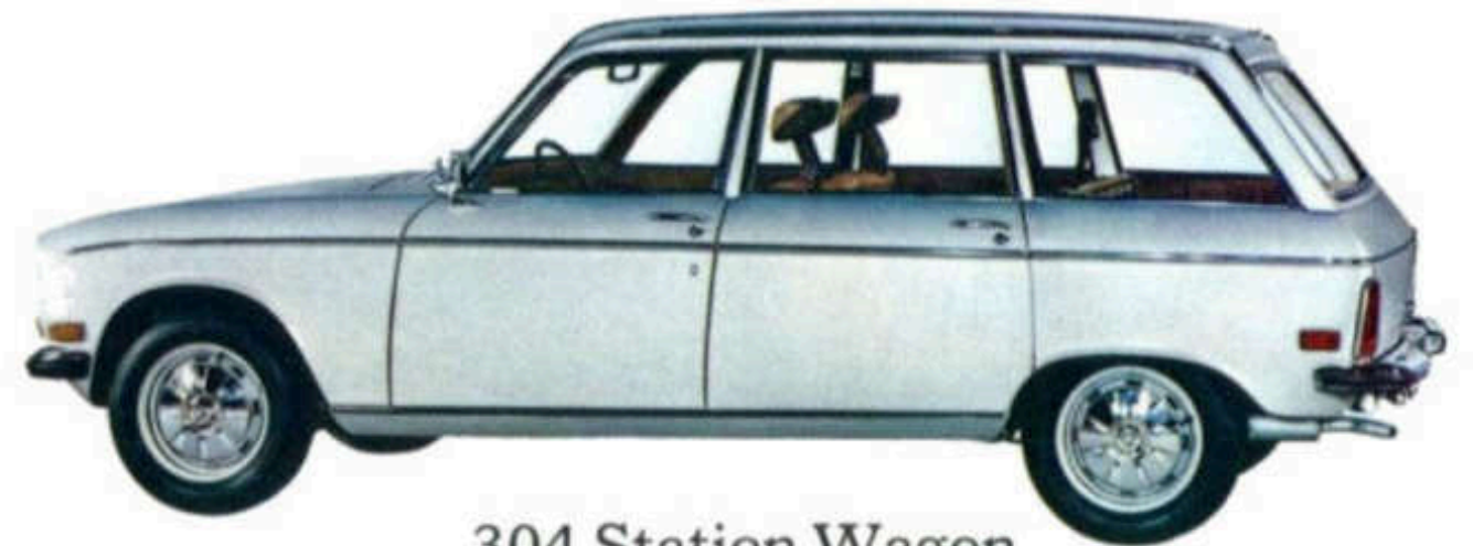
304 Station Wagon