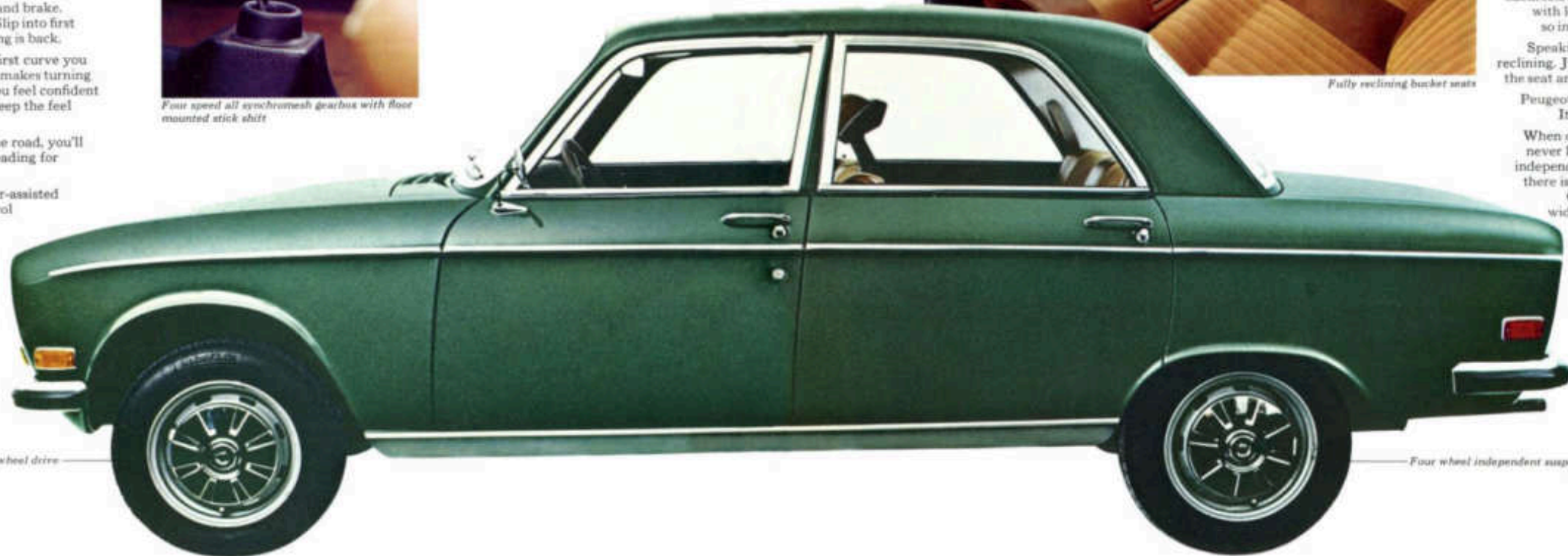
Front wheel drive