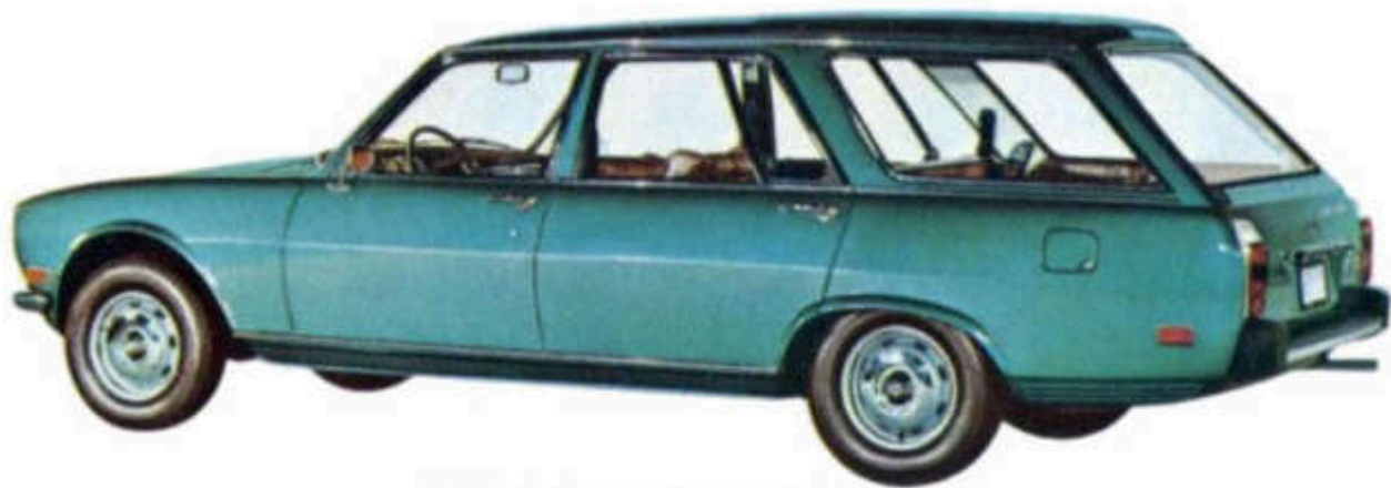
504 Station Wagon