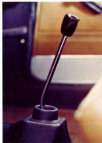
Four speed all synchromesh gearbox with floor mounted stick shift

With the entire weight of the transverse engine over the drive wheels there's more traction in mud, ice and snow. And better traction means better stability in tight cornering situations and gusty side winds. Plus better, more precise steering. You climb mountain roads, pull out of snow banks and mud holes without a struggle.