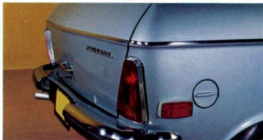
Independently suspended rear wheels keep baggage from bouncing around.

So you can load without a lot of lifting and shoving, the rear door is hinged at the top. A defroster clears the rear window in less than a minute. Plus your baggage has less chance of bouncing around because the independently suspended wheels are directly underneath. No overhang. It's a beautiful little bundle. The new Peugeot 304 Station Wagon.