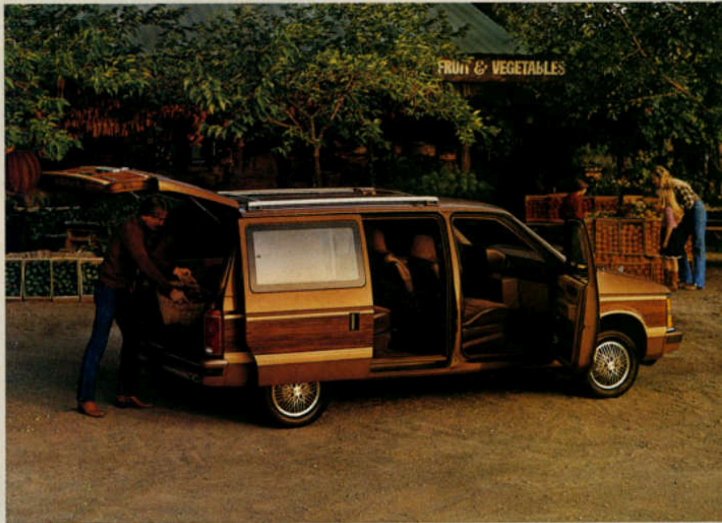
Voyager LE in Saddle Brown Crystal Coat with optional styled road wheels.

There's a quality difference you can see, hear and feel in the 1984 Plymouth Voyager. Designed through extensive use of advanced CAD/CAM (computer aided design/computer assisted manufacturing) technology, Voyager is the product of Chrysler Corporation's $365,000,000 assembly