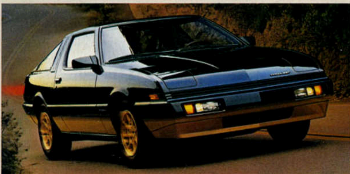
TOP: Plymouth Gran Fury shown in Glacier Blue Crystal Coat, with standard 15-inch deluxe wheel covers. CENTER PAGE: At Left, Colt DL five-door shown in Medium Blue with Blue interior; Center, Colt GTS-Turbo shown in White with Red interior; Right, Colt Vista station wagon shown in Silver/Charcoal with Gray interior. ABOVE: Conquest Technica shown in Black and Gold, with optional color-keyed 15-inch spoke-type aluminum wheels.

All product illustrations and specifications are based on authorized information. Although descriptions are believed correct at publication approval, accuracy cannot be guaranteed. Chrysler Corporation reserves the right to make changes from time to time, without notice or obligation, in prices, specifications, colors and materials, and to change or discontinue models. See your dealer for the latest information.