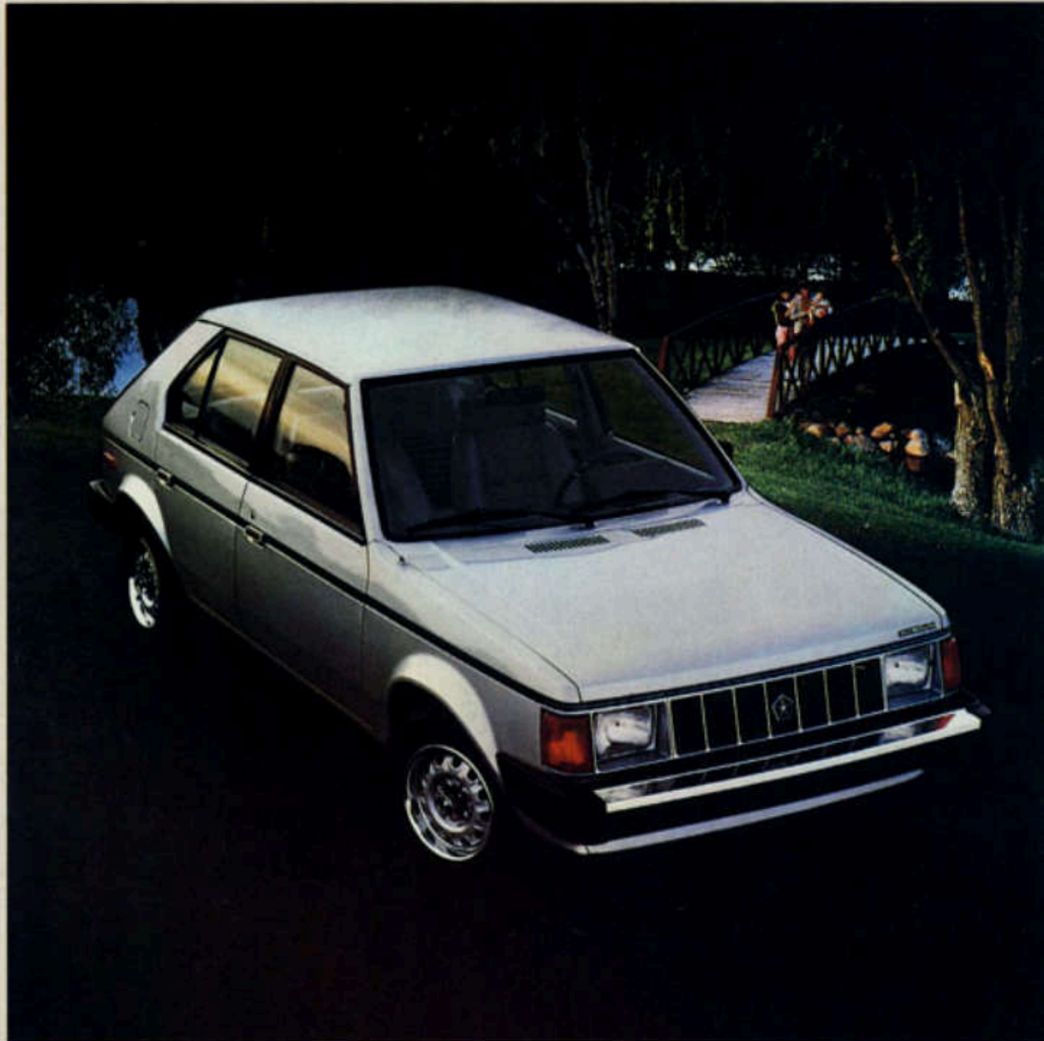
TOP: Horizon SE shown in Garnet Red, with optional Rallye road wheels. ABOVE: Plymouth Horizon shown in White, with standard road wheels.