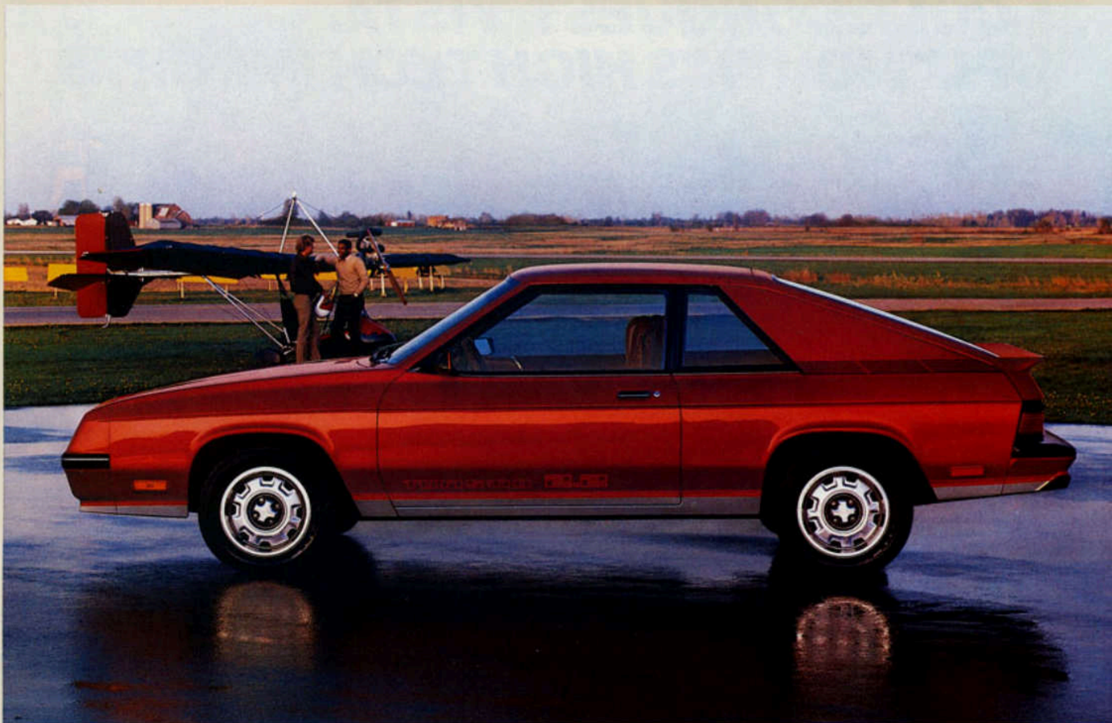
TOP: Plymouth Turismo shown in Spice Brown Metallic, with standard deluxe wheel covers. ABOVE: Turismo 2.2 shown in Garnet Red/Silver Two-Tone, with standard 14-inch Rallye road wheels.