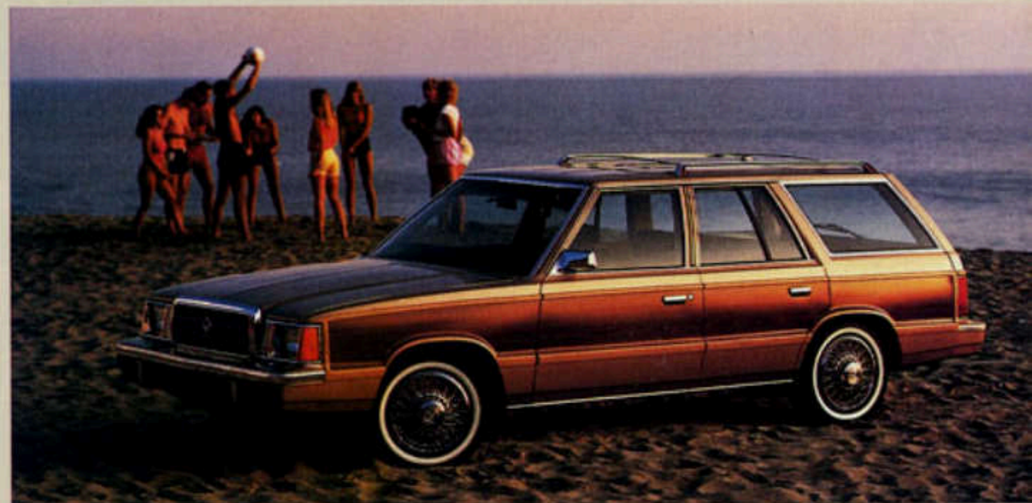
TOP: Reliant SE four-door sedan in Beige Crystal Coat, with optional 13-inch luxury wheel covers and optional whitewall tires. MIDDLE: Reliant SE four-door interior features a cloth- and- vinyl bench seat with folding center armrest, shown in Beige with Brown trim. ABOVE: Reliant SE wagon shown in Beige Crystal Coat with woodgrain applique, and equipped with optional wire wheel covers, wide whitewall tires and optional luggage rack.