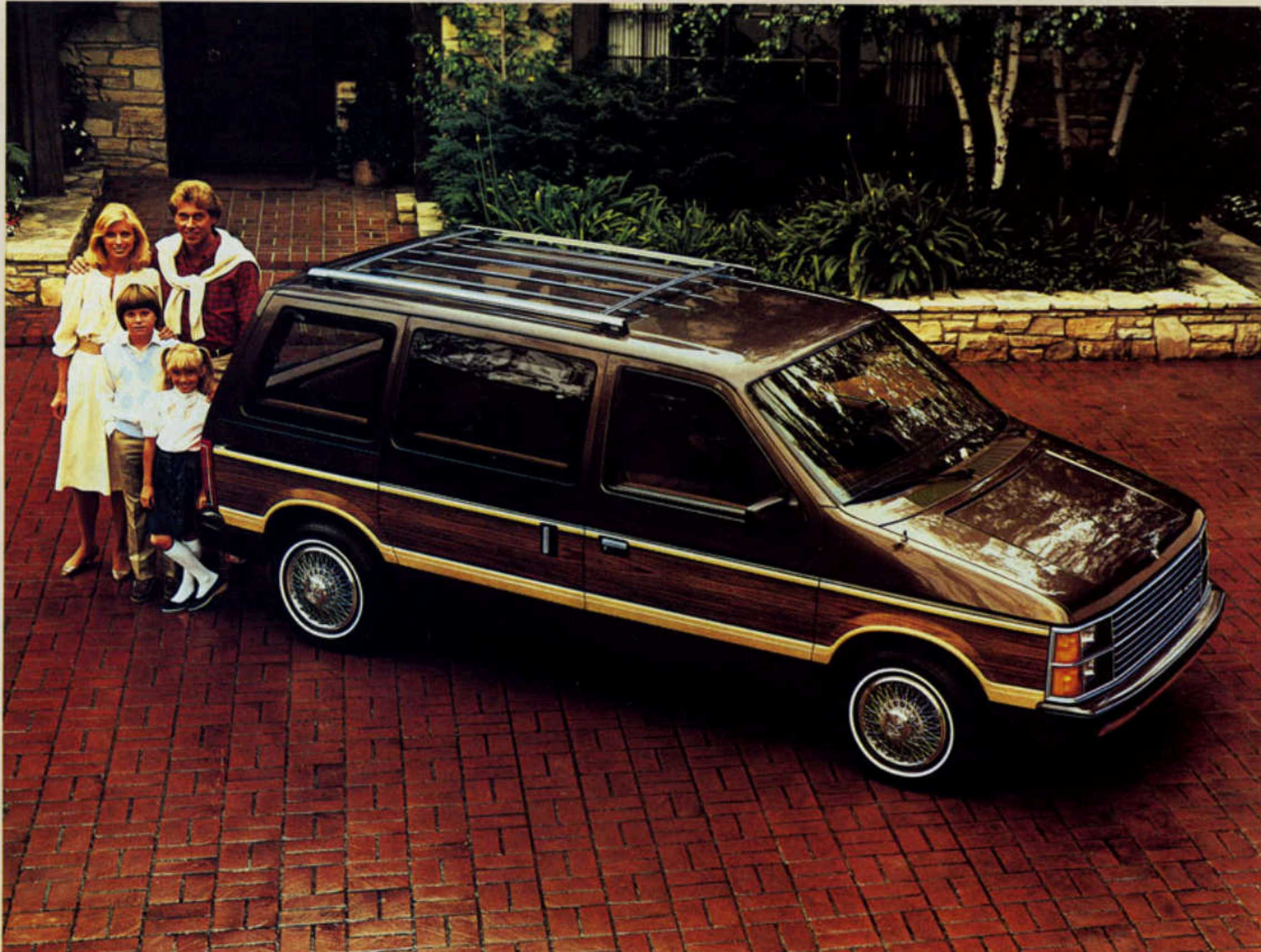
Voyager LE in Mink Brown Pearl Coat with optional wire wheel covers.

Some of the equipment shown or described in this catalog is available at extra cost.