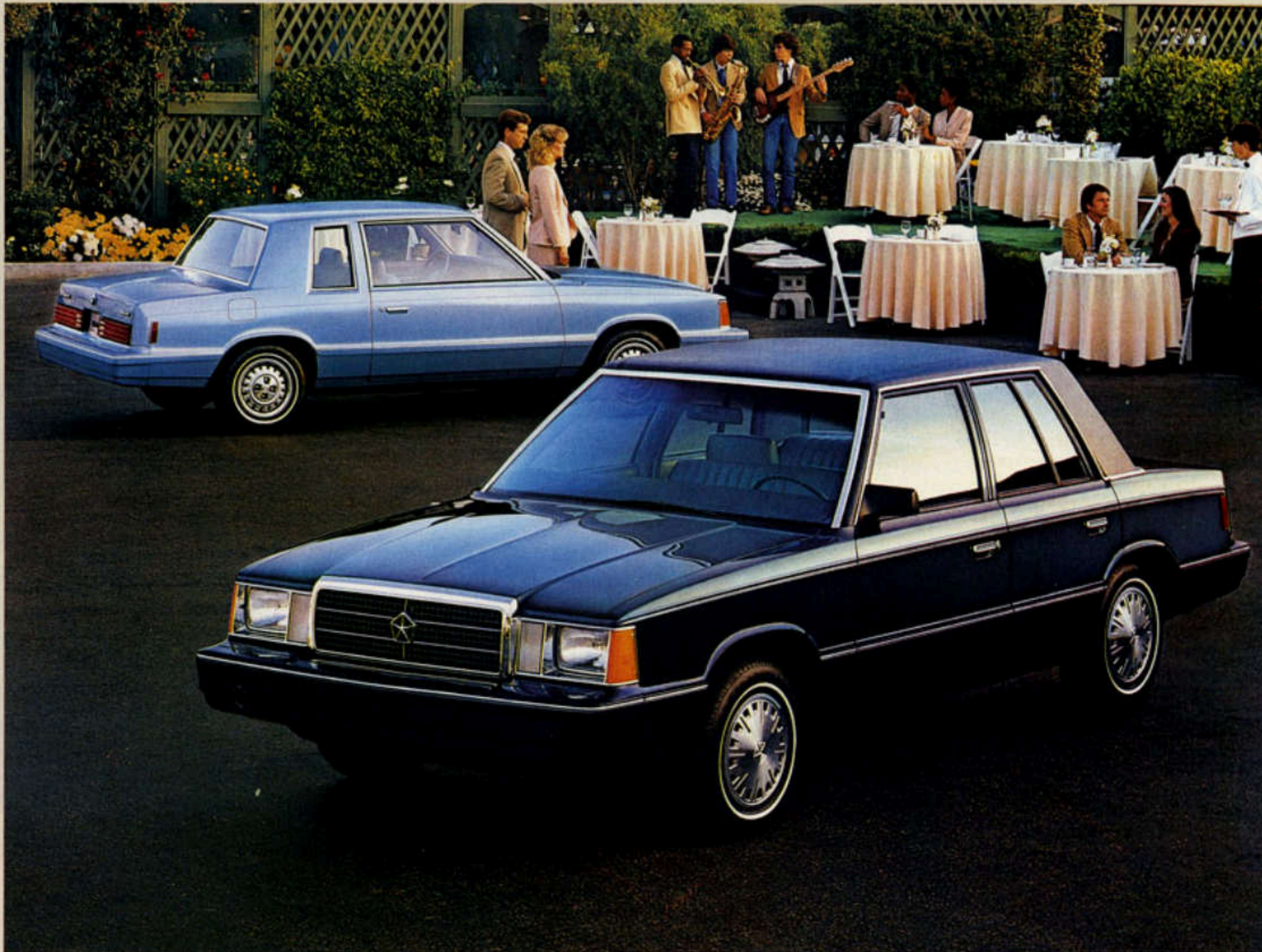
TOP: Reliant Custom wagon shown in Charcoal Pearl Coat, with optional luxury wheel covers and optional whitewall tires. ABOVE: In background, Reliant two-door sedan shown in Glacier Blue Crystal Coat, with optional Rallye road wheels and optional whitewall tires. In foreground, Reliant four-door sedan shown in Nightwatch Blue, with standard deluxe wheel covers.