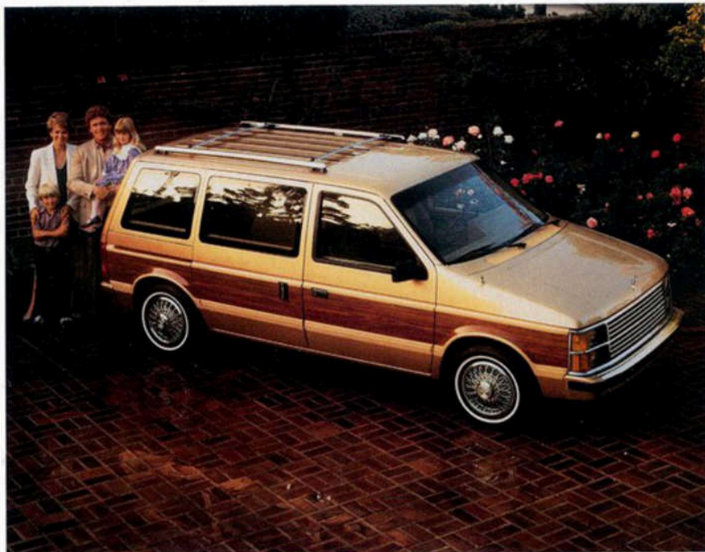
Voyager LE, shown in Gold Dust Crystal Coat.

The 1985 Plymouth Voyager combines outstanding human engineering with all the features that make for happy family motoring.