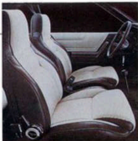
Turismo Duster interior.

Turismo 2.2 is an aggressive road car for the serious driver. The standard high-performance 2.2-liter engine, five-speed manual transaxle with close-ratio gearing and over-drive, sport suspension, performance exhaust, and 14-inch Rallye road