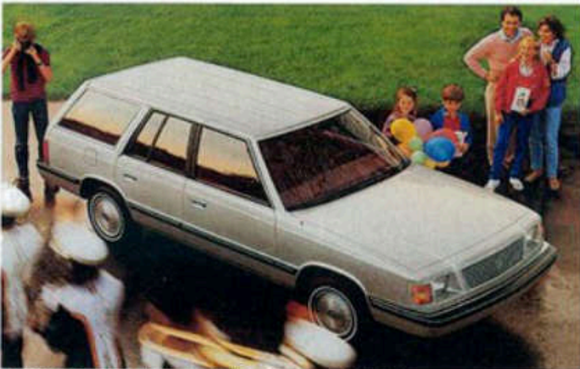
Reliant SE wagon, shown in Radiant Silver Crystal Coat.