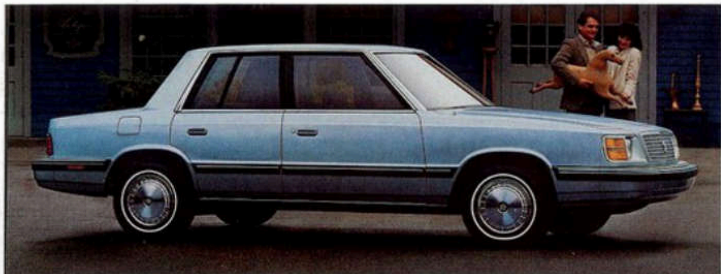
Reliant LE four-door, shown in Ice Blue Crystal Coat.

Standard features make the base Plymouth Reliant a value leader. They include front-wheel drive, a 2.2-liter