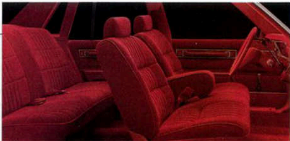
Caravelle SE standard cloth bench seat, shown in Red.

Under its stylish hood, Caravelle SE gives you a standard transverse-