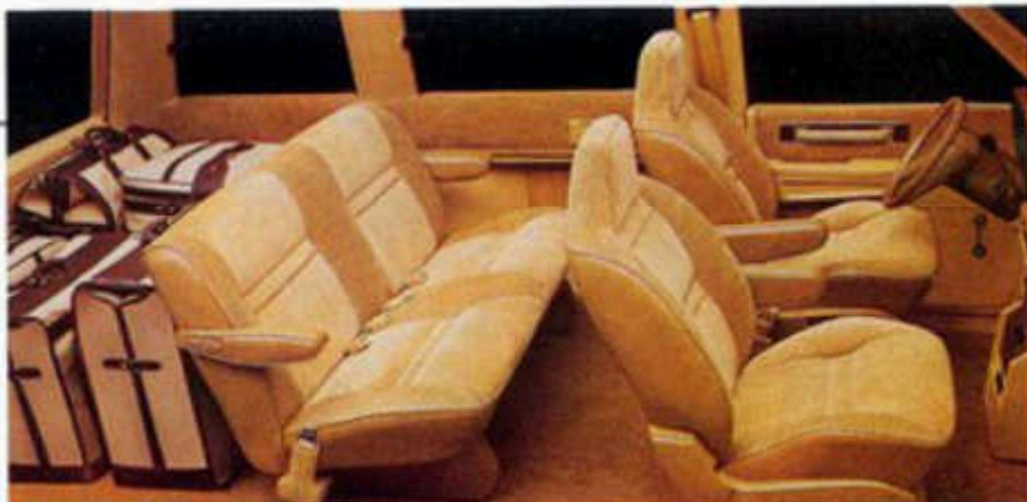
Standard Voyager LE five-passenger seating, shown in Light / Medium Tan.

There are three Voyager models. The top-of-the-line Voyager LE, mid-line Voyager SE, and the base Voyager. Every Voyager's long list of standard features includes front-wheel drive, 2.2-liter engine and five-speed manual transaxle, power steering and brakes, tinted glass, electronically tuned AM radio with integral digital clock, and liftgate wiper/washer.