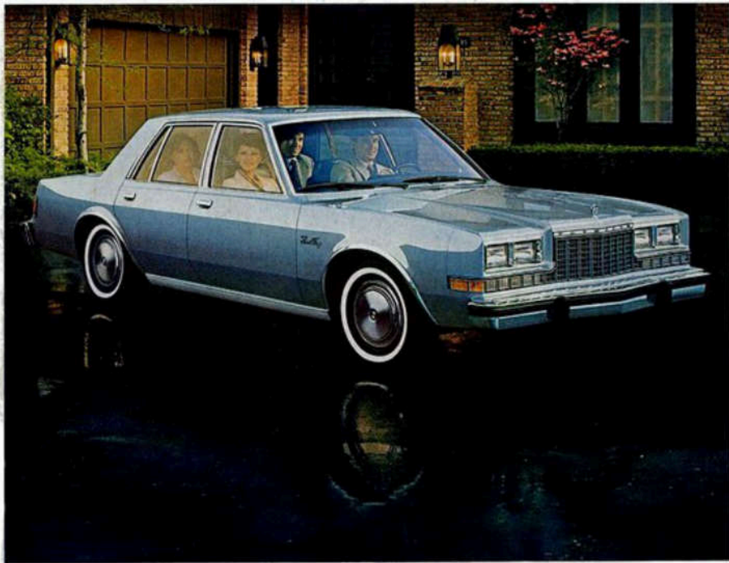
Gran Fury Salon, shown in Ice Blue Crystal Coat.

Allowances for car rental and towing are also included. Ask your dealer for details. Buckle up for safety.