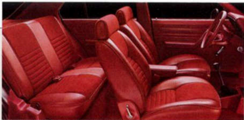
Standard Horizon interior, shown in Red.

Horizon's standard instrument panel includes speedometer, voltmeter, trip odometer, low oil pressure warning light, engine coolant temperature light and fuel gauge. An all-new shift indicator light (with manual transaxle only) even tells you when to shift gears.