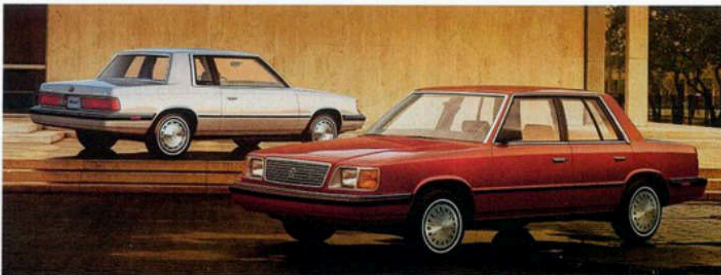
Left: Reliant SE two-door, shown in Radiant Silver Crystal Coat. Right: Reliant SE four-door, shown in Garnet Red Pearl Coat.†