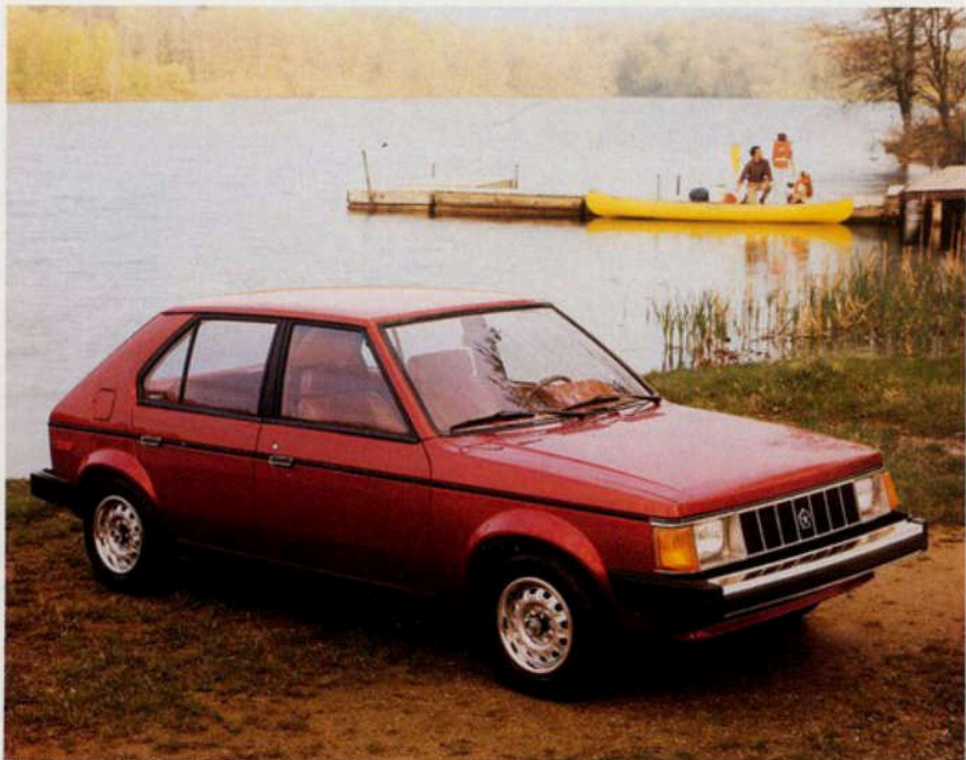
Horizon, shown in Garnet Red Pearl Coat.*

Choose the 1985 Horizon or Horizon SE for top value and features. Horizon value is virtually unbeatable. Match it. (If you can!)