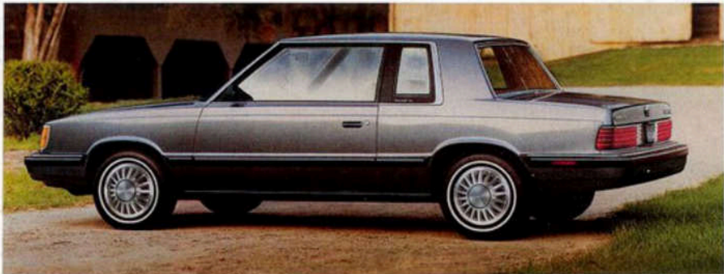
Reliant LE two-door, shown in Gunmetal Blue Pearl Coat.*