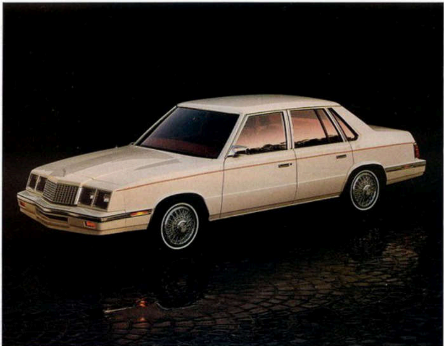
Caravelle SE, shown in White Crystal Coat.

Whether you go for the ample power of Caravelle SE's standard engine or the extra punch of turbocharging, you'll find the Plymouth Caravelle SE combines affordability, roadability and comfort beautifully.