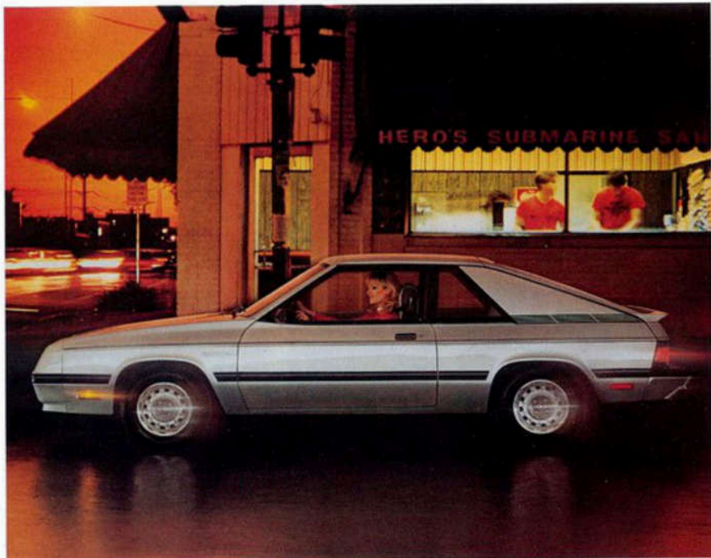
Turismo Duster, shown in Radiant Silver Crystal Coat.

Turismo comes with a standard 1.6-liter four-cylinder engine and four-speed manual transaxle with over-drive, as well as power brakes, and deluxe intermittent wipers. Interior comforts include standard cloth-and-vinyl low-back front bucket seats with dual recliners, Rallye instrument cluster, power liftgate release, and tinted glass. Choose the Turismo that's right for you—and enjoy!