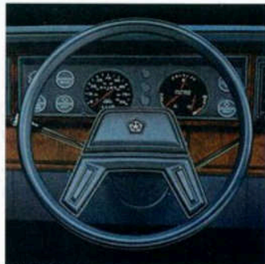
Reliant LE instrument panel.