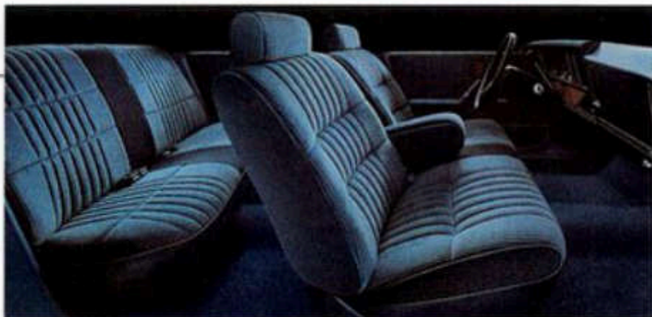
Reliant LE four-door interior, shown in Medium / Dark Blue.

Reliant LE lives up to its luxury image with standard interior comforts such as special sound insulation, deluxe intermittent windshield wipers, cloth-and-vinyl front bench seat with center armrest, cloth door trim panels with woodtone applique, and a passenger side visor vanity mirror with map/mirror light.