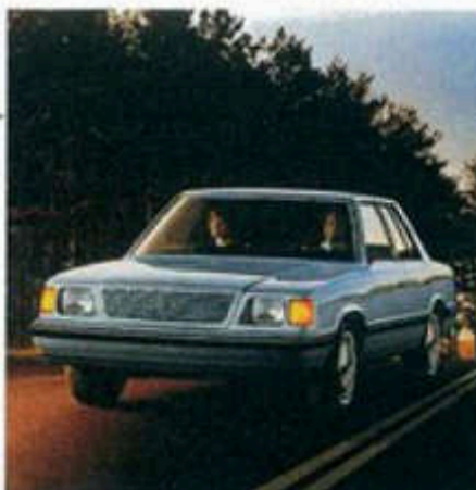
Reliant LE four-door, shown in Ice Blue Crystal Coat.

Reliant's padded instrument panel comes with a new shift indicator light (with manual transaxle only), parking