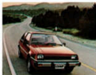
Champ Custom Hatchback with Premium Package.

Meet the Champ. A totally new car from Plymouth.