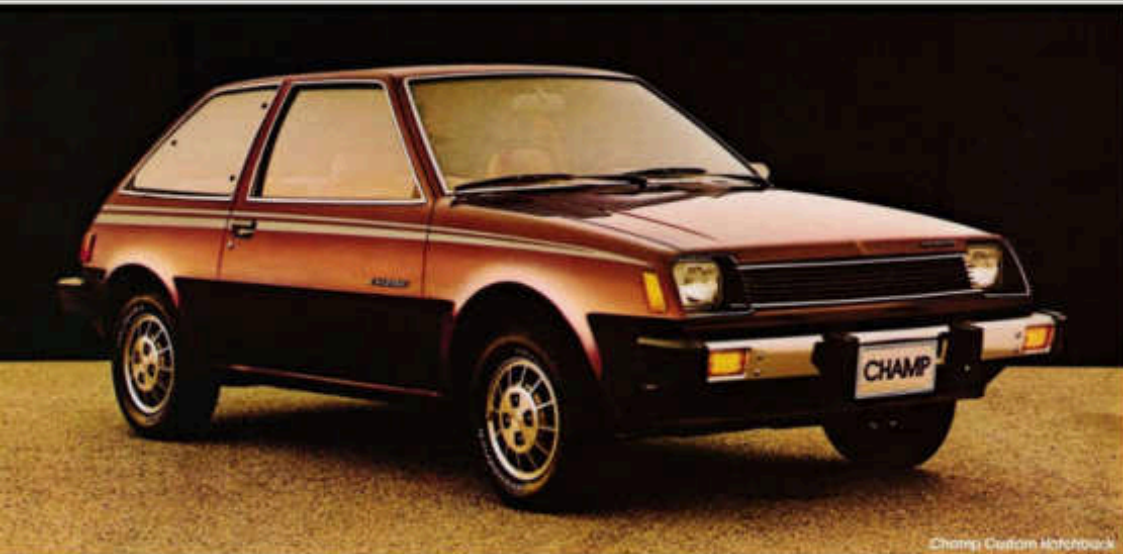
Champ Custom Hatchback