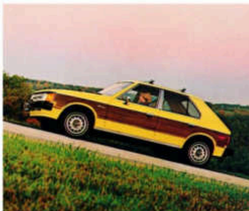
Horizon with Premium woodgrain trim and optional luggage rack.