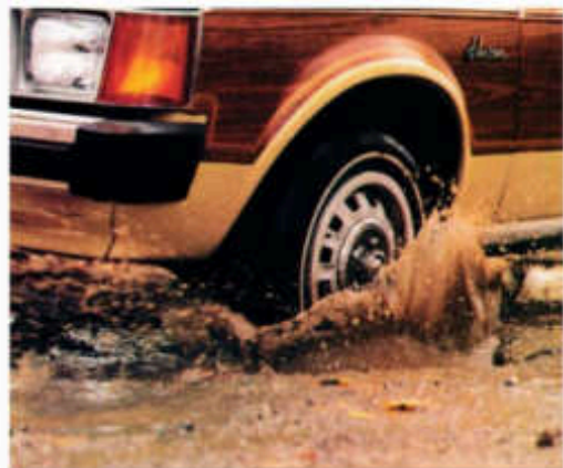
Horizon smooths out bumps and ruts.

them, coil springs to soak up road shocks. An anti-sway bar in the front suspension, anti-sway characteristics in the rear and standard glass-belted radial tires all contribute to Horizon's remarkable control and stability.