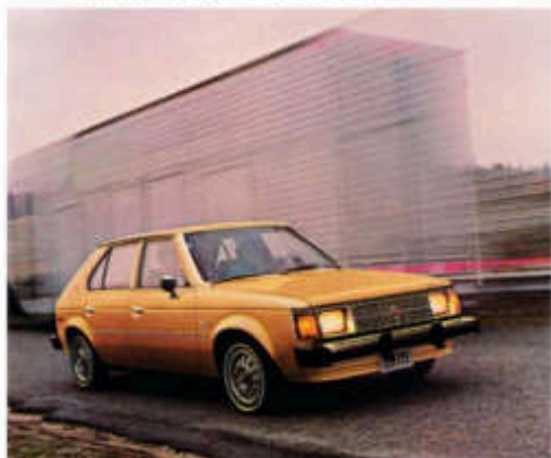
Horizon with Custom exterior trim and optional luggage rack.