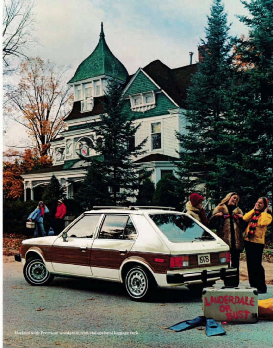
Horizon with Premium woodgrain trim and optional luggage rack.