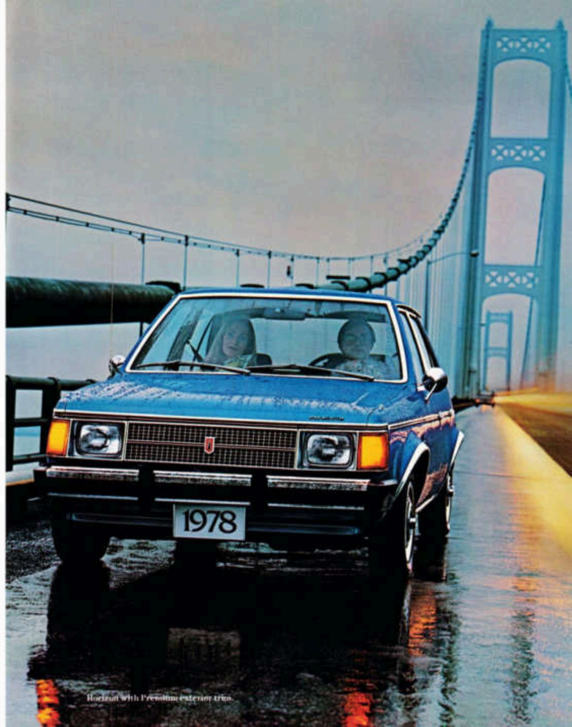
Horizon with Premium exterior trim.