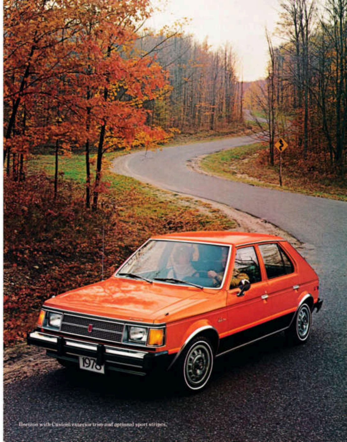
Horizon with Custom exterior trim and optional sport stripes.