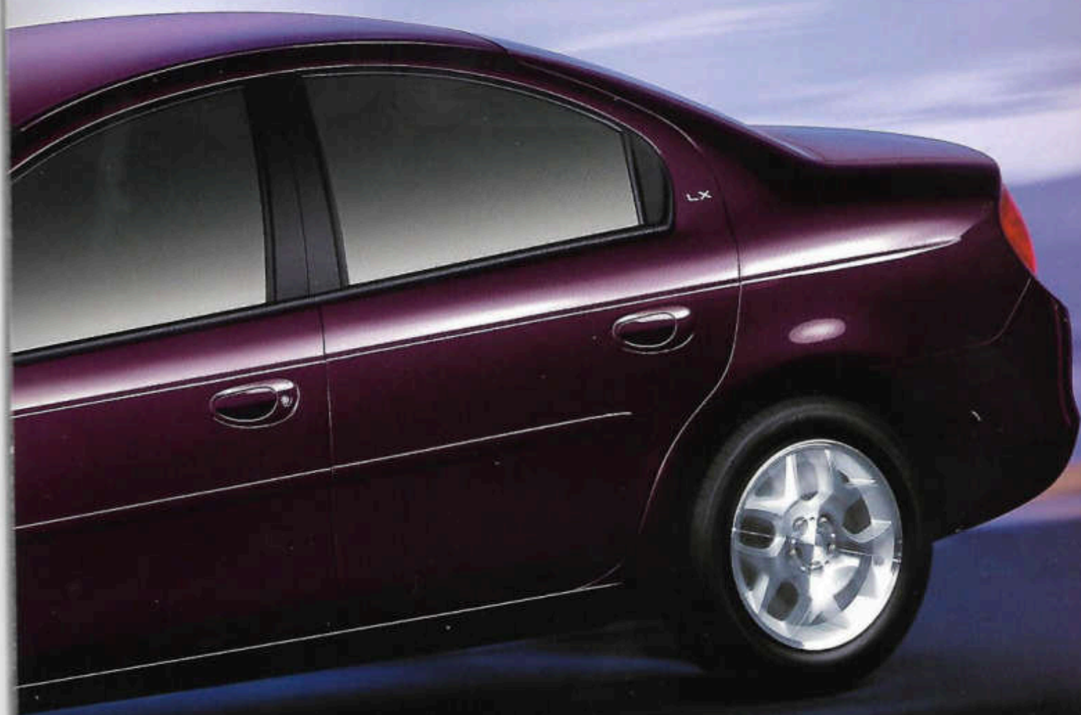
Neon LX in Deep Cranberry