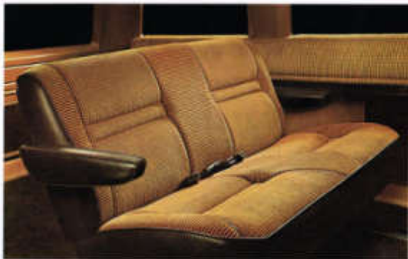
Standard low-passenger seating includes a front passenger seat with a leather padded armrest. Buckle-down is Saddle Brown cloth.