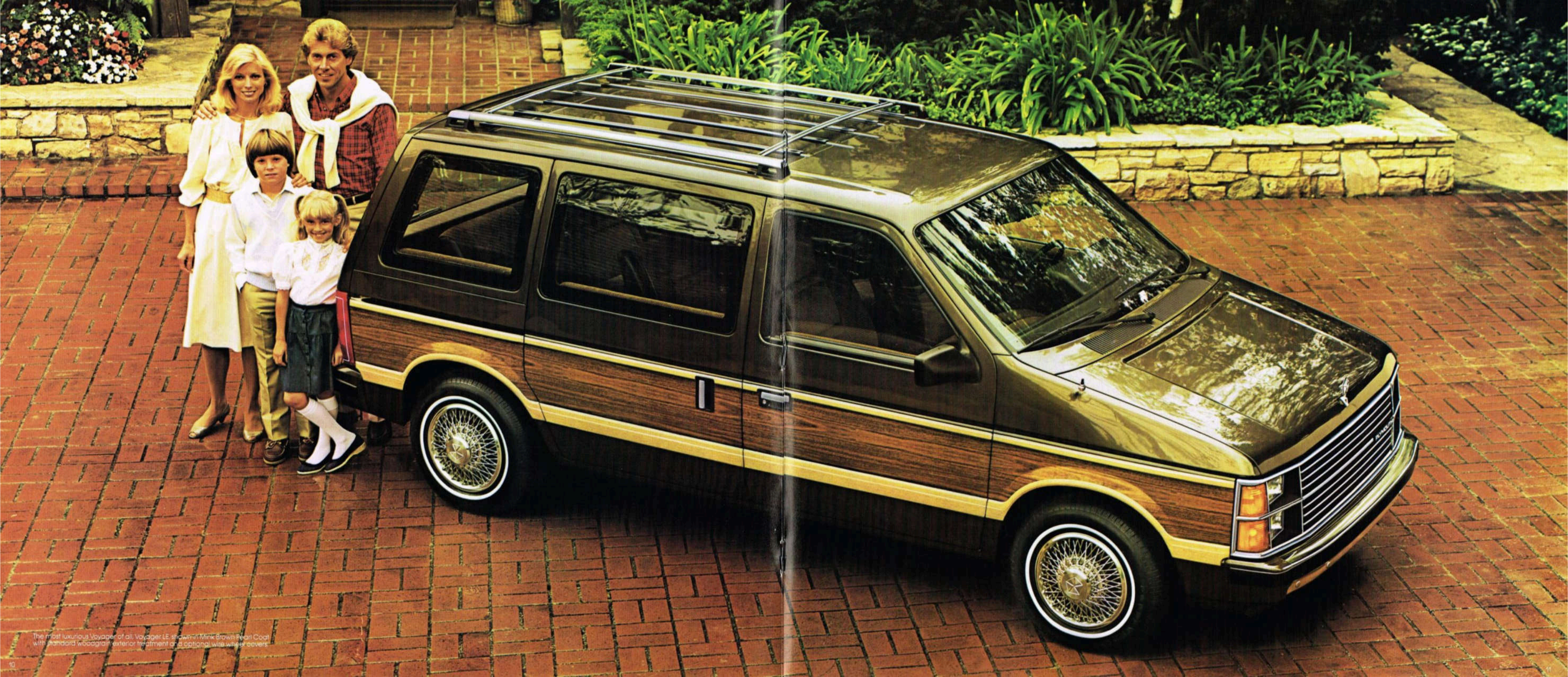
The most luxurious Voyager of all, Voyager LE shown in Mink Brown Pearl Coat with standard woodgrain exterior treatment and optional wire wheel covers.