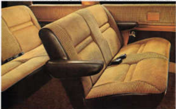
Maximum flexibility comes with the Seven Passenger Seating Package available on Voyager LE and LE models. Buckle-down is Saddle Brown cloth.