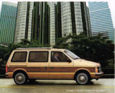
Voyager GL shown in gold with accessories