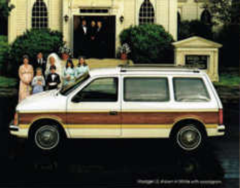
Voyager GL shown in white with accessories