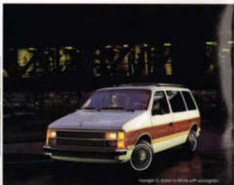
Voyager GL shown in white with accessories