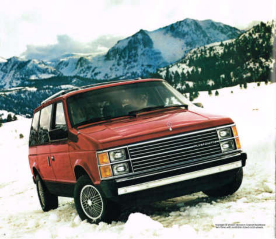
Voyager® is shown shown in Canyon Red. Other two. For an info, visit www.plymouth.com