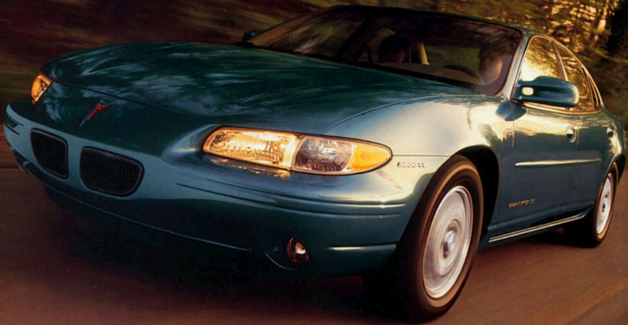
Grand Prix SE Sedan in Medium Jade-Gray Metallic with the available 16" Silver Crosslace Wheels.