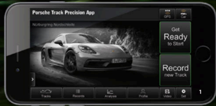
1 Porsche Track Precision app

The Sport Chrono Package also includes the Porsche Track Precision app. In conjunction with Connect Plus of Porsche Connect (see p. 34), you can clock lap times, collate driving stats, manage the results and share them with others for comparison.