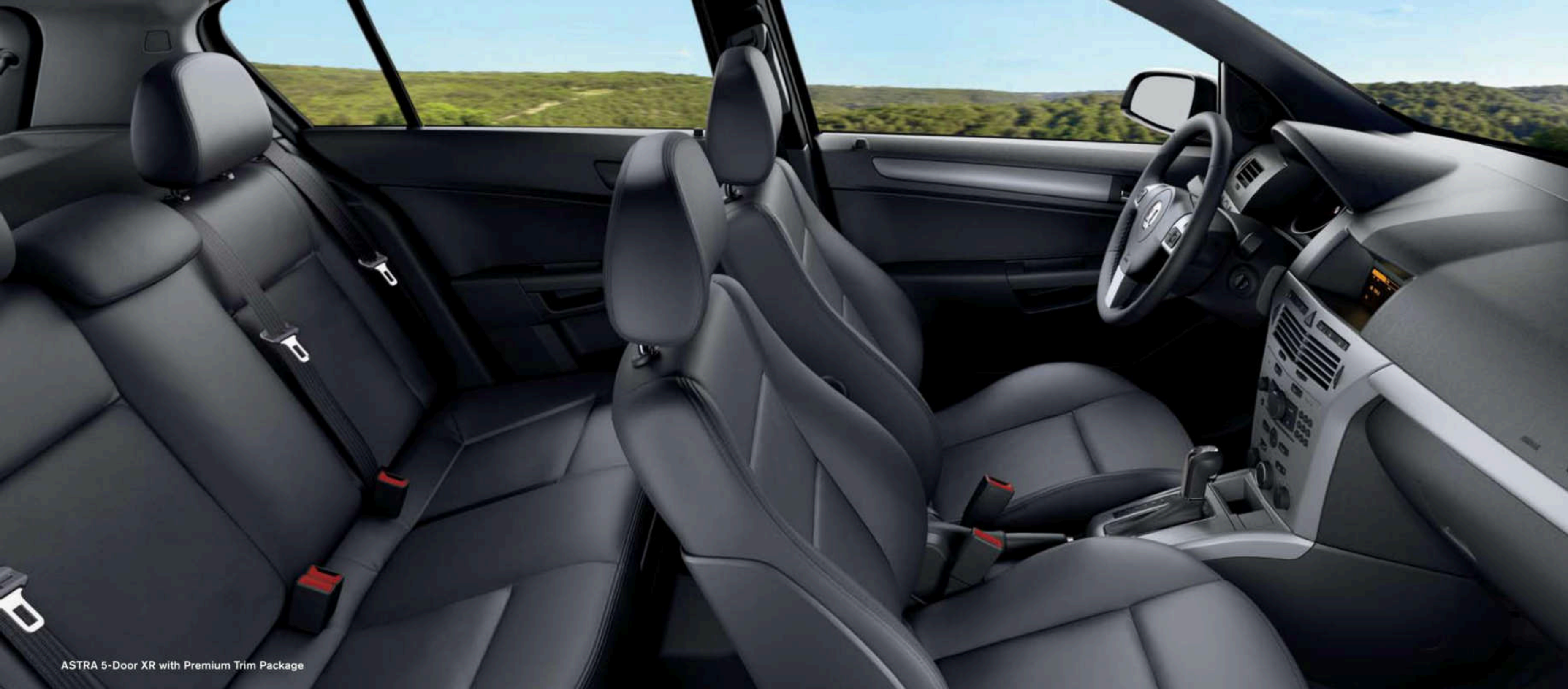
ASTRA 5-Door XR with Premium Trim Package