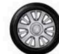
16" STEEL WITH FULL COVER (5-Door XE)