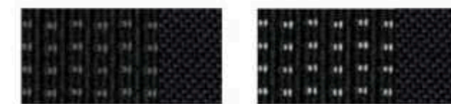
XE Charcoal XR Charcoal