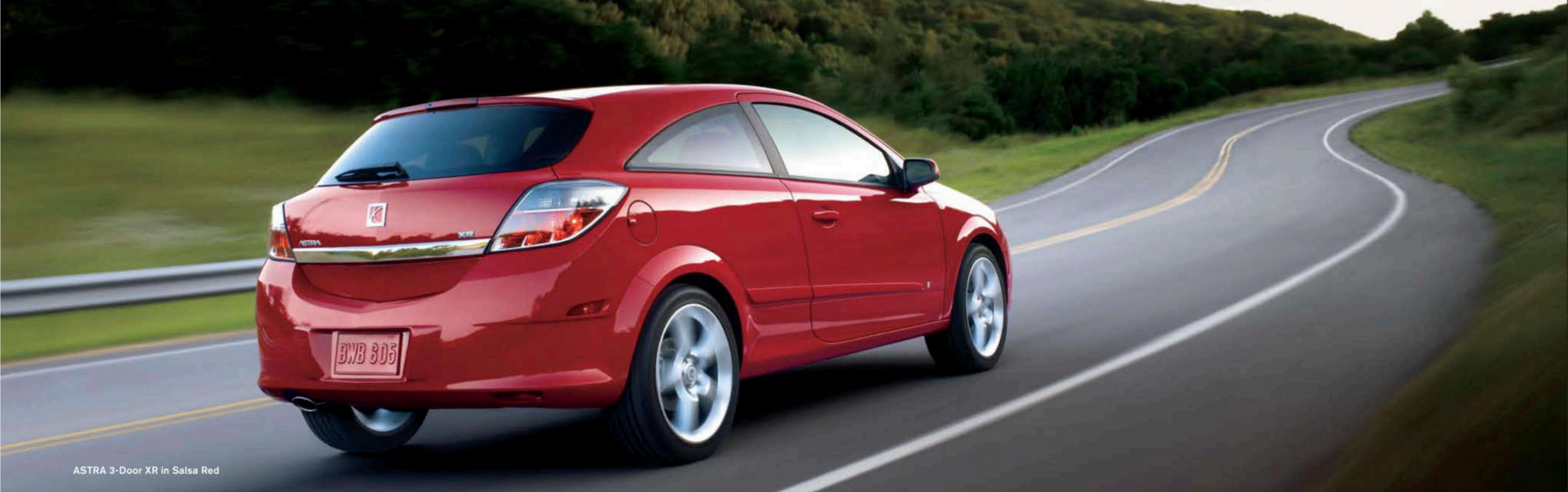
ASTRA 3-Door XR in Salsa Red