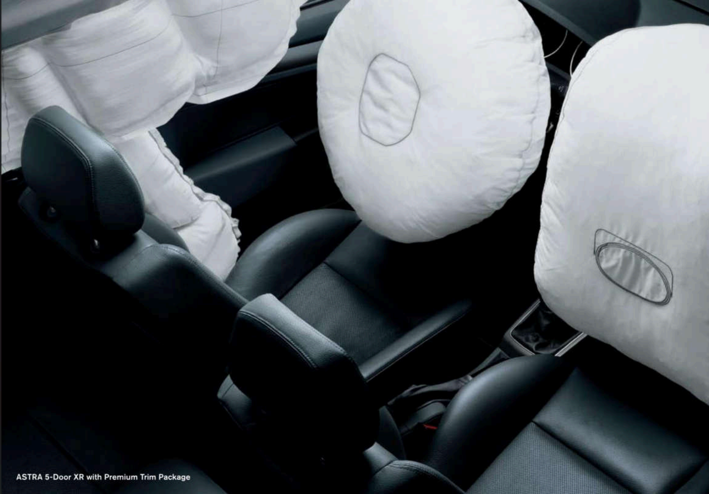
ASTRA 5-Door XR with Premium Trim Package