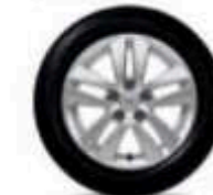
16" ALLOY (Optional on 5-Door XE, 5-Door XR)