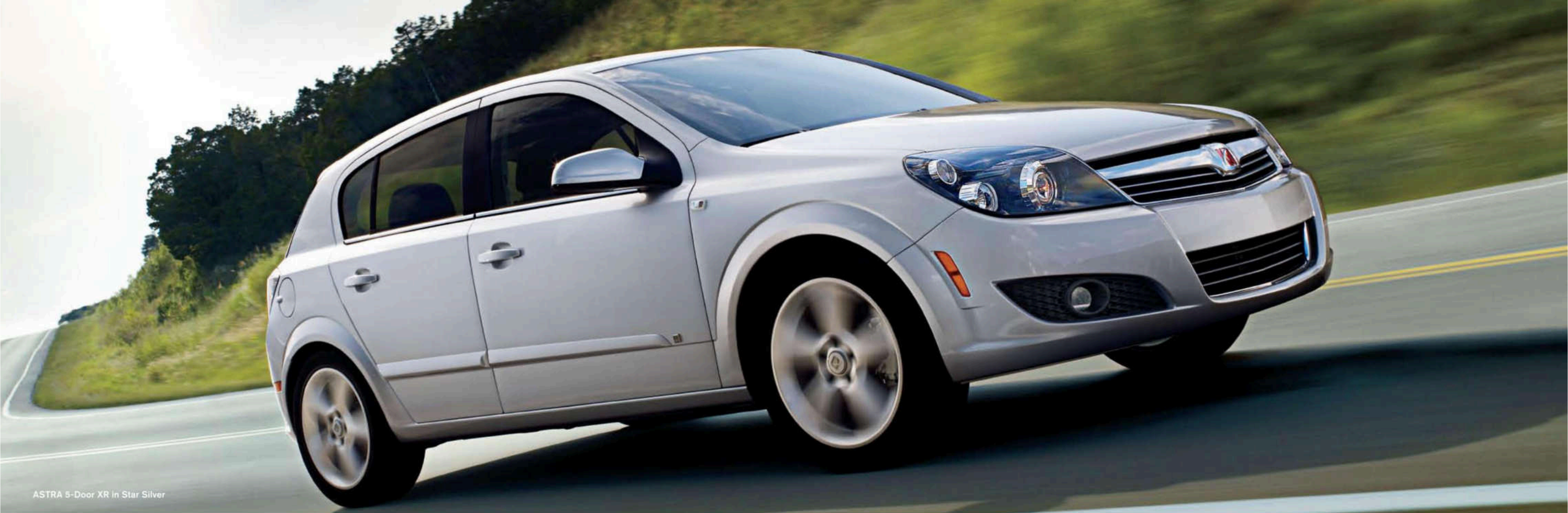
ASTRA 5-Door XR in Star Silver