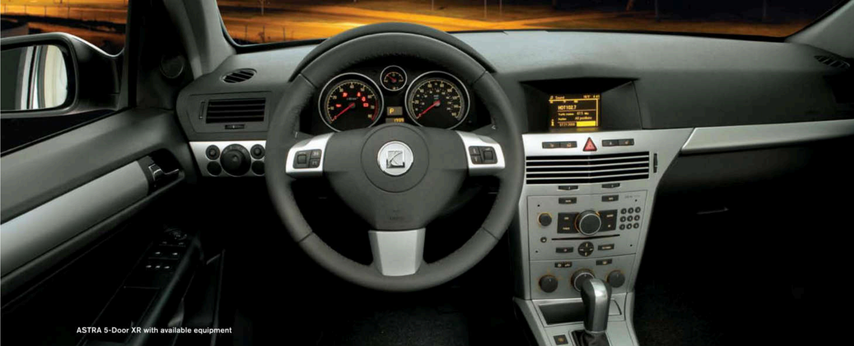
ASTRA 5-Door XR with available equipment