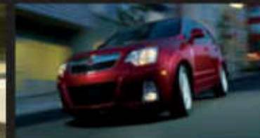
VUE 2-Mode Hybrid