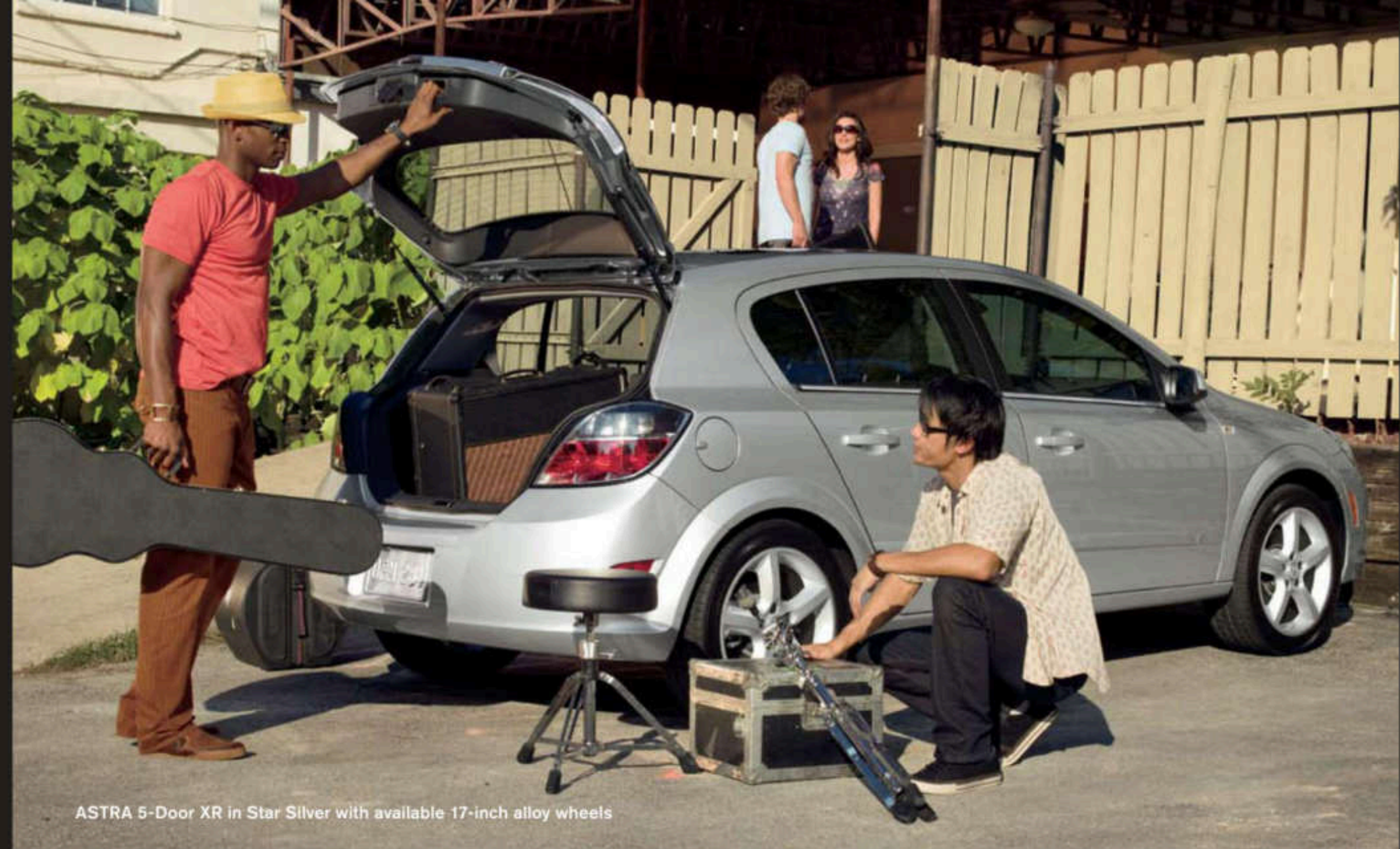
ASTRA 5-Door XR in Star Silver with available 17-inch alloy wheels