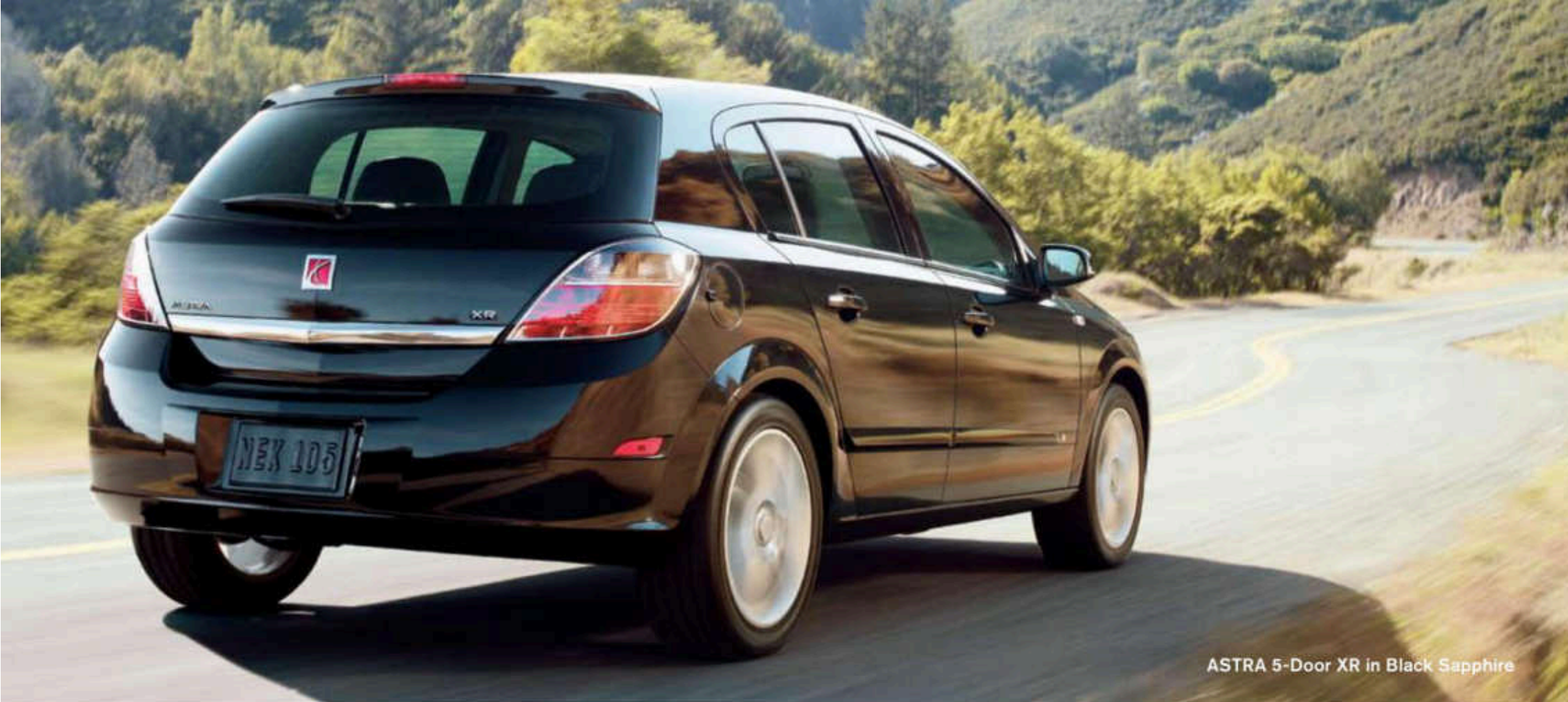
ASTRA 5-Door XR in Black Sapphire