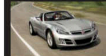
SKY Red Line