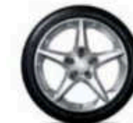
18" ALLOY (Optional on 3-Door XR)