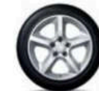
17" ALLOY (Optional on 5-Door XR)