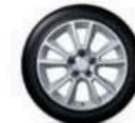
17" ALLOY (3-Door XR)