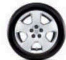
17" STANDARD TRIM (XE)