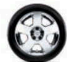
17" AVAILABLE CHROME TRIM (XE)