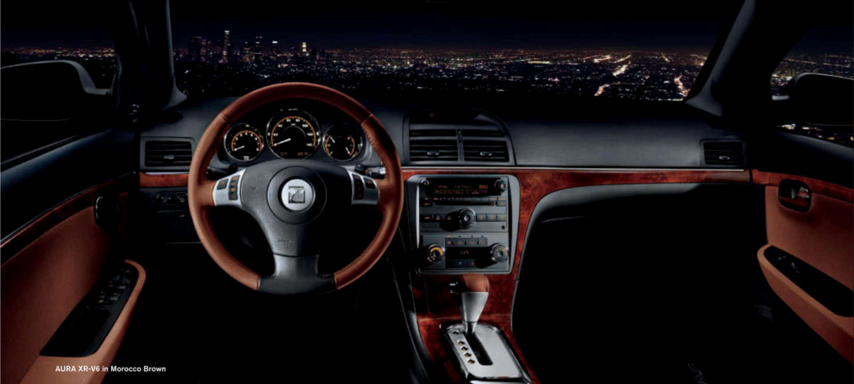
AURA XR-V6 in Morocco Brown

Rethink interior. The well-connected traveler.