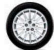
18" STANDARD ULTRABRIGHT ALLOY (XR-V6)