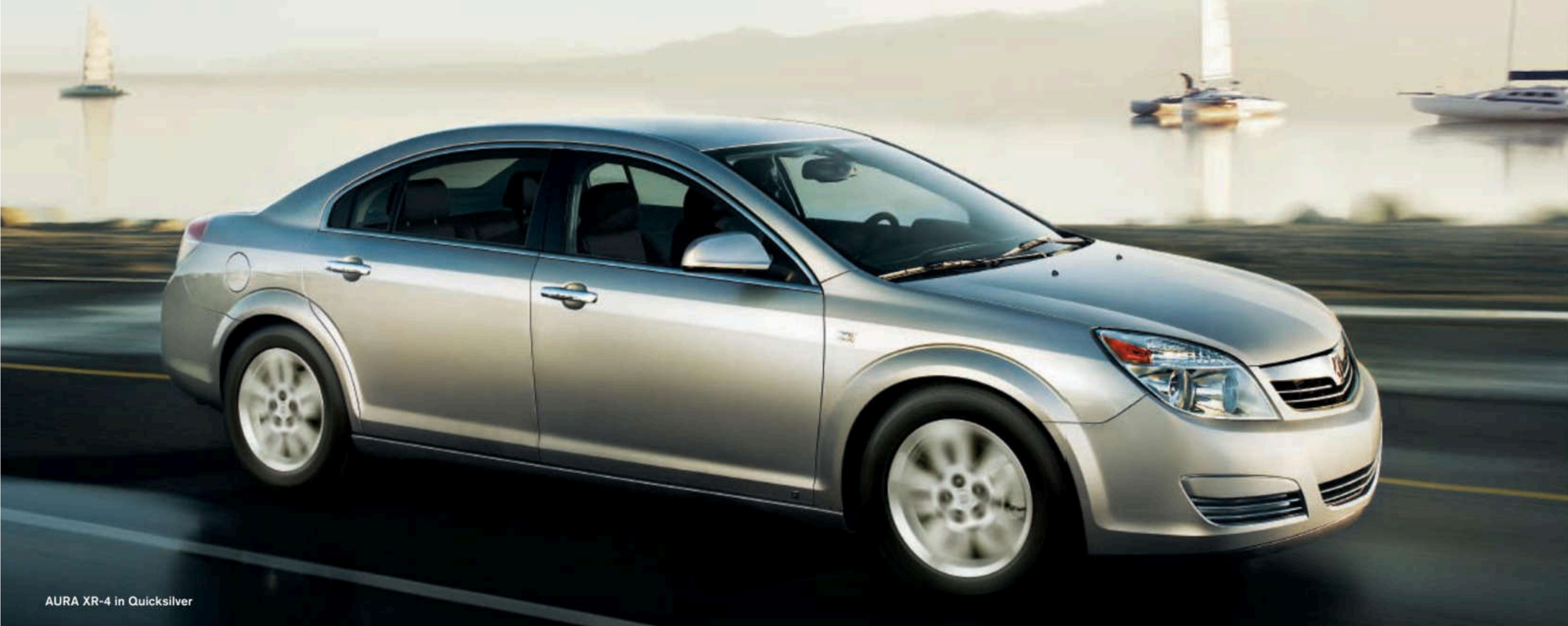
AURA XR-4 in Quicksilver

EPA-estimated 22 mpg city, 33 mpg highway