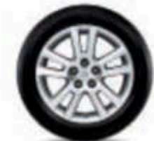
17" STANDARD MACHINED ALLOY (XR-4, Hybrid)