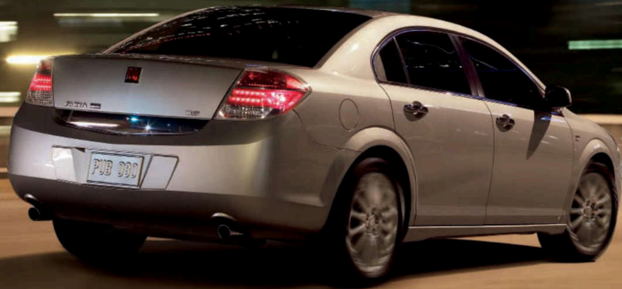
AURA XR-V6 in Quicksilver

You notice it the second you walk into a Saturn retailer. We have a no-hassle, no-haggle philosophy. We give you straightforward answers. We give you 30 days to make sure the vehicle you've chosen is the right one! 1 In fact, we've rethought what it means to be a car company. It's what we've been doing since day one. It's what makes Saturn different.