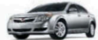
AURA HYBRID (limited availability)