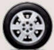
17" Standard Cover (RELAY-1 & 2)