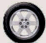
17" Available Alloy (RELAY-2)