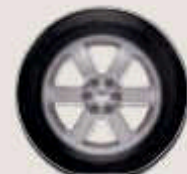
17" Standard Alloy (RELAY-3)

1 Cargo and load capacity limited by weight and distribution. 2 Maximum trailer ratings are calculated assuming a properly equipped base vehicle plus driver. The weight of other optional equipment, passengers and cargo will reduce the maximum trailer weight your vehicle can tow. See your retailer for details. 3 Based on EPA estimates. 4 Remote engine start not standard on RELAY-3. 5 Foldaway tray not available on RELAY-1. 6 Separate rear climate controls not available on RELAY-1. 7 17-inch alloy wheels standard on RELAY-3. 8 See inside back cover for important information about air bags, including a note about child safety. 9 Call 1-888-4ONSTAR (1-888-466-7827), visit onstar.com and see inside back cover for system limitations and details. 10 Navigation map covers the 48 contiguous United States and portions of Canada, but does not cover Alaska, Hawaii, Puerto Rico or the Virgin Islands. 11 Available in the 48 contiguous United States. Service fees apply. Visit gm.xmradio.com for system details.