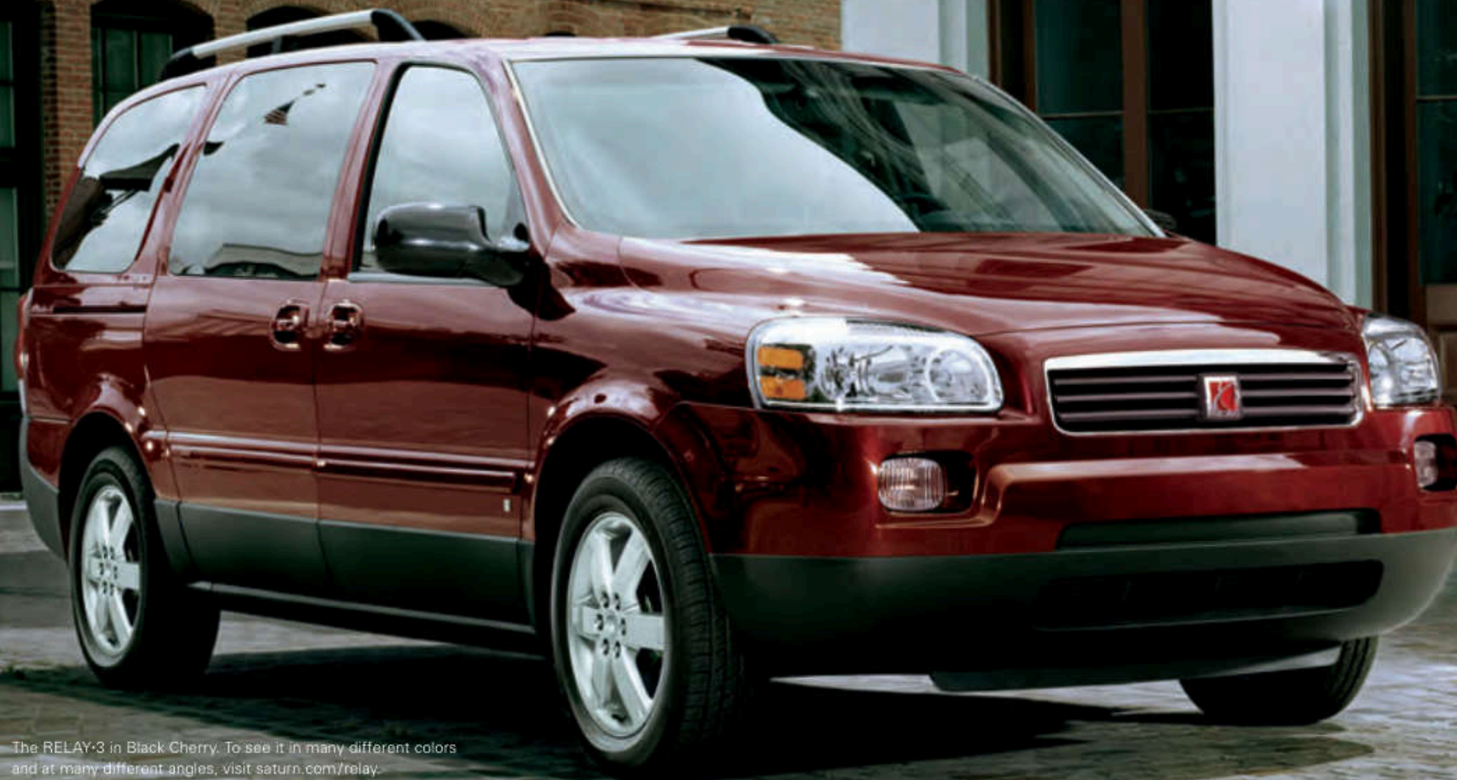
The RELAY-3 in Black Cherry. To see it in many different colors and at many different angles, visit saturn.com/relay .