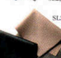
SL2, SC2, SW2