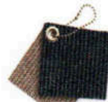
SL, SC1, SW1