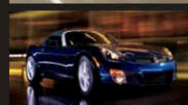
SKY Red Line