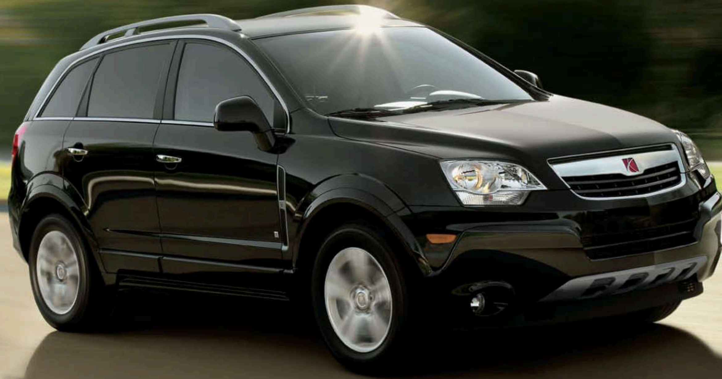
VUE XR-4 in Black Onyx

1 EPA-est. 19 mpg city, 26 mpg hwy. 2 Based on the 2008 GM Compact Utility-Crossover segment and EPA-est. 32 mpg hwy. 3 Side-impact crash test rating is for a model tested with standard head curtain side air bags (SABs). Government star ratings are part of the National Highway Traffic Safety Administration's (NHTSA's) New Car Assessment Program ( www.safercar.gov ). 4 Always use safety belts and the correct child restraint for your child's age and size. Even in vehicles equipped with air bags and the Passenger Sensing System, children are safer when properly secured in a rear seat in the appropriate infant, child or booster seat. See owner's manual for more information.