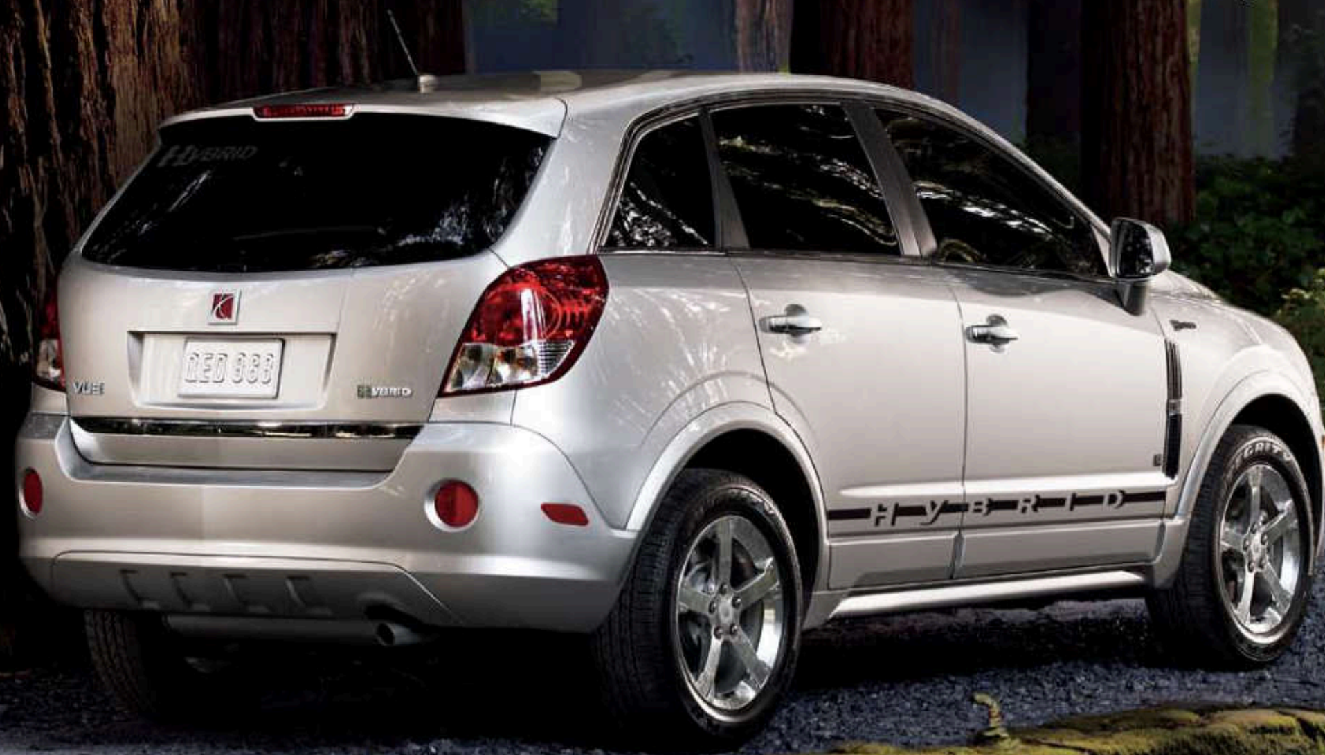
VUE Hybrid in Quicksilver