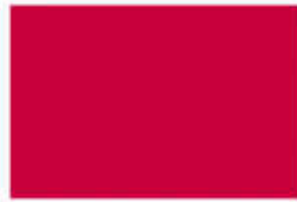
Chili Pepper Red