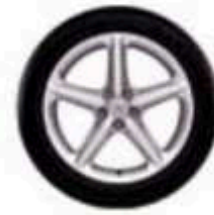
18" PAINTED ALLOY (Standard)