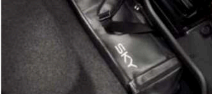
Trunk storage bag

©2007 Saturn Corporation. Saturn and its logo are registered trademarks of Saturn Corporation. SKY is a registered trademark of Saturn Corporation.