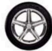
18" POLISHED ALLOY (Red Line only)