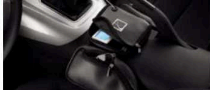
Console saddle bag