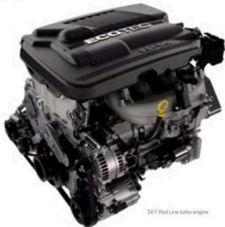
SKY Red Line turbo engine

It's a lot easier to get a jump on the weekend with a 172-hp, 16-valve, 2.4-liter engine enlivened by Variable Valve Timing, which controls both the intake and exhaust valve timing to maximize horsepower at all speeds. And with a limited slip differential, pedals set for intuitive heel-toe driving, and a short-throw five-speed manual transmission at your disposal, it's only a matter of time before you make your next getaway.