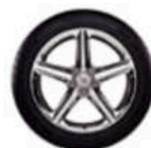
18" CHROME (Optional)