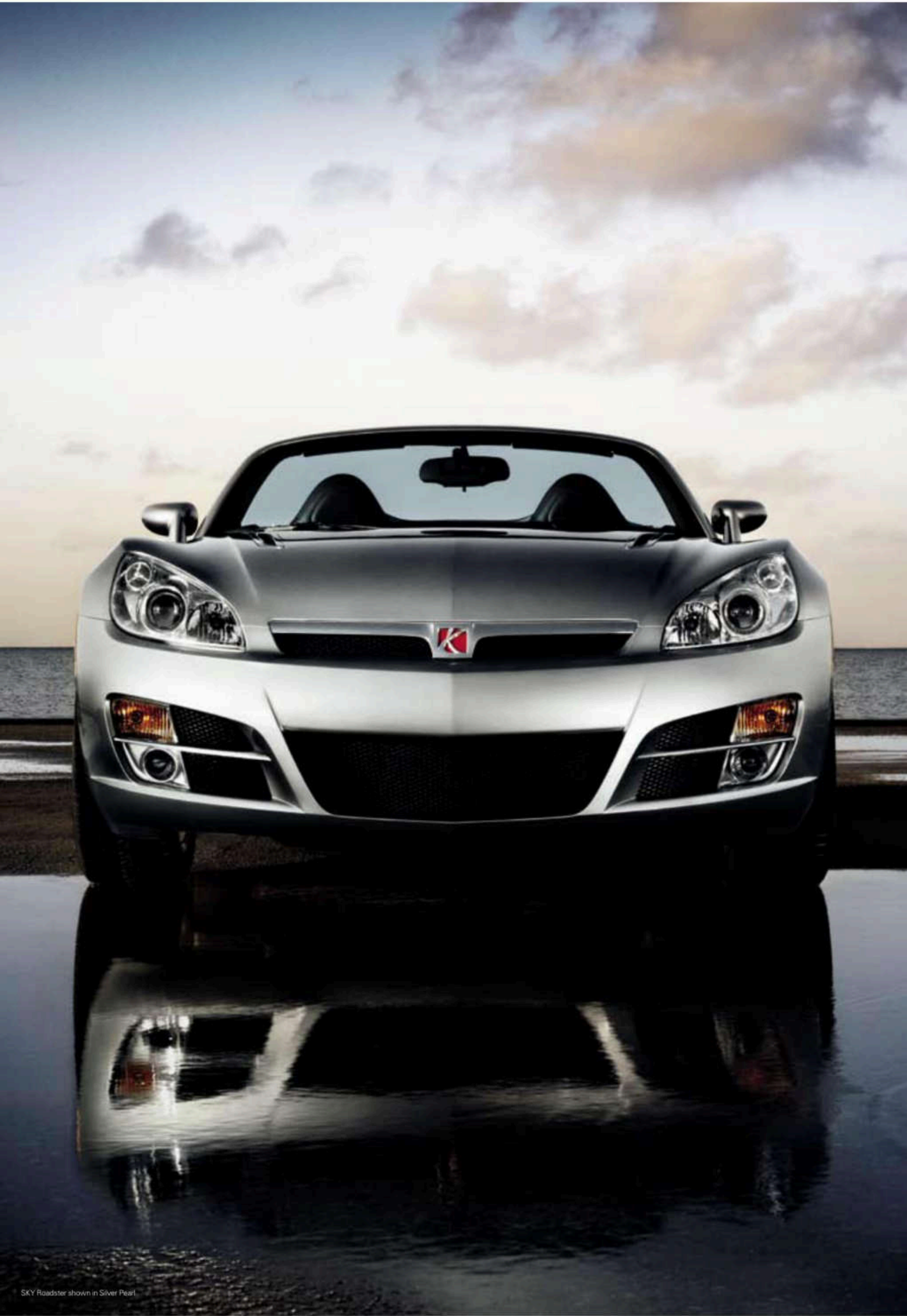
SKY Roadster shown in Silver Pearl