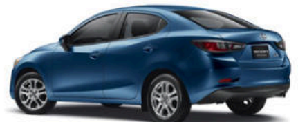
Height 58.5 In.