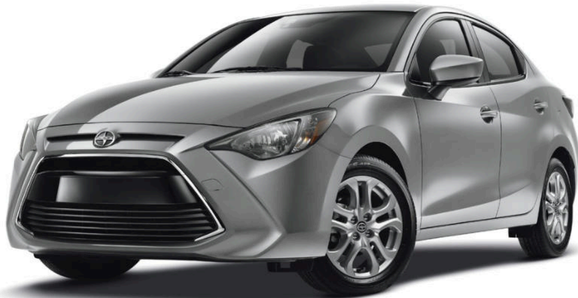
Color Shown Sterling

This is Scion's first sedan. Sophisticated, sculpted styling with an aggressive grille, this car's got the looks and the features to help you arrive in style.