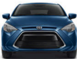
Width 66.7 In.