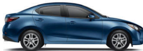
Length 171.7 In.