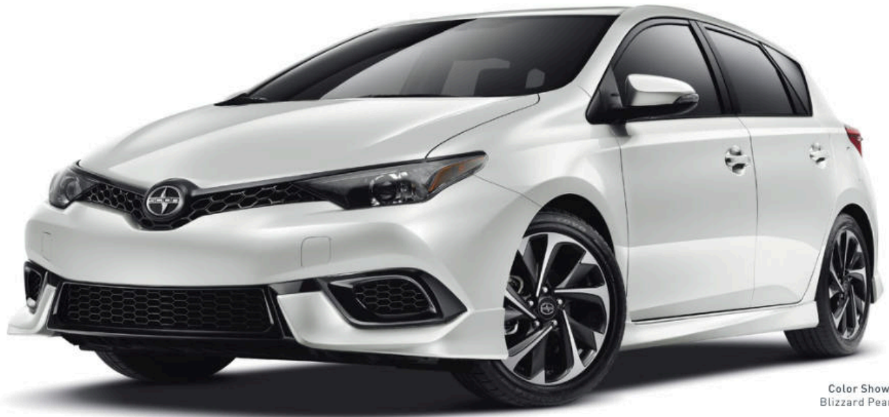
Color Shown Blizzard Pearl

The Scion iM was made to go outside and play. This five-door hatchback gives you the versatility you'll need to go find your fun.