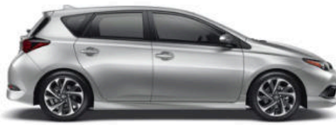
Length 170.5 In.