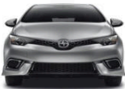
Width 69.3 In.