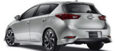
Height 55.3 In.