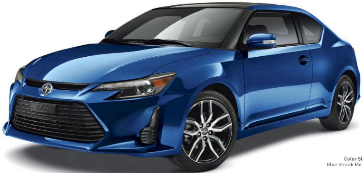
Color Shown Blue Streak Metallic