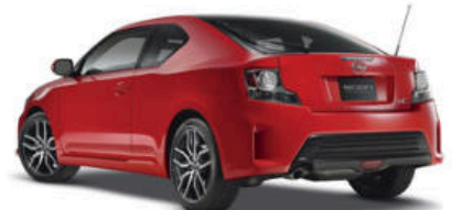
Height 55.7 In.