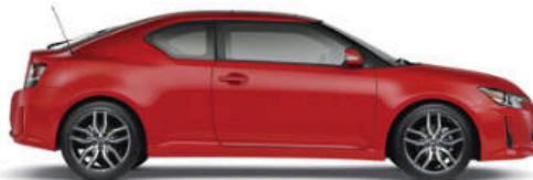
Length 176.6 In.