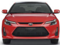
Width 70.7 In.