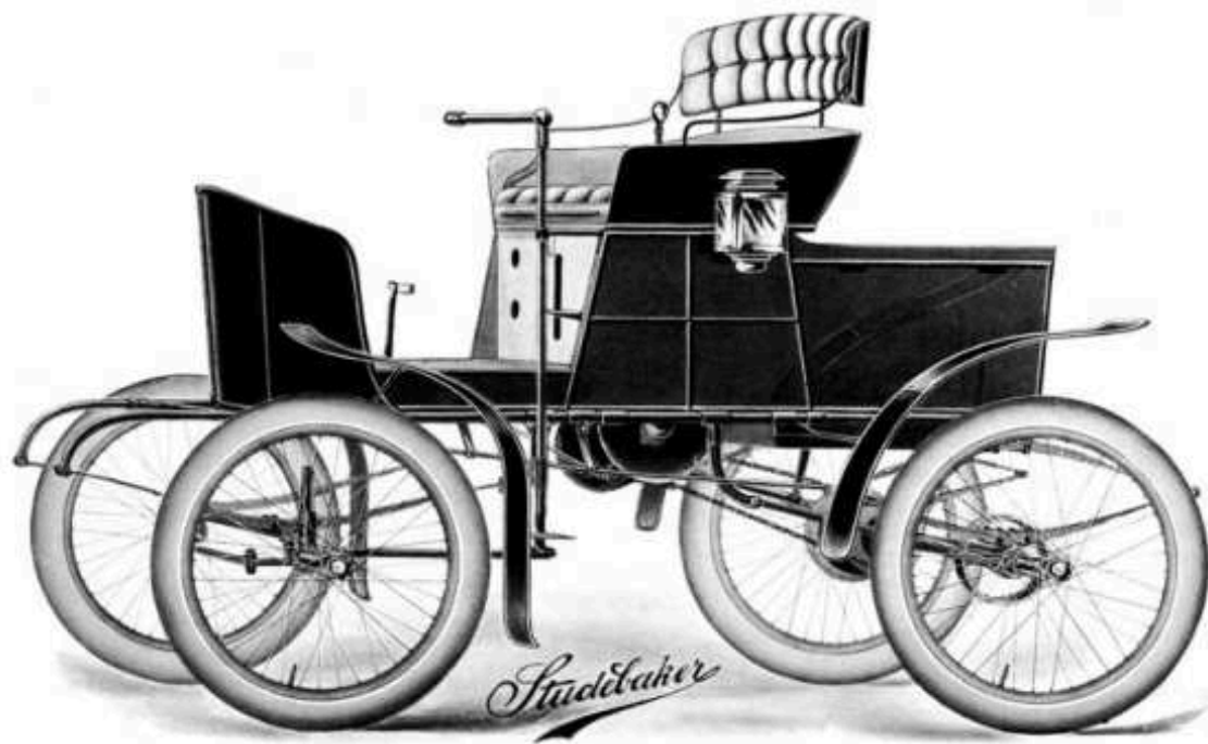
NO. 1367. STUDEBAKER TRAP WITH LEATHER TOP IF DESIRED