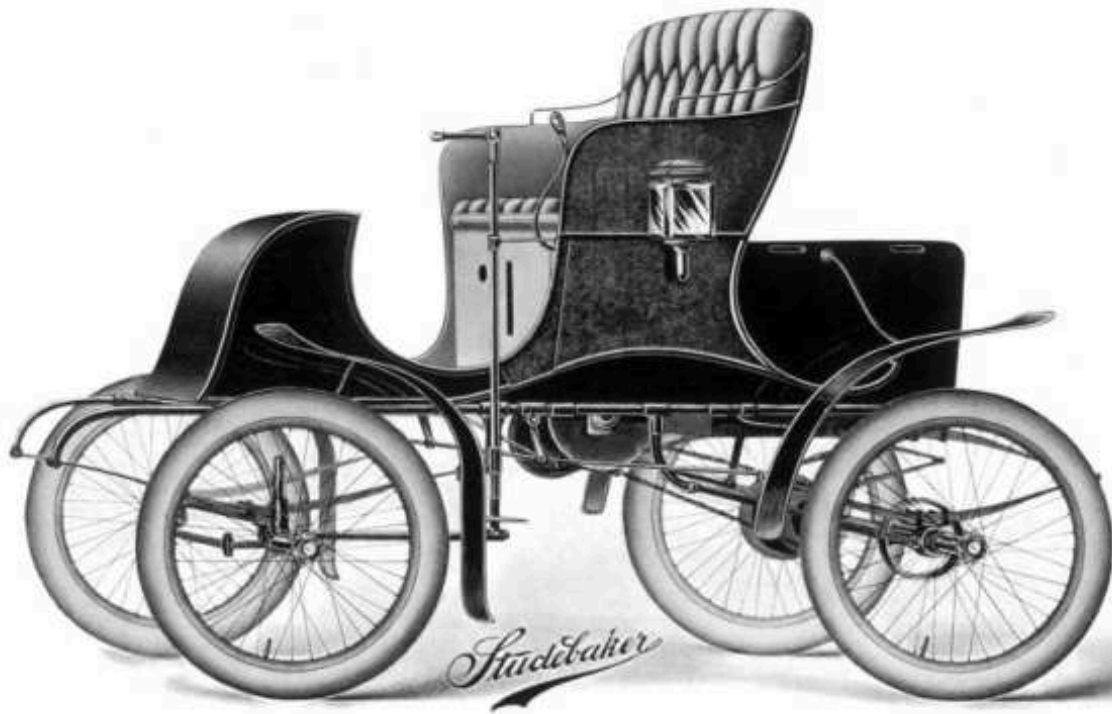
NO. 1358. STUDEBAKER STANHOPE