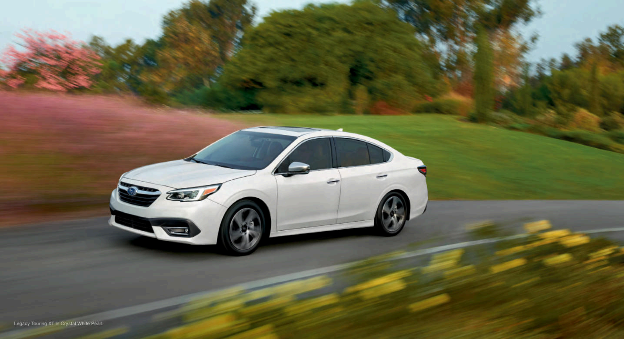
Legacy Touring XT in Crystal White Pearl.