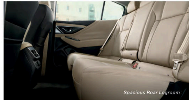
Spacious Rear Legroom

The most comfortable and spacious Legacy ever.