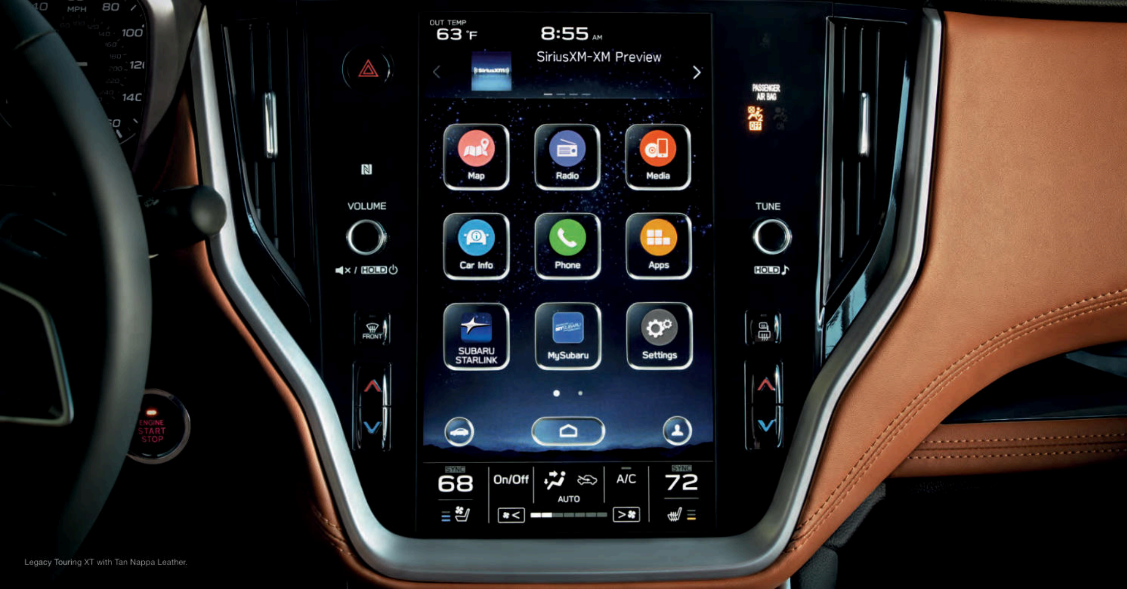
Legacy Touring XT with Tan Nappa Leather.