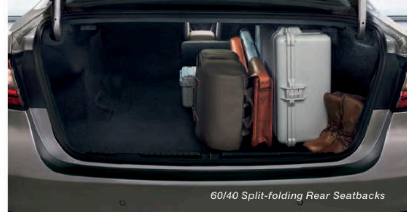
60/40 Split-folding Rear Seatbacks