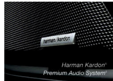
Harman Kardon® Premium Audio System 5

The Legacy makes it easy to stay connected and engaged. The all-new 11.6-inch touchscreen makes it easy and intuitive to customize your entertainment options, climate settings and more. 5 The updated SUBARU STARLINK™ Multimedia system features standard Apple CarPlay® and Android™ Auto integration. There's also built-in Wi-Fi capability, 5,11 and with the 576-watt-equivalent, 12-speaker premium audio system designed by Harman Kardon, ® all your playlists shine through with state-of-the-art sonic clarity. 5