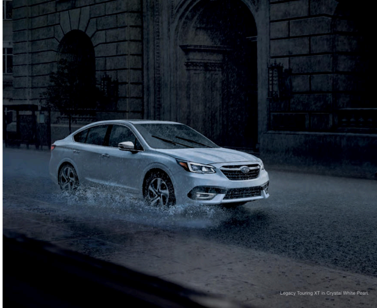
Legacy Touring XT in Crystal White Pearl.