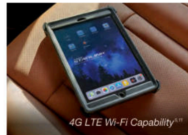
4G LTE Wi-Fi Capability 5,11