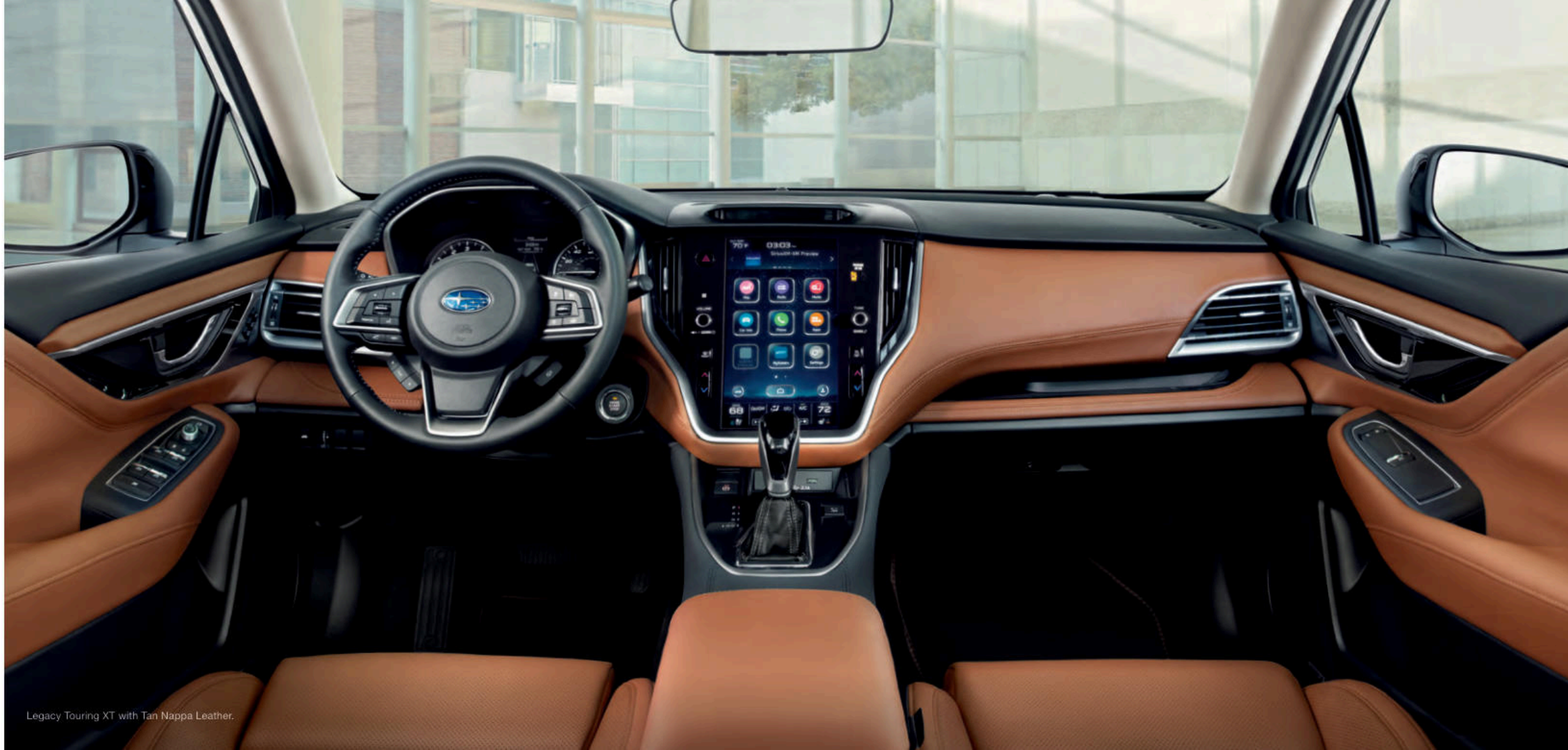
Legacy Touring XT with Tan Nappa Leather.