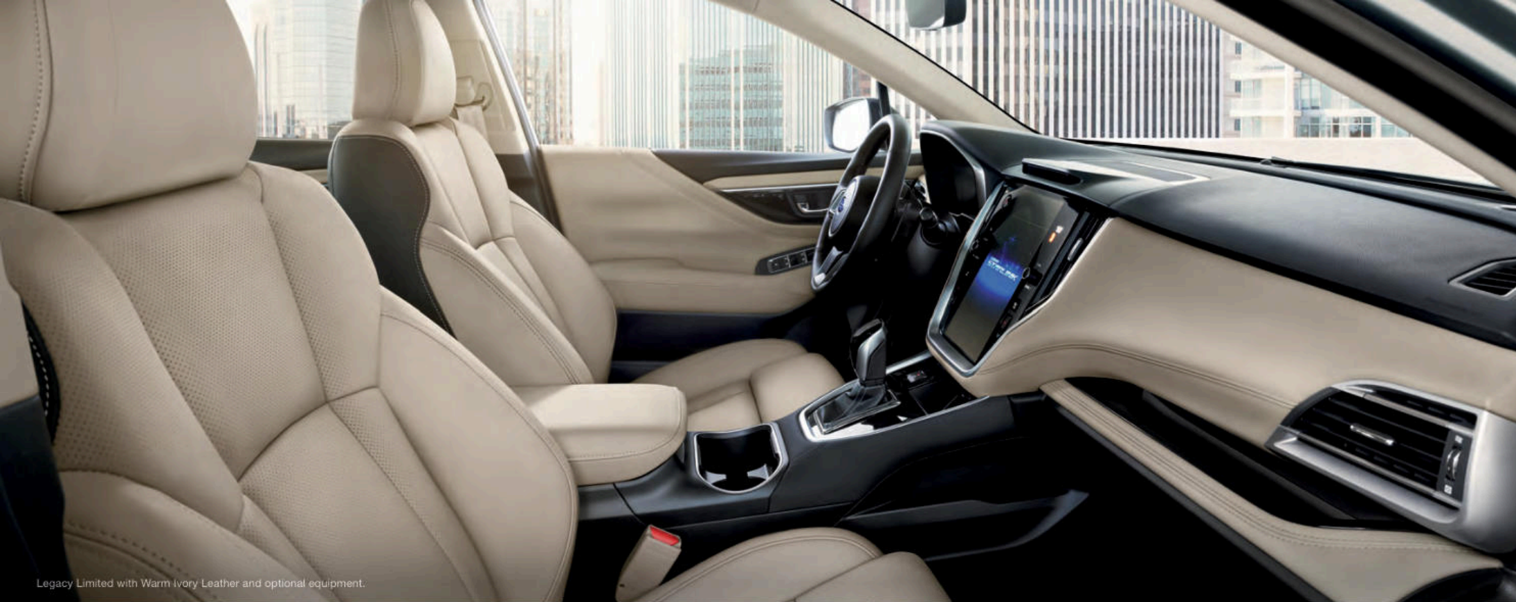
Legacy Limited with Warm Ivory Leather and optional equipment.