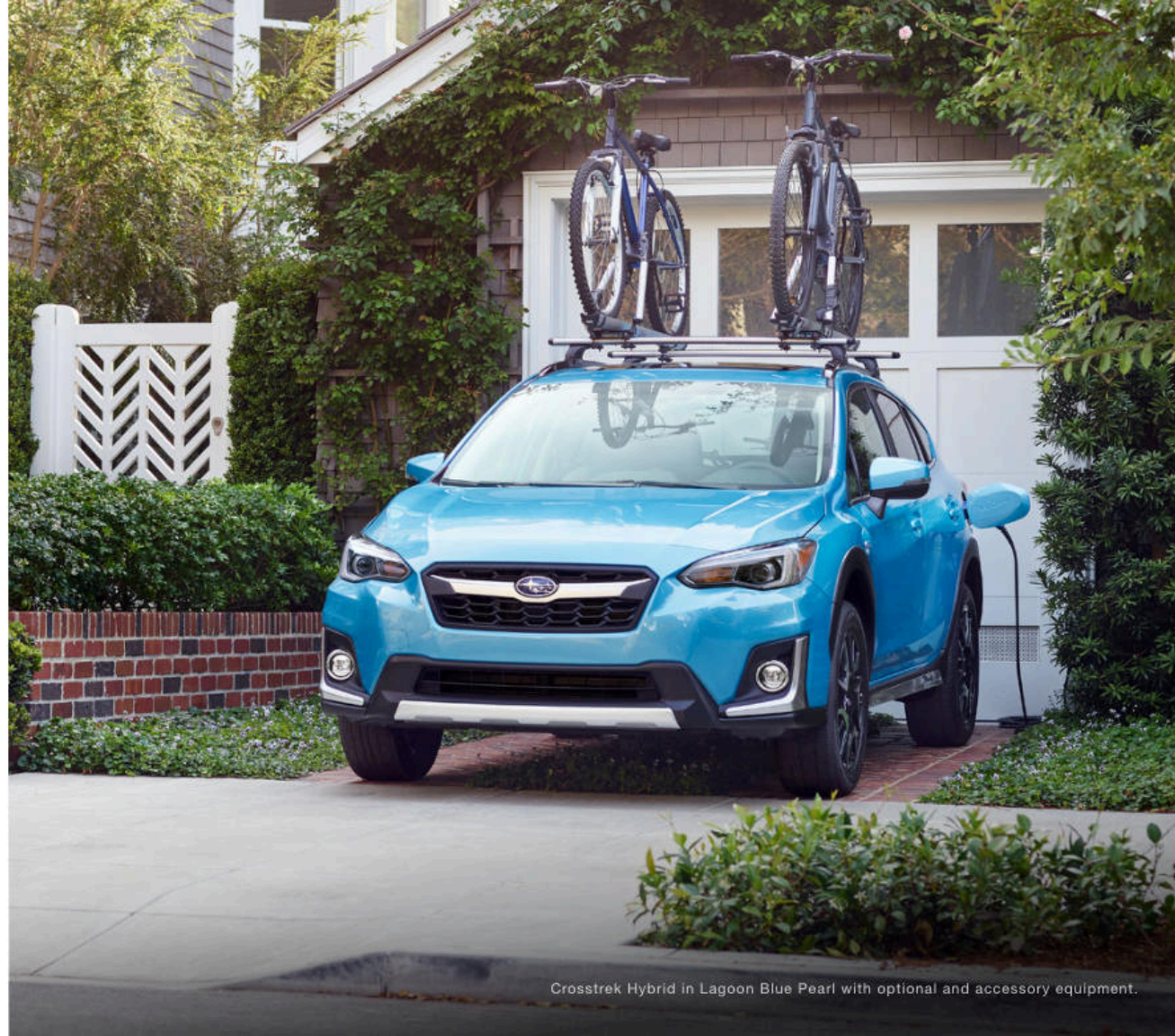
Crosstrek Hybrid in Lagoon Blue Pearl with optional and accessory equipment.

Battery Save Mode preserves the battery level for later use. Battery Charge Mode uses the gas engine to charge the battery, adding up to four miles of electric range for every 30 minutes of driving.