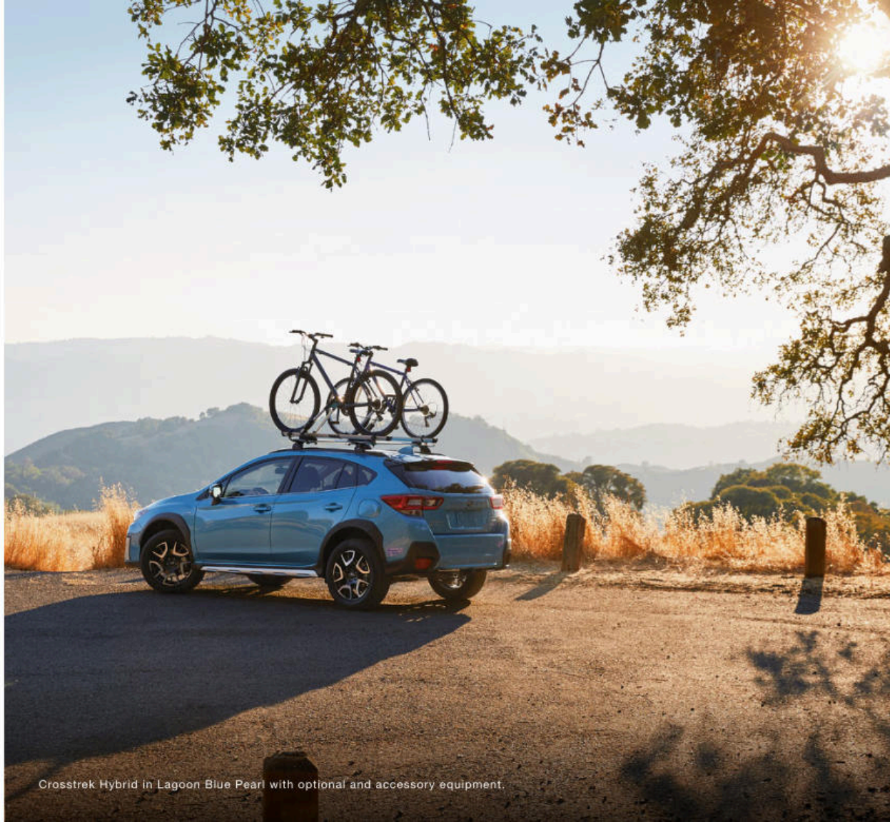
Crosstrek Hybrid in Lagoon Blue Pearl with optional and accessory equipment.