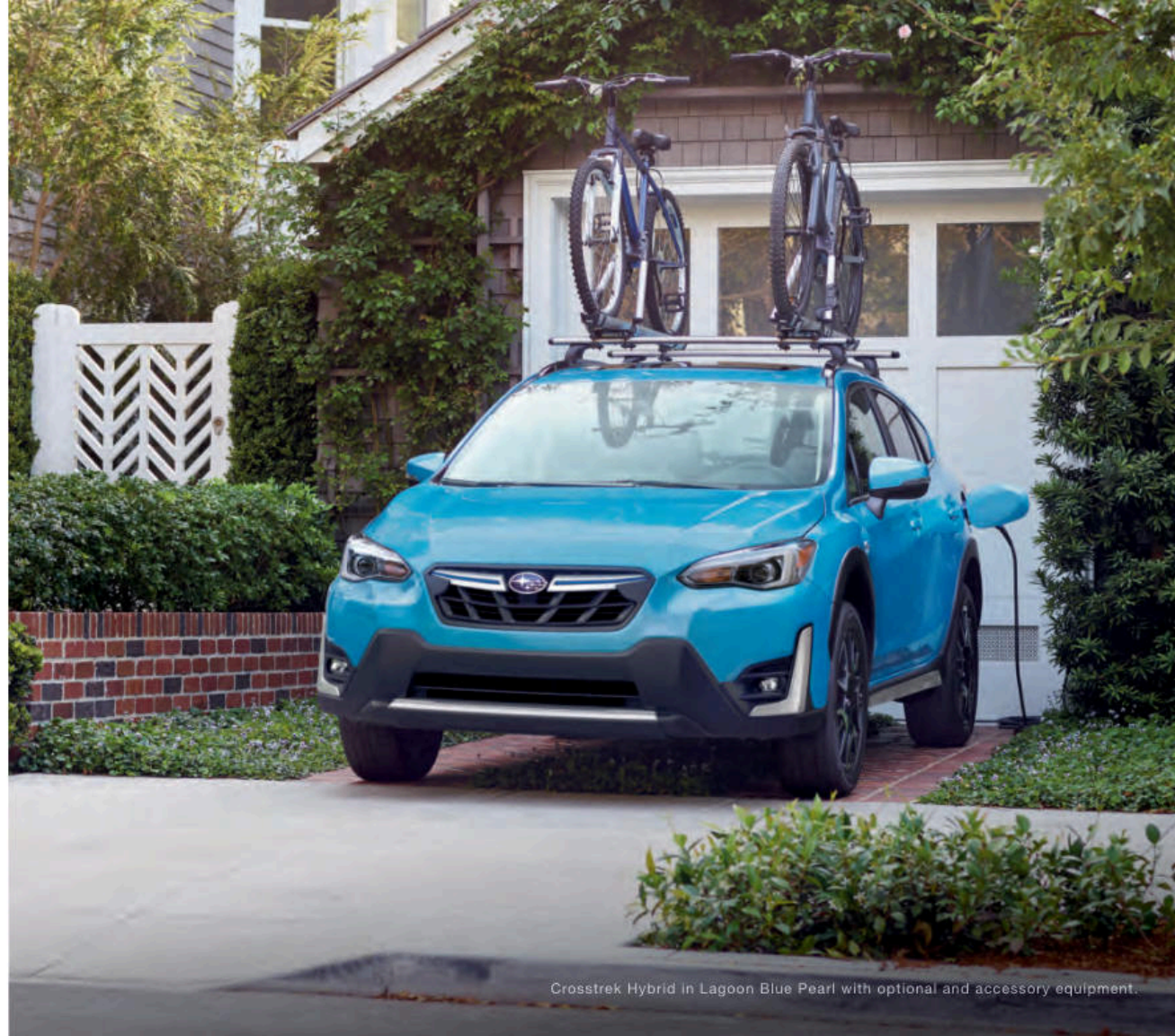
Crosstrek Hybrid in Lagoon Blue Pearl with optional and accessory equipment.

Battery Save Mode preserves the battery level for later use. Battery Charge Mode uses the gas engine to charge the battery, adding up to four miles of electric range for every 30 minutes of driving.