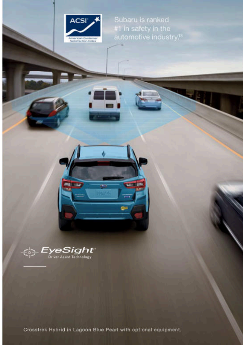
Crosstrek Hybrid in Lagoon Blue Pearl with optional equipment.

Pre-Collision Throttle Management can reduce your engine power to help give you more time to react.