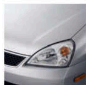
Silky Silver Metallic ●

See your Suzuki dealer for a full lineup of accessories to add to your ride. Make sure to go to suzuki.com for the latest specification information.