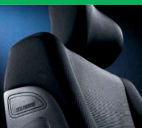
Aerio Premium AWD Package shown. Some features may not be available on some models. Please refer to Specifications pages for complete information.

Why is it America's #1? It's the only 100,000-mile/7-year powertrain limited warranty around that doesn't have a deductible and is fully transferable for the life of the warranty. That's huge, and that's why the other guys don't talk about their warranties and the other guys who don't talk about theirs aren't covered — you don't pay anything for parts and labor. Fully transferable means the warranty can pass from one owner to the next, increasing resale value. In other words, it's time to buy your next car. With coverage extended for 100,000 miles or 7 years, whichever comes first, you can always have a car you can rely on. The strength of this long-term powertrain protection is complemented by 36,000-mile/3-year new-vehicle limited warranty that also has no deductible and covers everything from the dome light to the exhaust pipe. (Except the battery, which is covered by 24,000 miles, and tires, which are covered by the tire manufacturer's warranty), and includes comprehensive 24-hour Roadside Assistance as well as a Courtesy Vehicle Program. So that's why you can say it's America's #1. Sounds good, doesn't it?