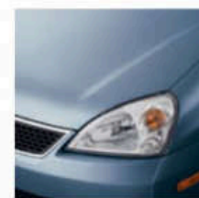
Ice Blue ●