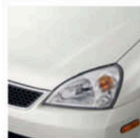
White Pearl ●