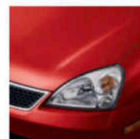
Racy Red ●