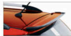
Crossover Rear Spoiler