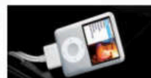
iPod ®14 Interface