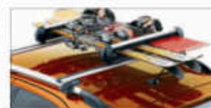
Mont Blanc ®16 Removable Roof Rack System and Modules (Ski Module Shown)