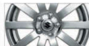
Chrome Alloy Wheels 15