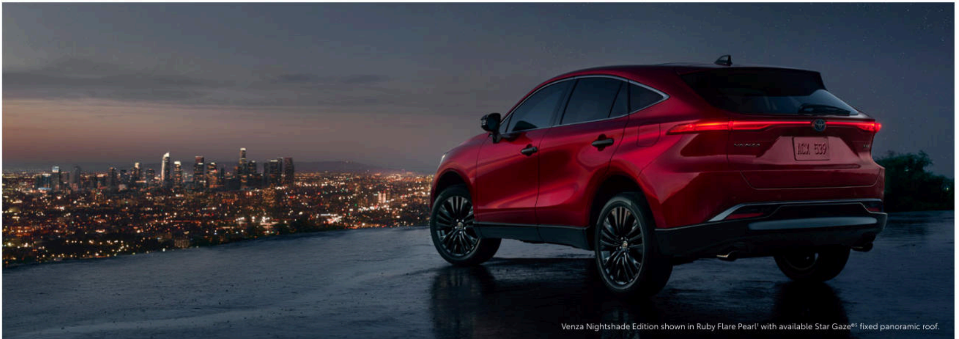
Venza Nightshade Edition shown in Ruby Flare Pearl 1 with available Star Gaze ® fixed panoramic roof.