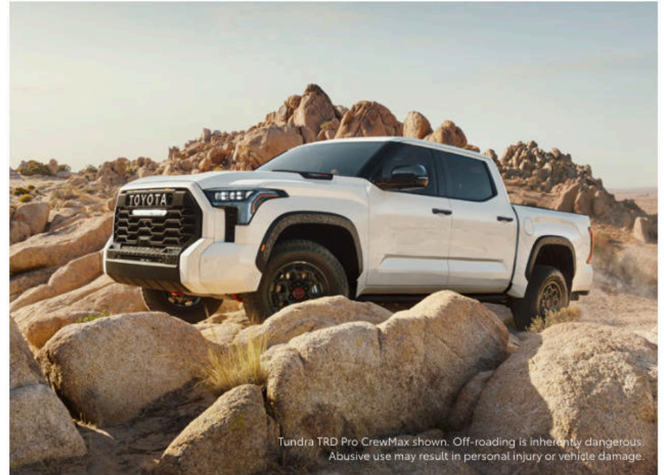
Tundra TRD Pro CrewMax shown. Off-roading is inherently dangerous. Abusive use may result in personal injury or vehicle damage.

Built to last and dominate trails, Tacoma and Tundra are legends through and through. Play harder than ever before with a truck capable of conquering the earth.