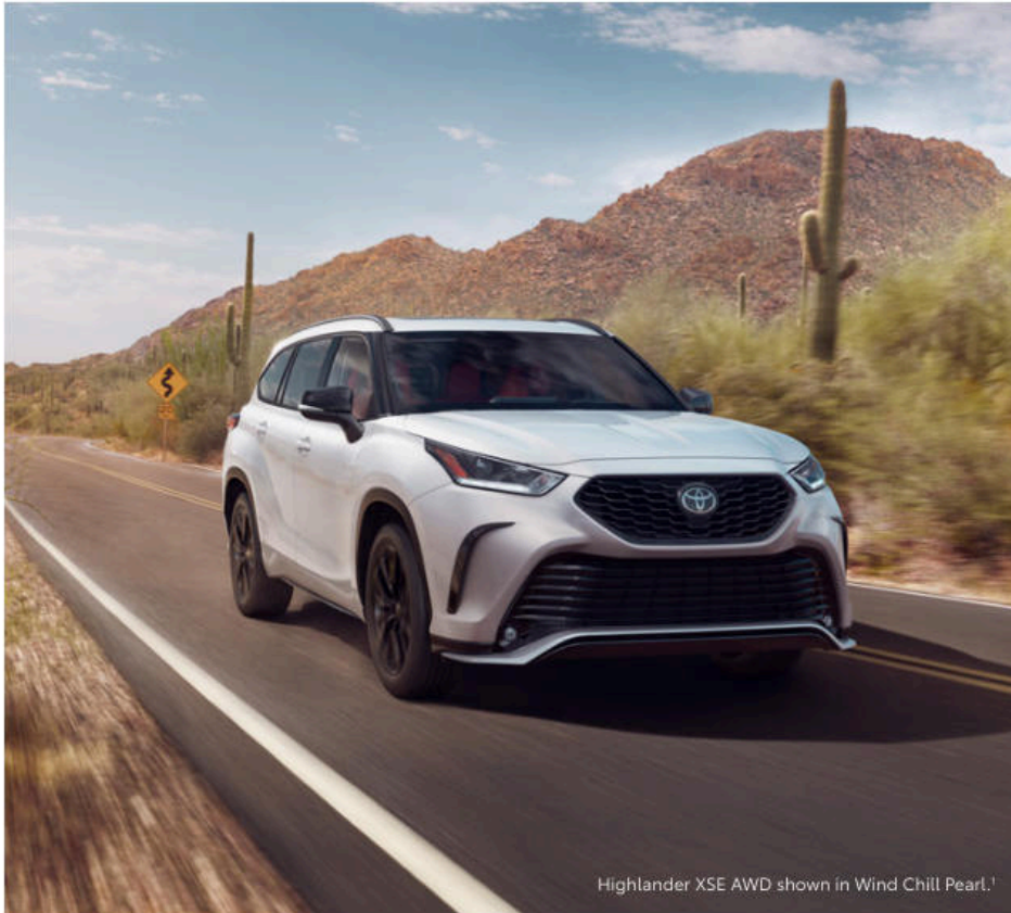
Highlander XSE AWD shown in Wind Chill Pearl. 1