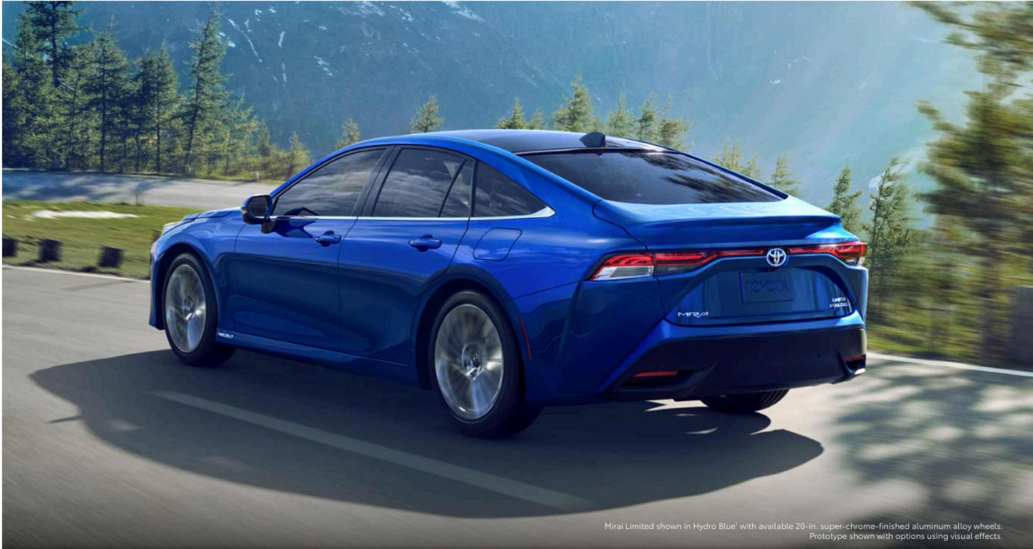
Mirai Limited shown in Hydro Blue 1 with available 20-in. super-chrome-finished aluminum alloy wheels. Prototype shown with options using visual effects.

Zero emissions and super efficient. Mirai's innovative Fuel Cell Stack creates power out of hydrogen and thin air — literally. Available in California.