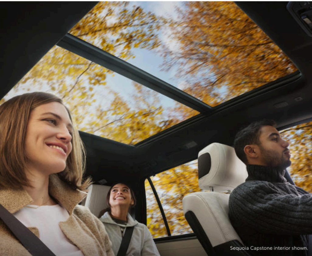
Sequoia Capstone interior shown.