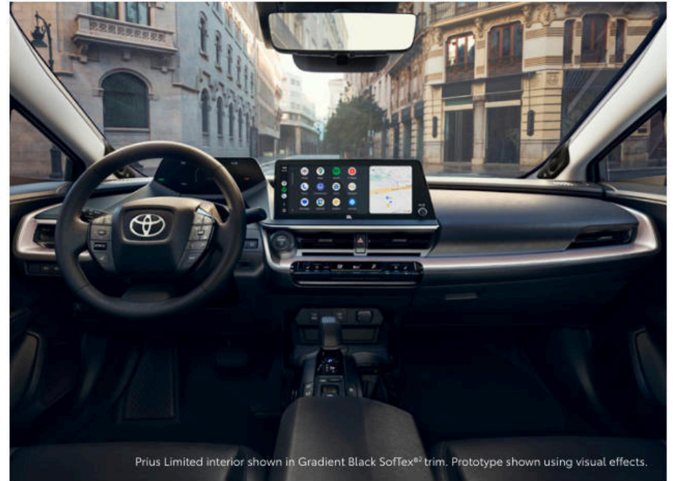
Prius Limited interior shown in Gradient Black SofTex® trim. Prototype shown using visual effects.

Stunning design and an inspiring drive, with the advanced tech, fuel efficiency and reliability you've come to know and trust.