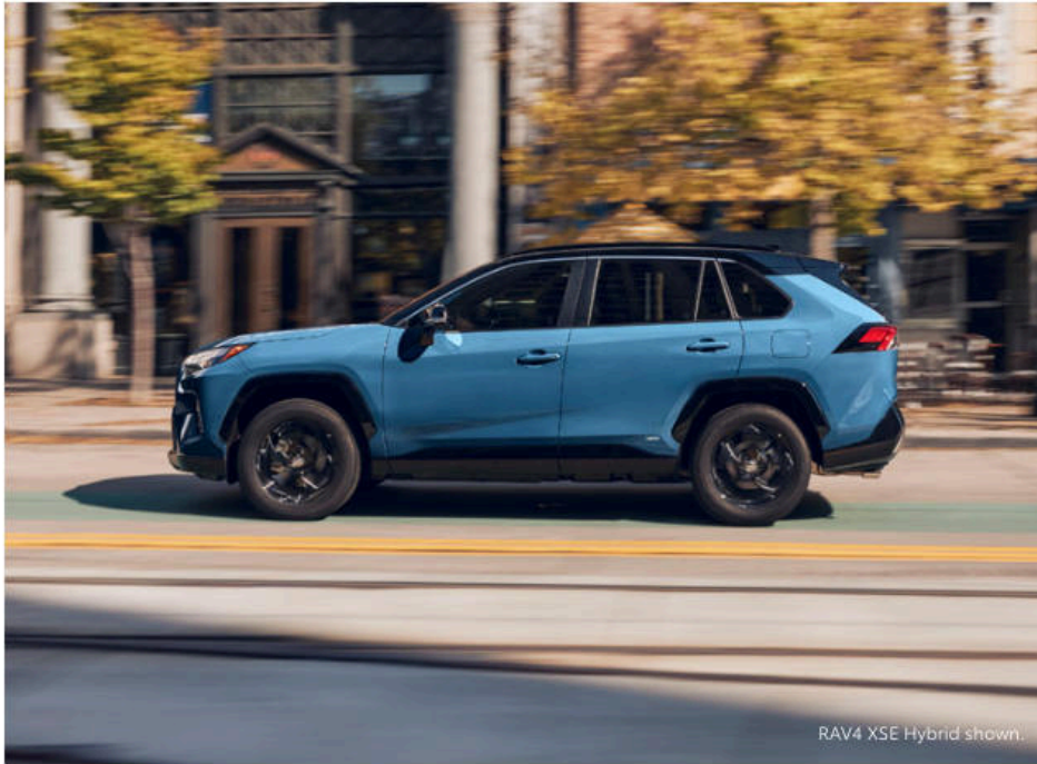
RAV4 XSE Hybrid shown.