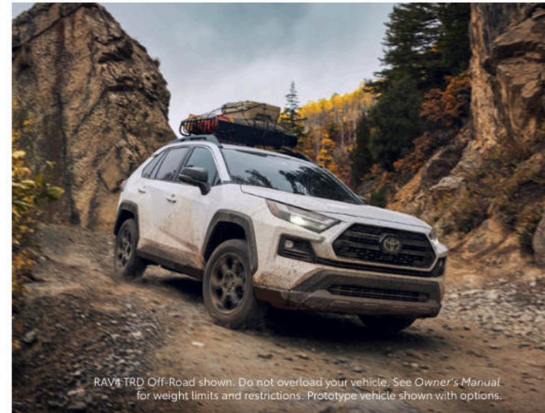
RAV4 TRD Off-Road shown. Do not overload your vehicle. See Owner's Manual for weight limits and restrictions. Prototype vehicle shown with options.