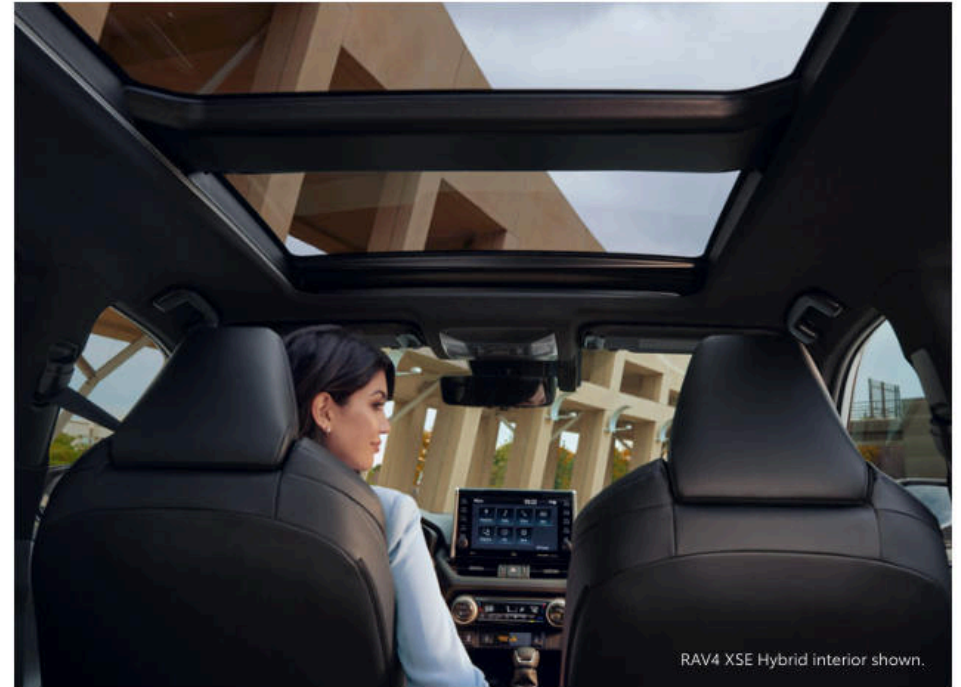
RAV4 XSE Hybrid interior shown.