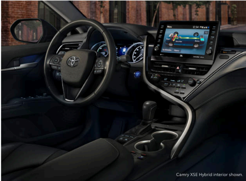
Camry XSE Hybrid interior shown.

With its captivating style, Camry Hybrid is dressed to impress without compromising performance. Its Dynamic Force Engine, paired with the Toyota hybrid system, offers both power and premium fuel economy.