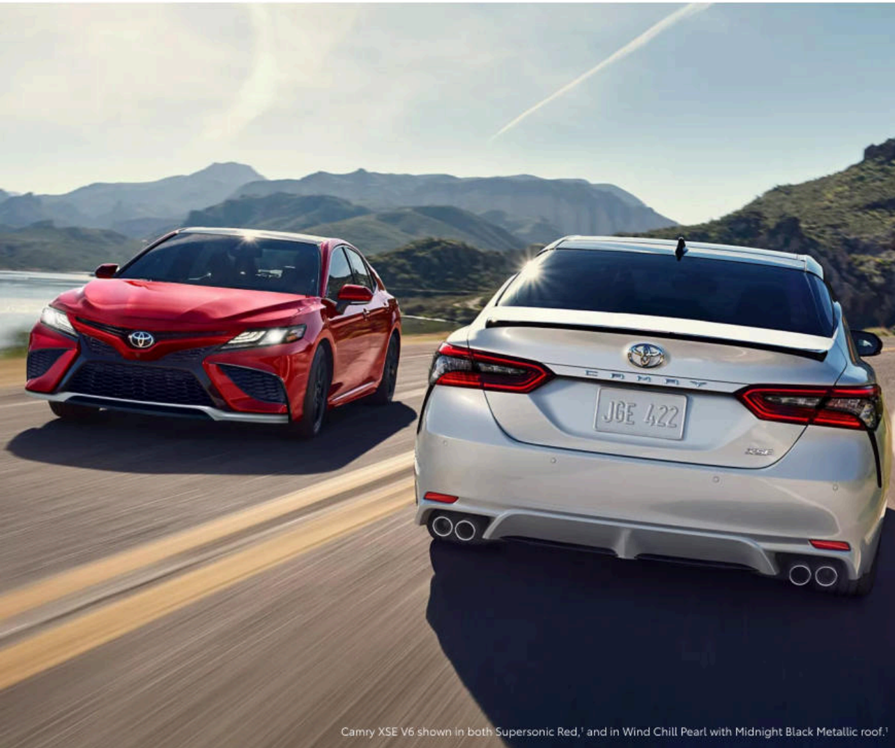
Camry XSE V6 shown in both Supersonic Red, 1 and in Wind Chill Pearl with Midnight Black Metallic roof. 1