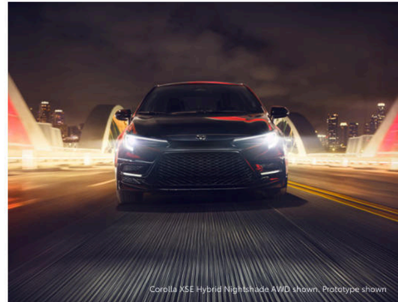
Corolla XSE Hybrid Nightshade AWD shown. Prototype shown.