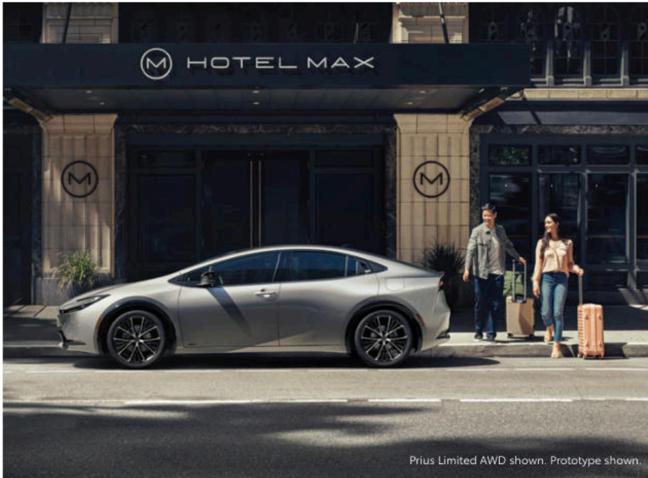
Prius Limited AWD shown. Prototype shown.