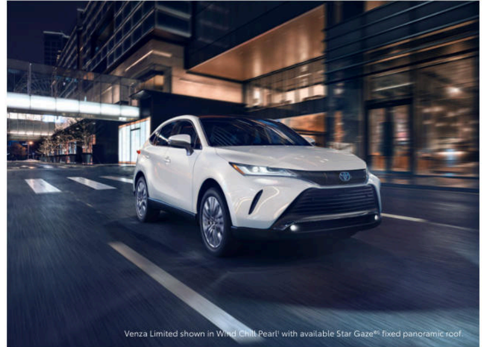
Venza Limited shown in Wind Chill Pearl 1 with available Star Gaze ® fixed panoramic roof.

This all-hybrid crossover rides in a league of its own with its elegant style, tech-focused interior and AWD performance. Explore beyond the ordinary in Venza.