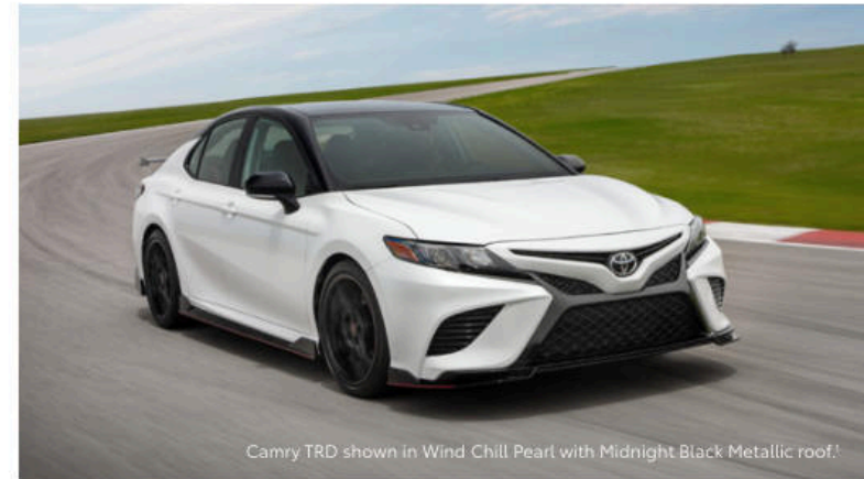
Camry TRD shown in Wind Chill Pearl with Midnight Black Metallic roof. 1