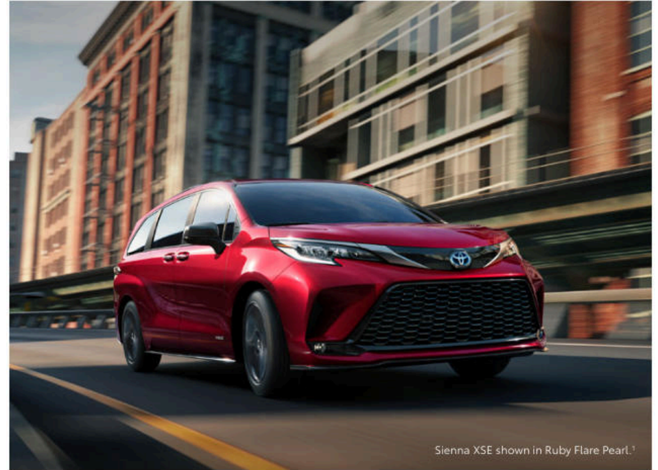
Sienna XSE shown in Ruby Flare Pearl. 1

Unleash your spontaneous spirit in Sienna. Packed with impressive efficiency and the space you crave, Sienna is ready to fuel everything from your everyday errands to your exciting escapades.