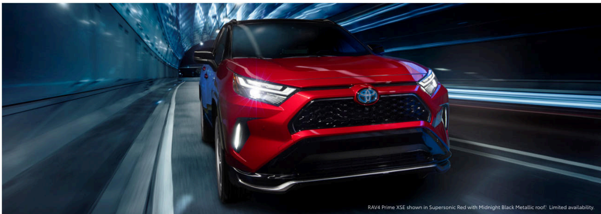
RAV4 Prime XSE shown in Supersonic Red with Midnight Black Metallic roof 1 . Limited availability.