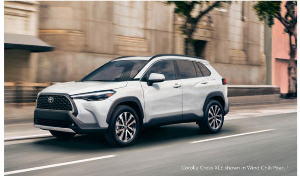
Corolla Cross XLE shown in Wind Chill Pearl. 1

Hop in Corolla Cross for a ride as bold as your ambitions. Enjoy the benefits of the crossover's versatile cargo space, designed for your on-the-go lifestyle. Whether you're commuting or exploring new cities, Corolla Cross is prepared for any plan you've got up your sleeve.