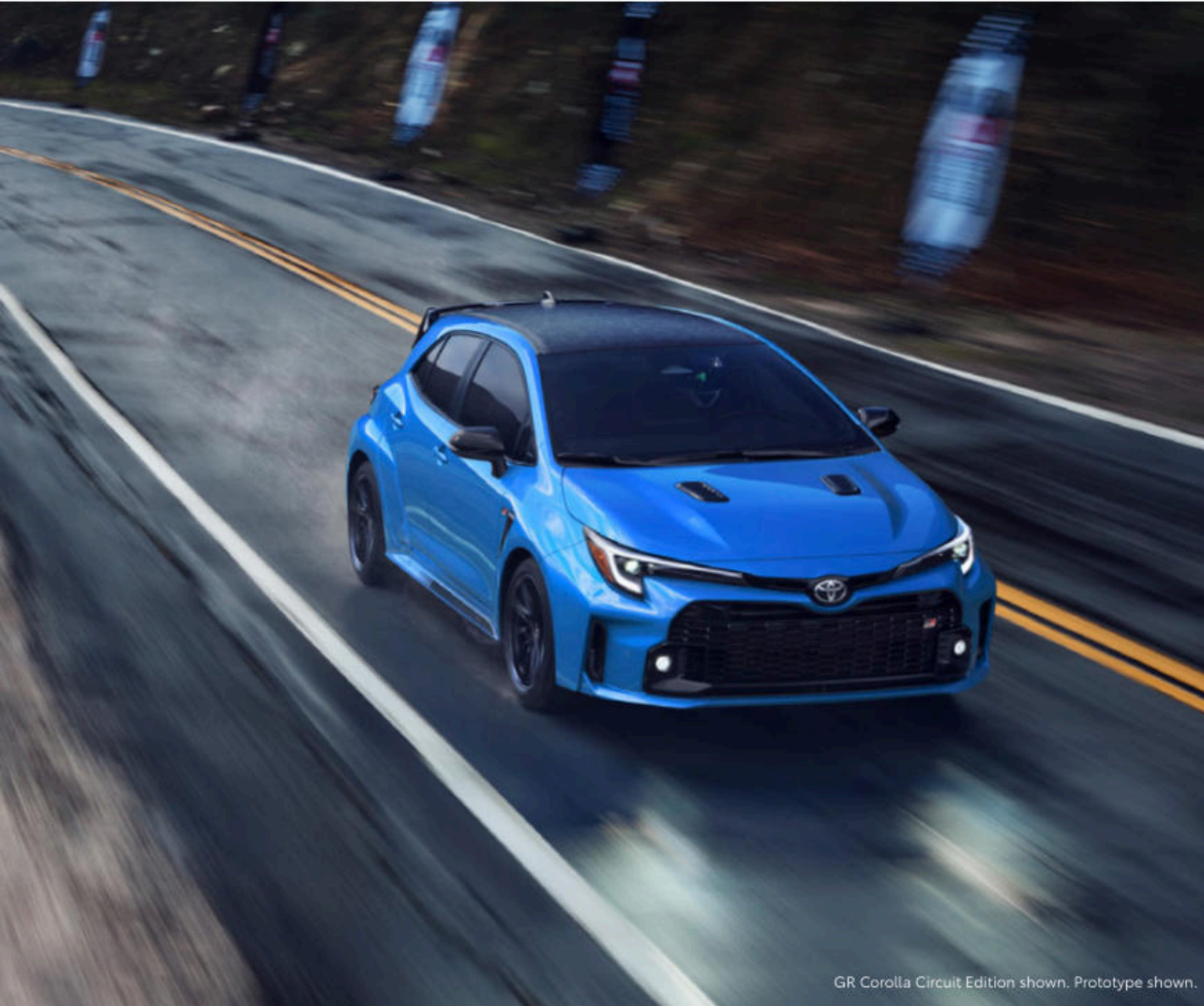
GR Corolla Circuit Edition shown. Prototype shown.