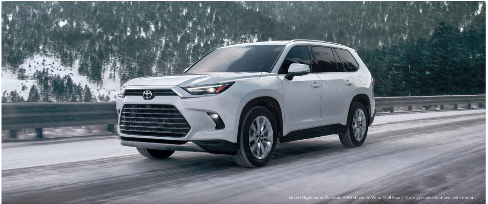
Grand Highlander Platinum AWD shown in Wind Chill Pearl. 1 Prototype vehicle shown with options.