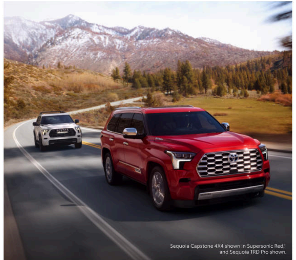
Sequoia Capstone 4X4 shown in Supersonic Red, 1 and Sequoia TRD Pro shown.