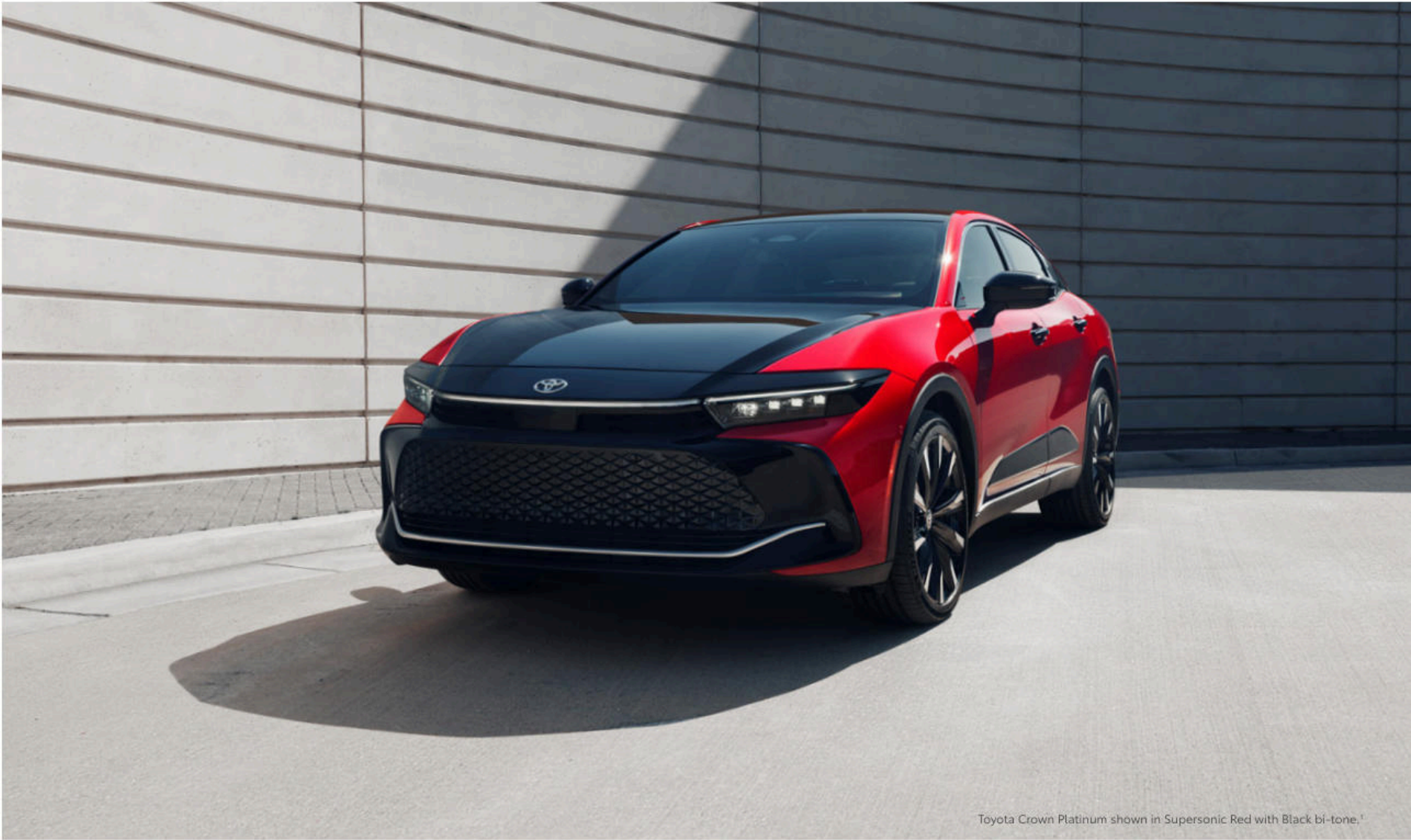
Toyota Crown Platinum shown in Supersonic Red with Black bi-tone. 1