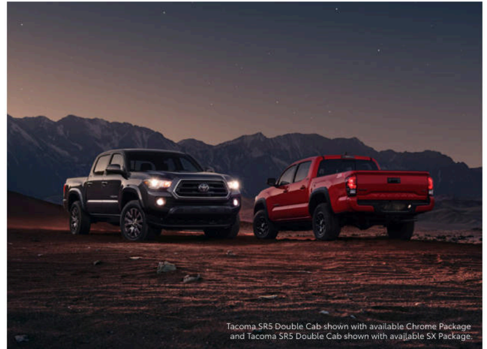
Tacoma SR5 Double Cab shown with available Chrome Package and Tacoma SR5 Double Cab shown with available SX Package.