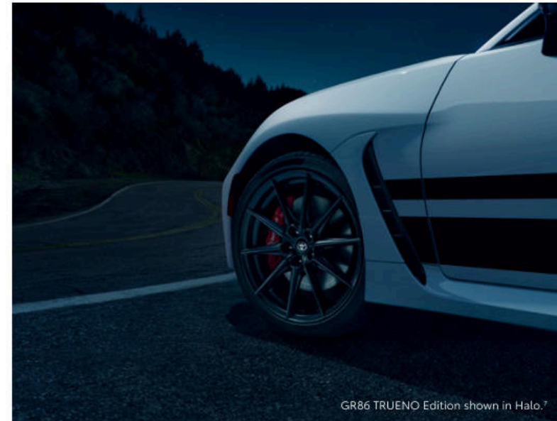
GR86 TRUENO Edition shown in Halo. 7