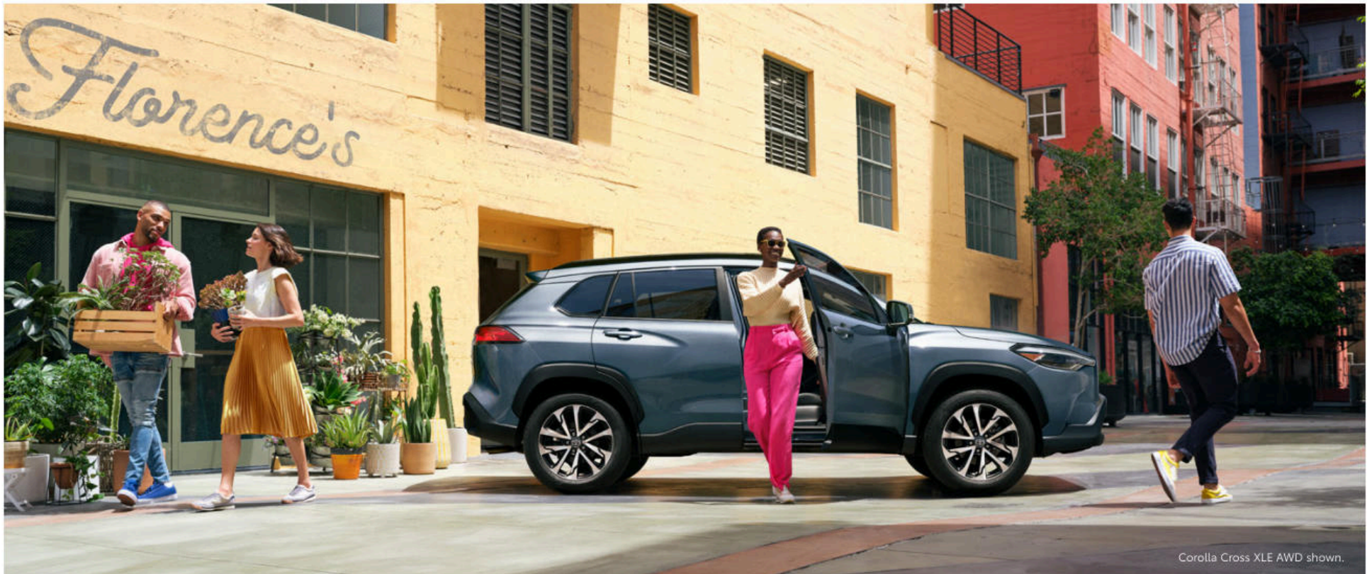
Corolla Cross XLE AWD shown.