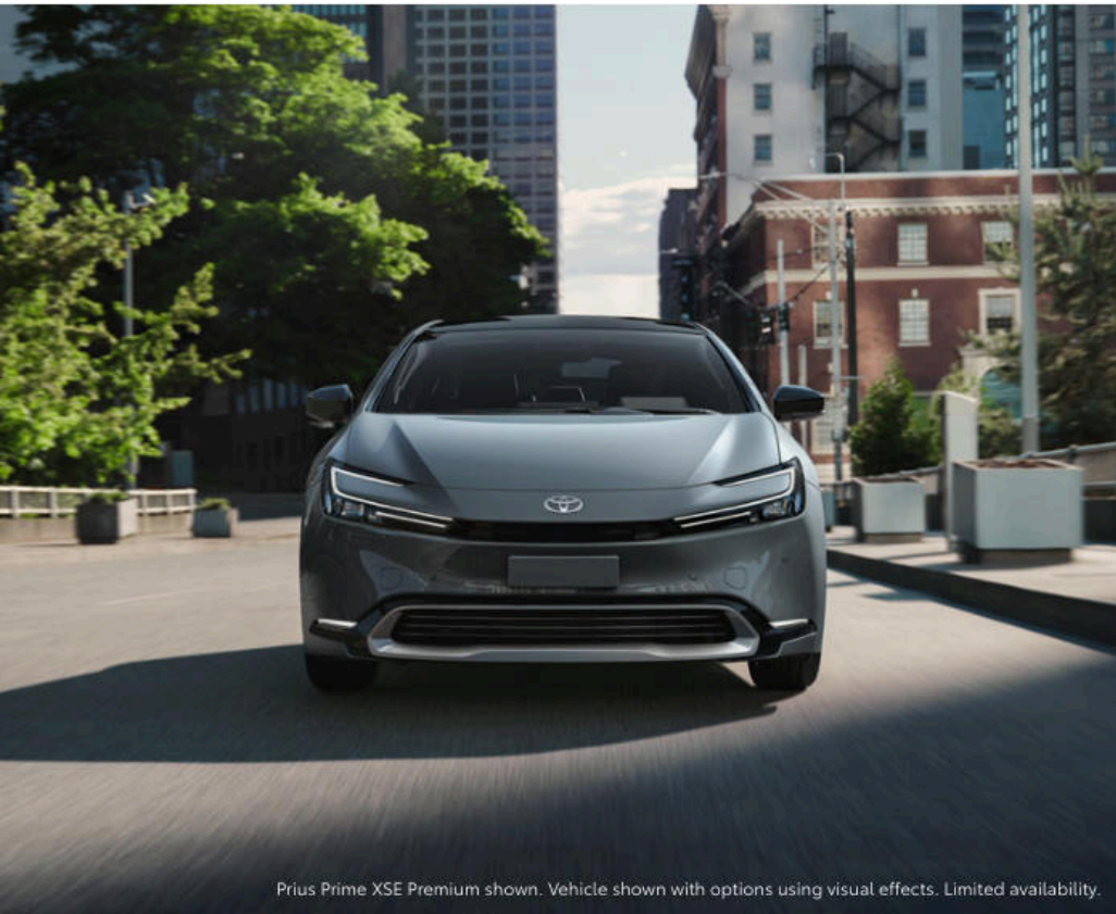
Prius Prime XSE Premium shown. Vehicle shown with options using visual effects. Limited availability.