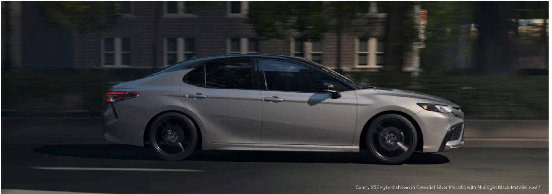
Camry XSE Hybrid shown in Celestial Silver Metallic with Midnight Black Metallic roof. 1