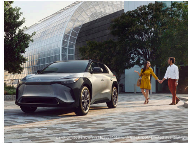
bZ4X Limited shown in Heavy Metal with Black roof. 1 Limited availability.