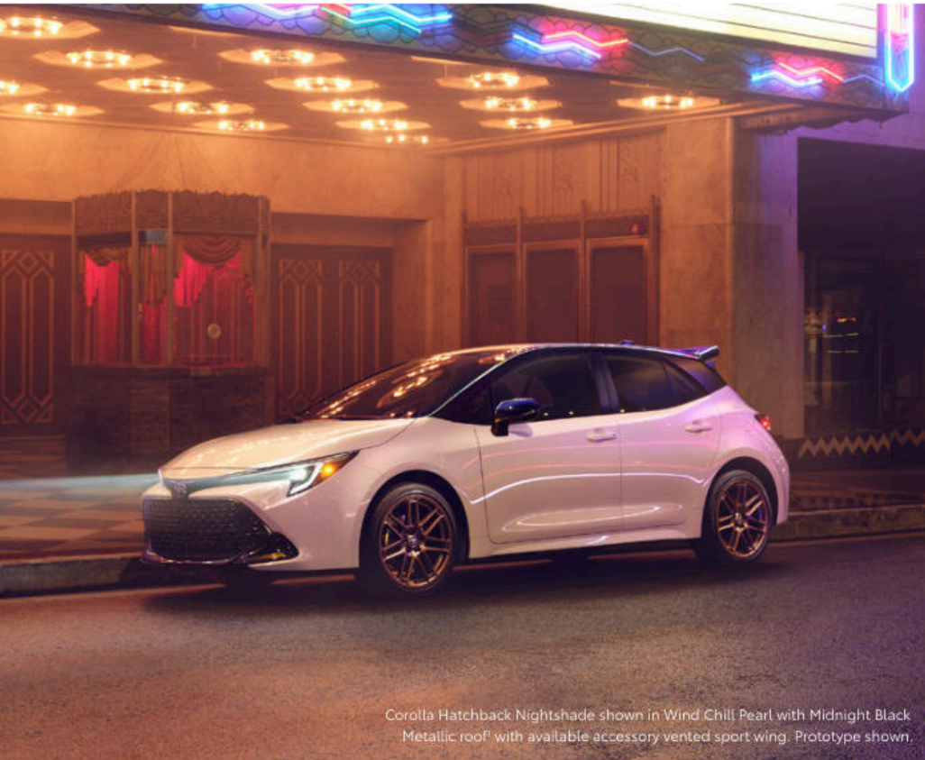
Corolla Hatchback Nightshade shown in Wind Chill Pearl with Midnight Black Metallic roof* with available accessory vented sport wing. Prototype shown.