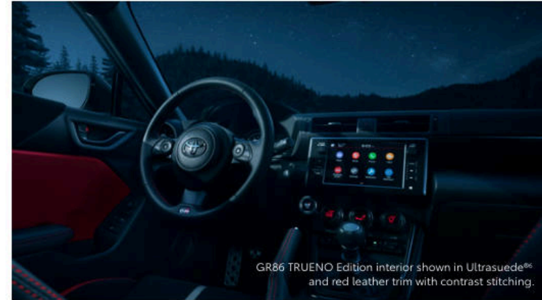
GR86 TRUENO Edition interior shown in Ultrasuede ® and red leather trim with contrast stitching.