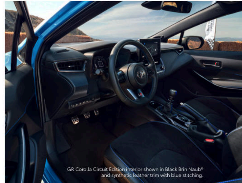
GR Corolla Circuit Edition interior shown in Black Brin Naub® and synthetic leather trim with blue stitching.