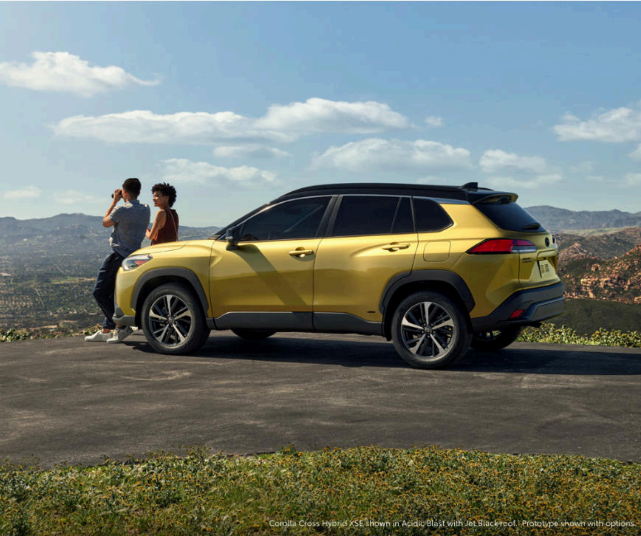
Corolla Cross Hybrid XSE shown in Acidic Blast with Jet Black roof. Prototype shown with options.

Corolla Cross Hybrid is a versatile ride that's ready to take on your most spontaneous trips. Its slick exterior and sporty feel behind the wheel bring out the joy in every day, while its efficient performance encourages you to explore much more.