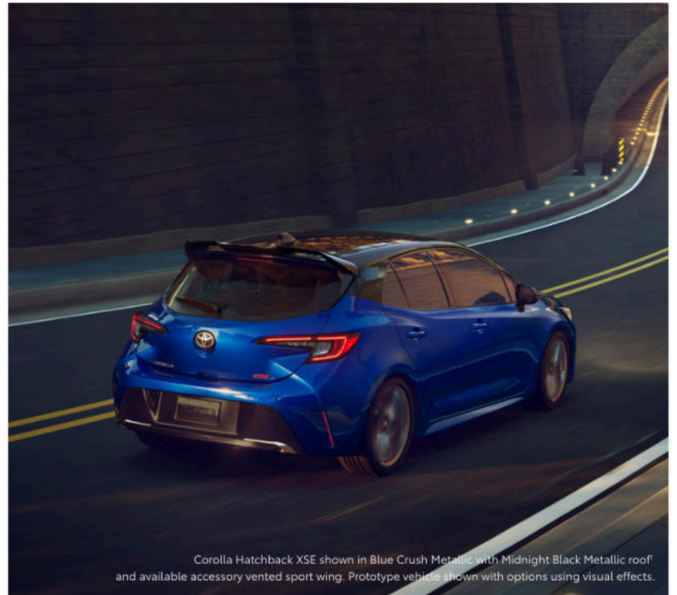
Corolla Hatchback XSE shown in Blue Crush Metallic with Midnight Black Metallic roof* and available accessory vented sport wing. Prototype vehicle shown with options using visual effects.