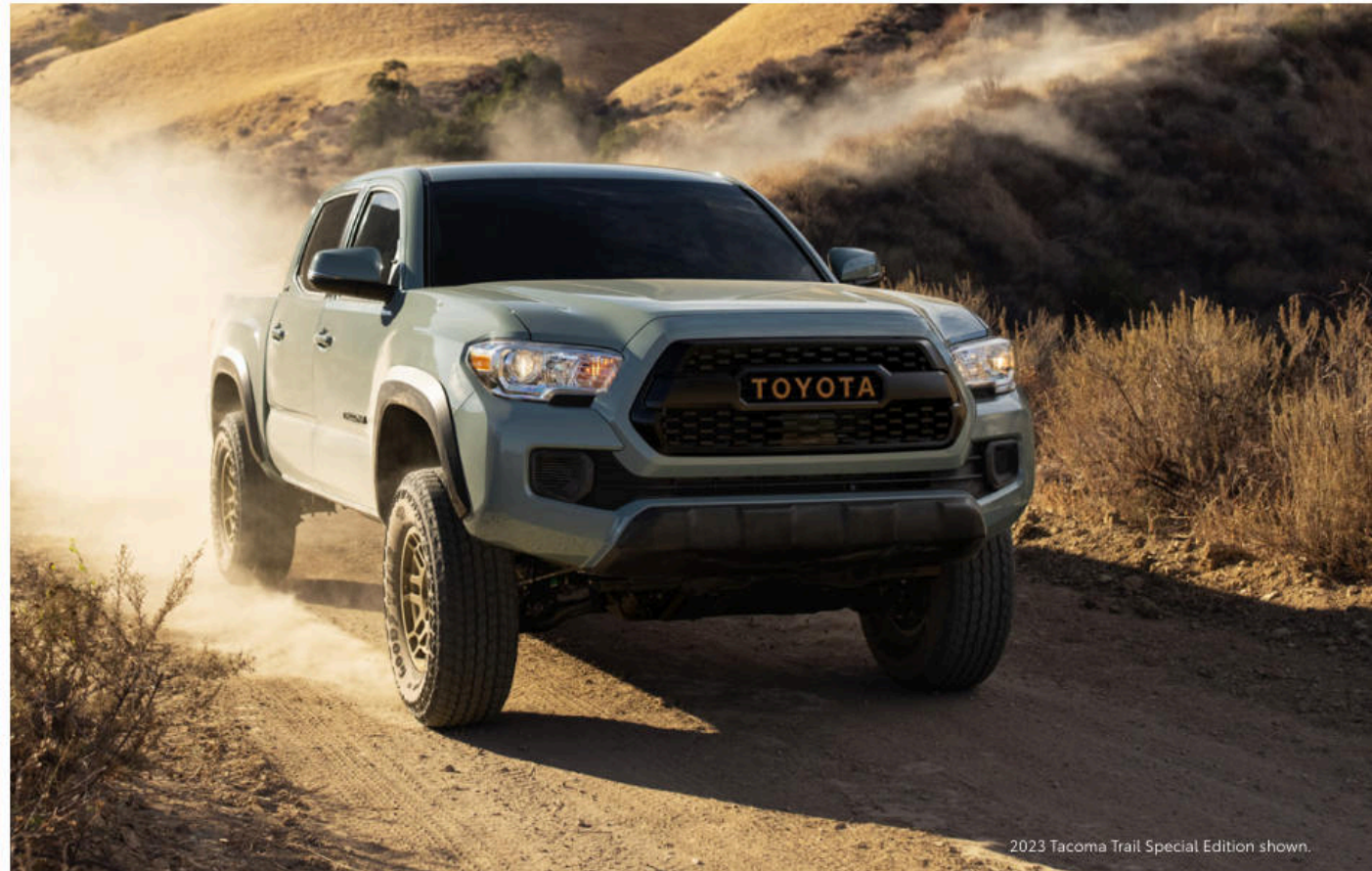
2023 Tacoma Trail Special Edition shown.