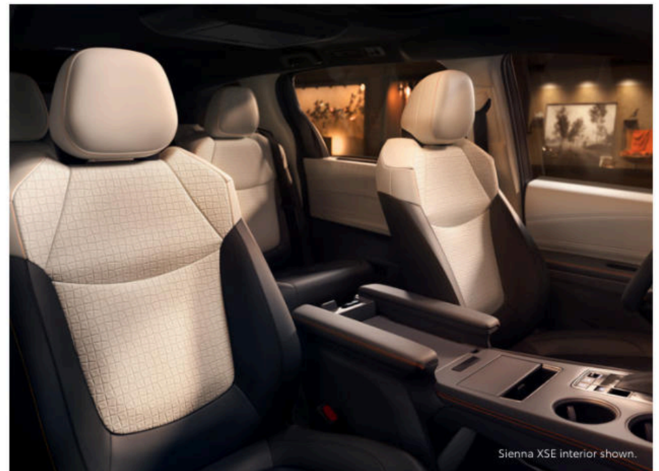
Sienna XSE interior shown.