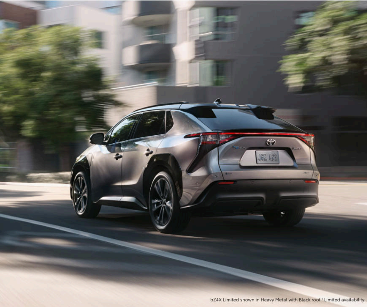
bZ4X Limited shown in Heavy Metal with Black roof. 1 Limited availability.

bZ4X is an all-electric way to jump-start your day. With its electrified powertrain that produces up to 214 hp with 248 lb.-ft. of max torque, and a battery made to last all day, you'll find yourself riding confidently for miles.