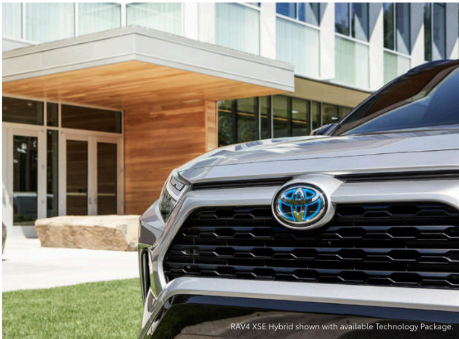
RAV4 XSE Hybrid shown with available Technology Package.