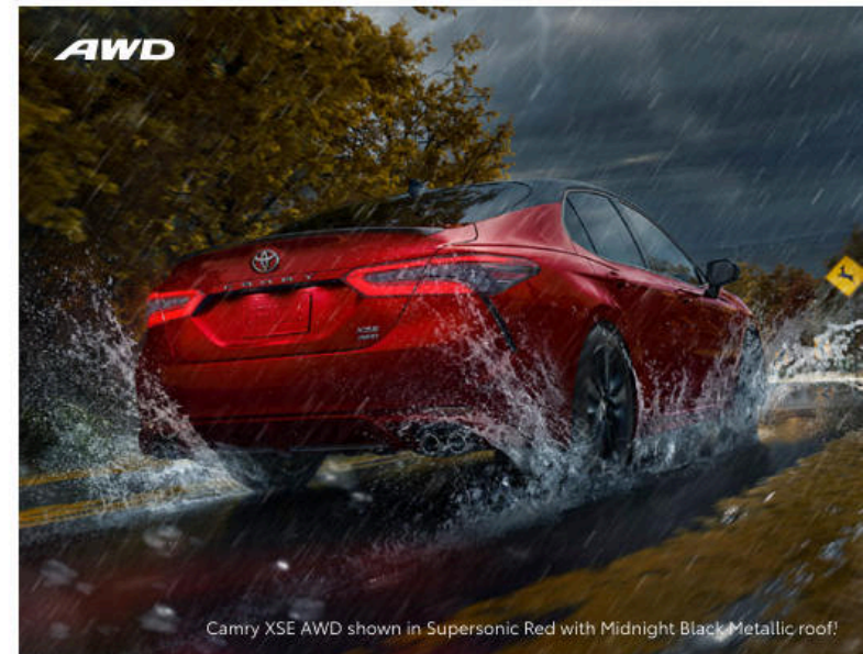
Camry XSE AWD shown in Supersonic Red with Midnight Black Metallic roof. 1