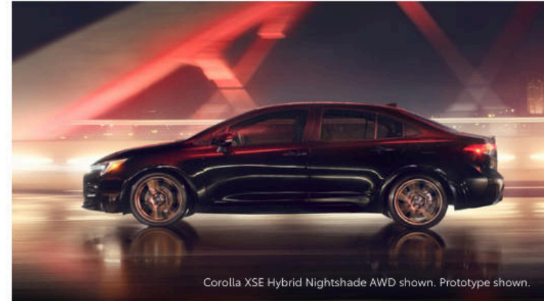
Corolla XSE Hybrid Nightshade AWD shown. Prototype shown.