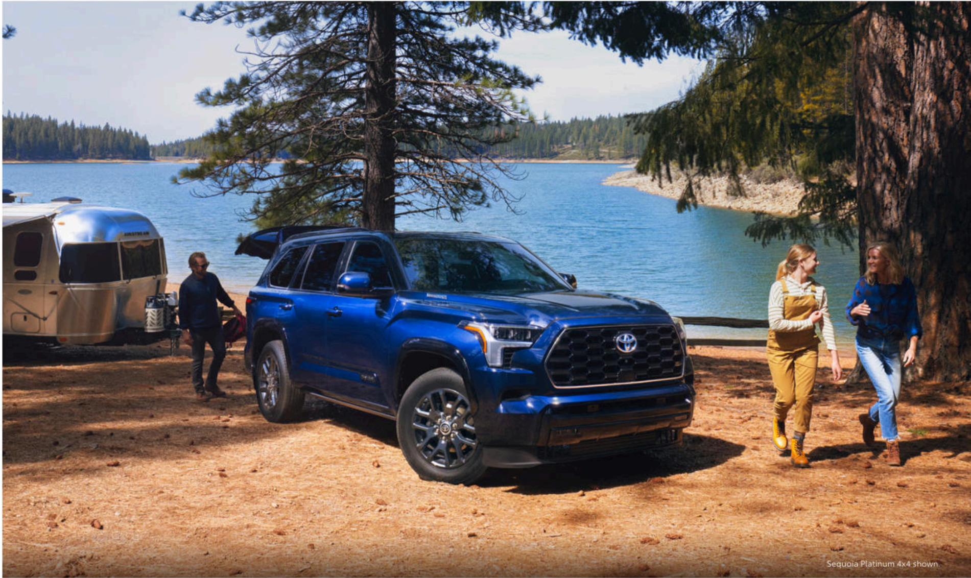
Sequoia Platinum 4x4 shown.