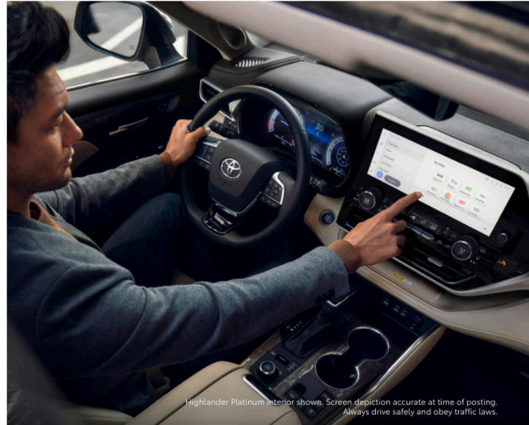
Highlander Platinum Interior shown. Screen depiction accurate at time of posting. Always drive safely and obey traffic laws.