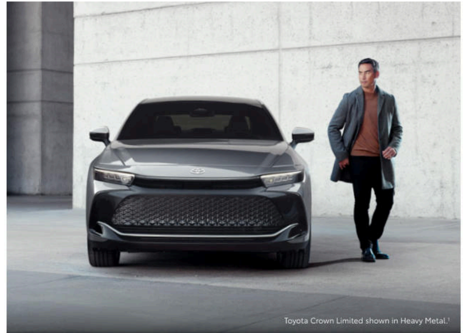
Toyota Crown Limited shown in Heavy Metal. 1