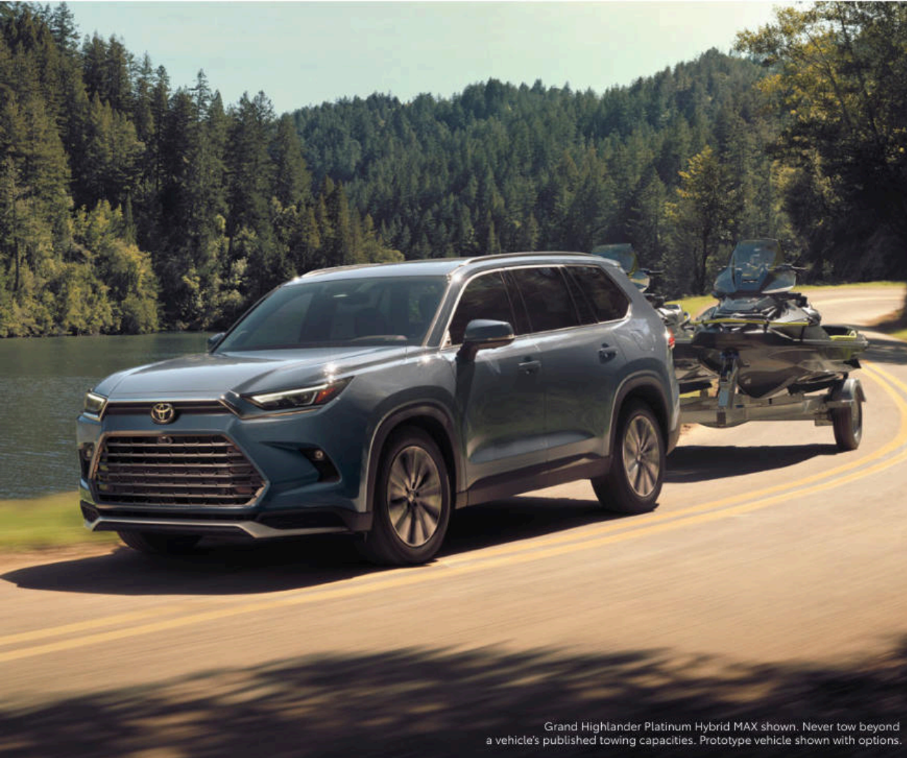
Grand Highlander Platinum Hybrid MAX shown. Never tow beyond a vehicle's published towing capacities. Prototype vehicle shown with options.

Get ready to conquer highways and country roads with electrified power. The performance-focused Grand Highlander Hybrid MAX has an EPA-estimated combined rating of up to 27 mpg, 4 so you can take your next spontaneous Saturday farther than ever.