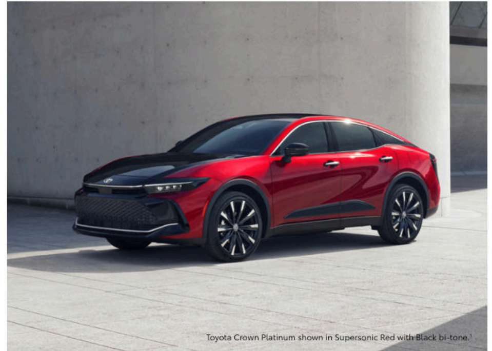
Toyota Crown Platinum shown in Supersonic Red with Black bi-tone. 1

Stunning design with the performance to match. Toyota Crown's hybrid system gives you powerful and efficient driving, packaged with undeniable style.