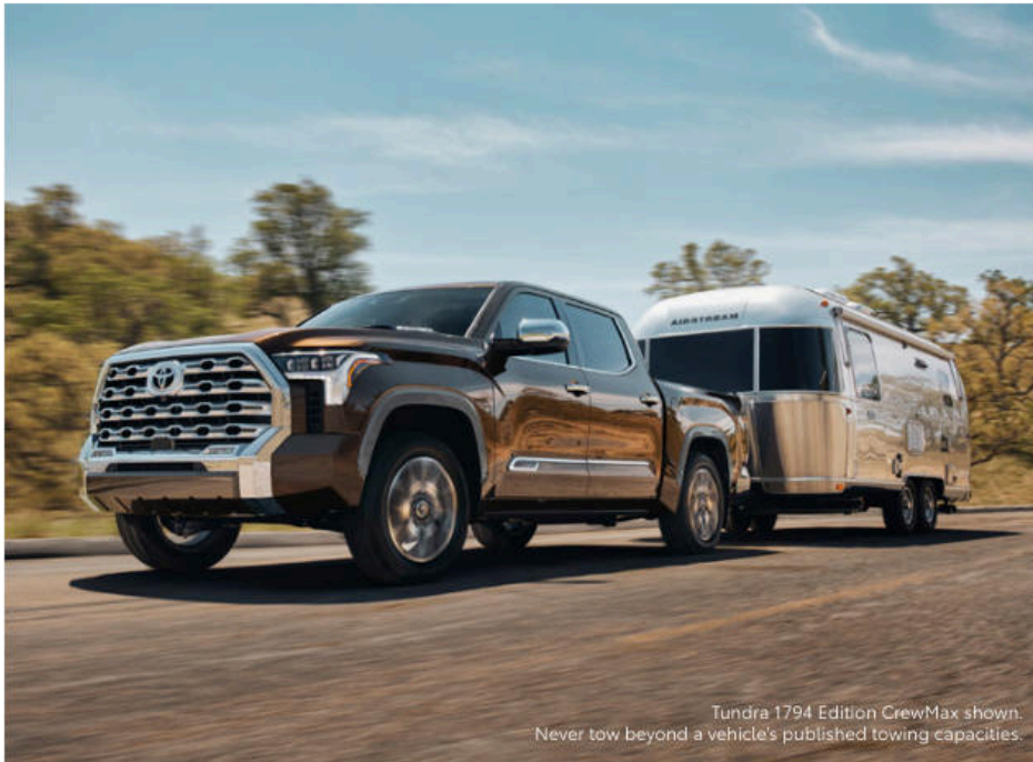
Tundra 1794 Edition CrewMax shown. Never tow beyond a vehicle's published towing capacities.