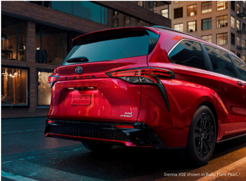
Sienna XSE shown in Ruby Flare Pearl. 1