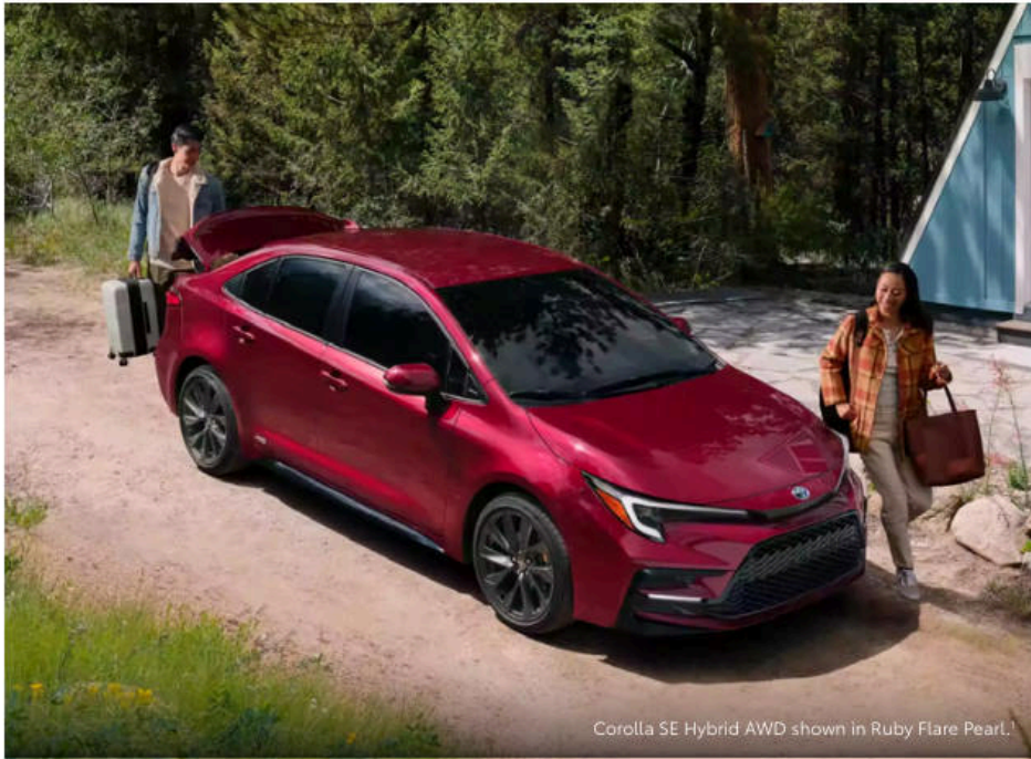
Corolla SE Hybrid AWD shown in Ruby Flare Pearl.