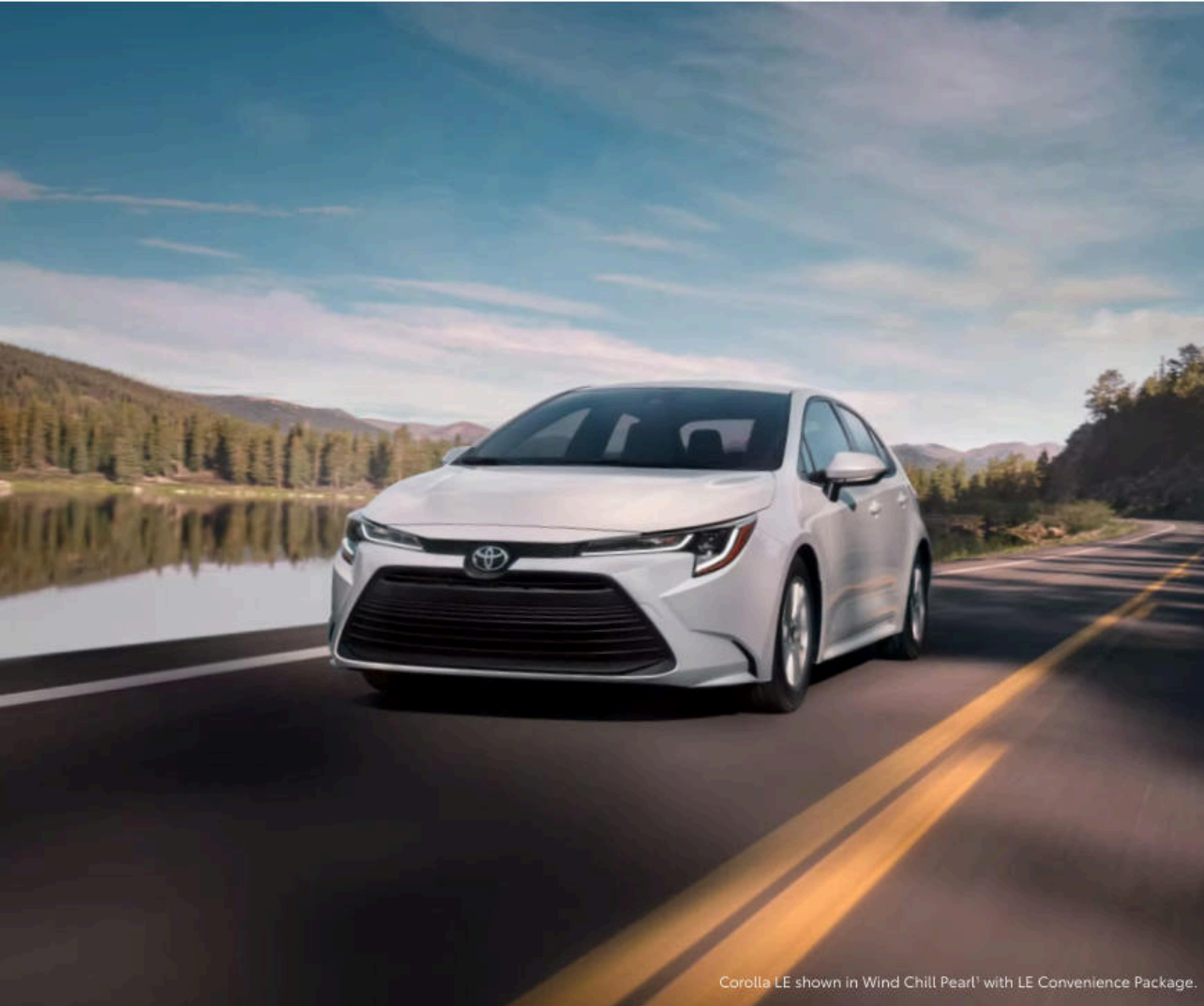
Corolla LE shown in Wind Chill Pearl 1 with LE Convenience Package.