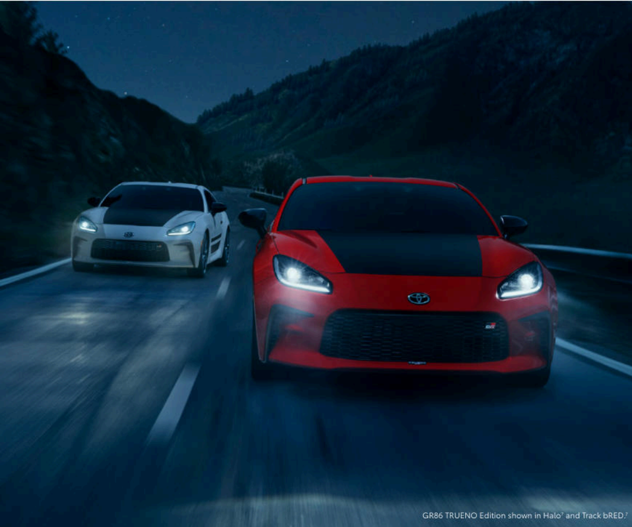
GR86 TRUENO Edition shown in Halo 7 and Track bRED. 7