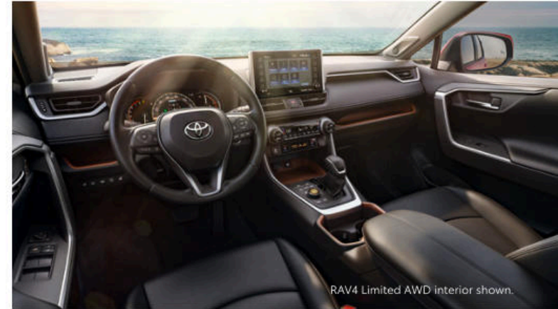
RAV4 Limited AWD interior shown.