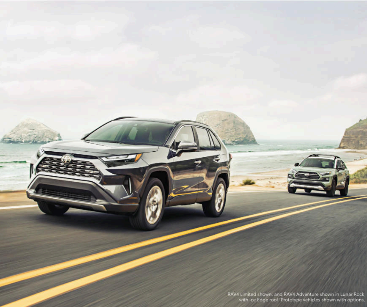
RAV4 Limited shown, and RAV4 Adventure shown in Lunar Rock with Ice Edge roof. 1 Prototype vehicles shown with options.