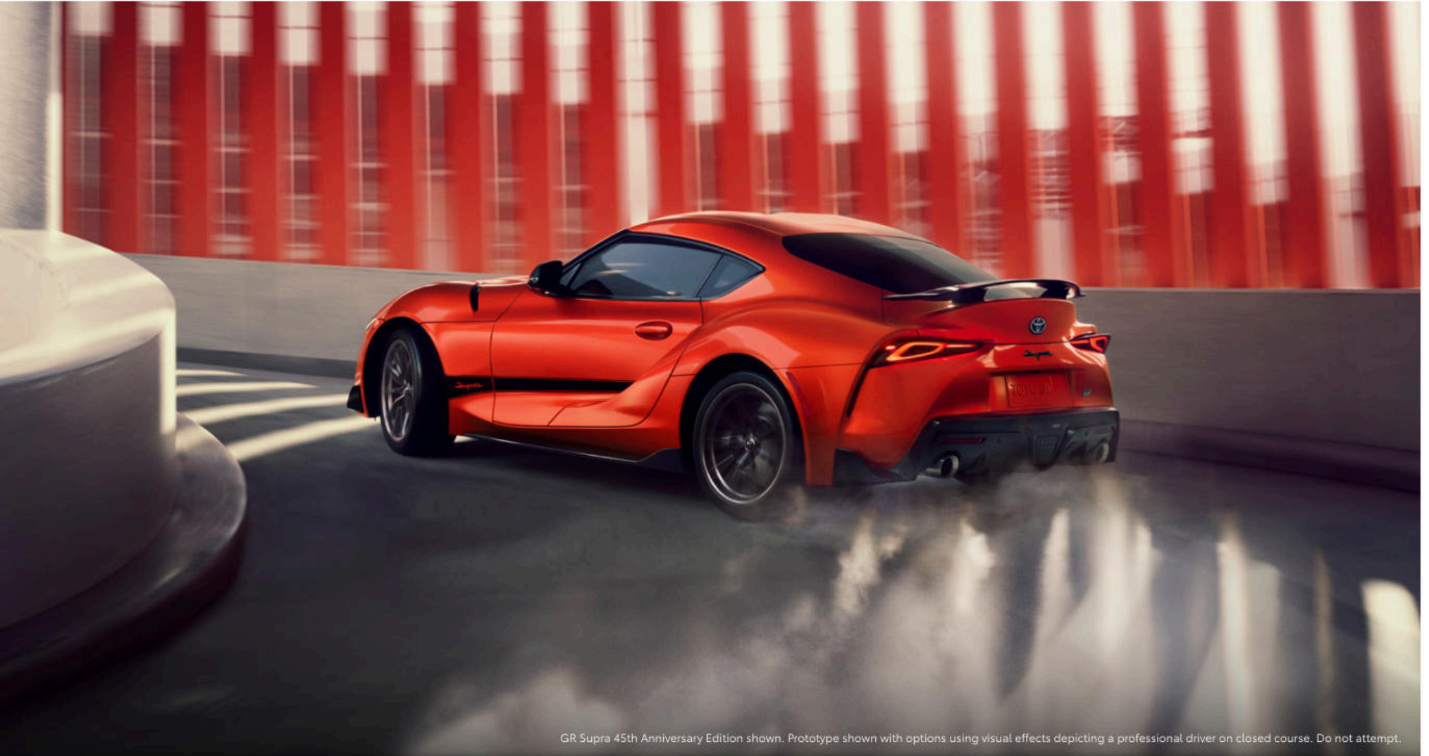
GR Supra 45th Anniversary Edition shown. Prototype shown with options using visual effects depicting a professional driver on closed course. Do not attempt.