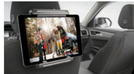
Universal Tablet Holder**