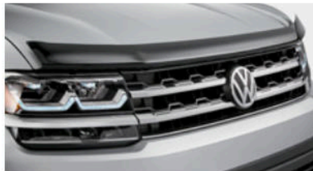
Hood Deflector — Tinted