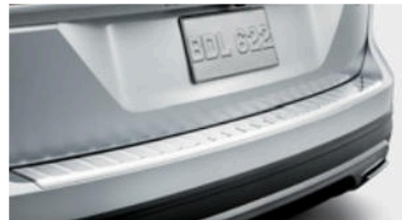
Rear Bumper Protection Plate — Chrome