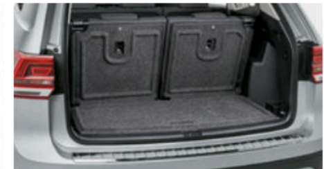
Heavy Duty Trunk Liner with Cargo Blocks and Extended Seat Back Cover

*6 years/72,000 miles (whichever occurs first) New Vehicle Limited Warranty on MY2018 VW vehicles excluding e-Golf. Remainder of warranty coverage transfers to subsequent vehicle owner. See owner's literature or dealer for warranty exclusions and limitations. **Tablet device not included.