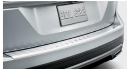
Rear Bumper Protection Plate — Chrome