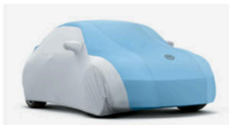
Stormproof™ Custom Car Covers**