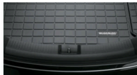
MuddyBuddy™ Trunk Liner**