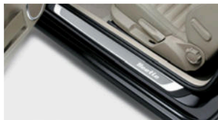
Door Sill Protection Plate