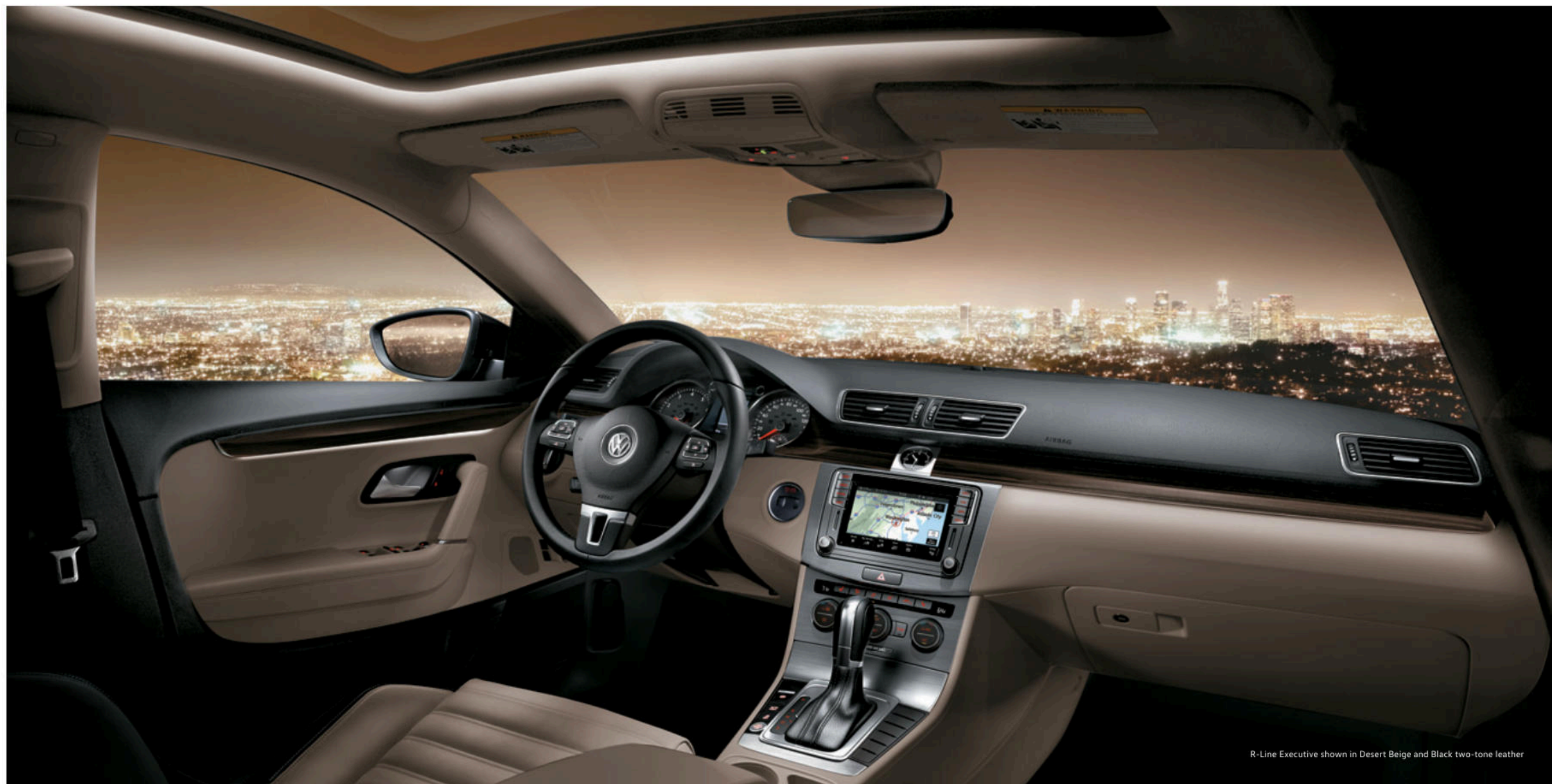
R-Line Executive shown in Desert Beige and Black two-tone leather