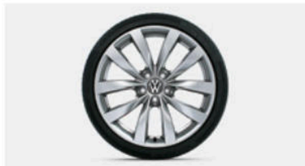
19" Sagitta Wheel