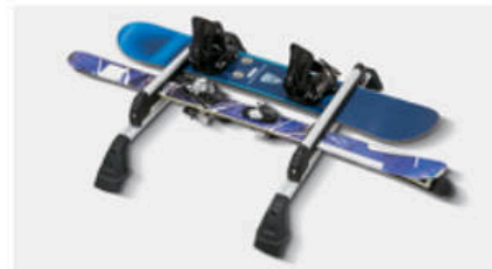
Base Carrier Bars and Snowboard/Wakeboard/Ski Holder Attachment