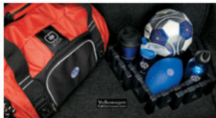
Heavy Duty Trunk Liner and CarGo Blocks