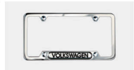
License Plate Frames