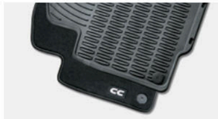
MojoMats® and Monster Mats®