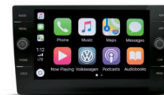
Apple CarPlay integration for your iPhone shown.