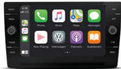
Apple CarPlay integration for your iPhone shown.

App-Connect allows you to connect your compatible smartphone with Apple CarPlay® (below), Android Auto™, or MirrorLink® to access select apps on the touchscreen display. From streaming music to mobile apps, it can be accessed on the touchscreen.