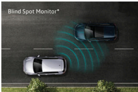
Blind Spot Monitor*