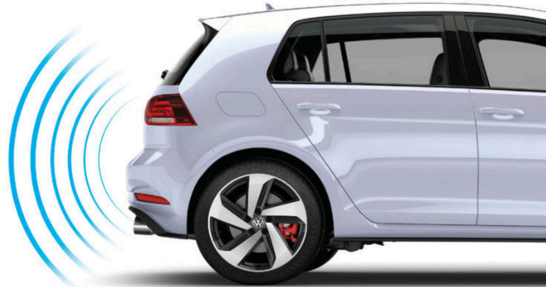
Rear Traffic Alert*