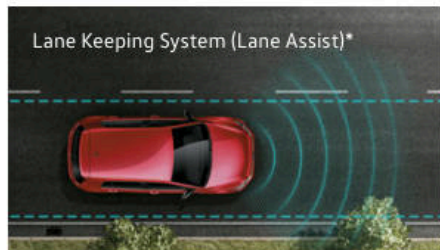
Lane Keeping System (Lane Assist)*