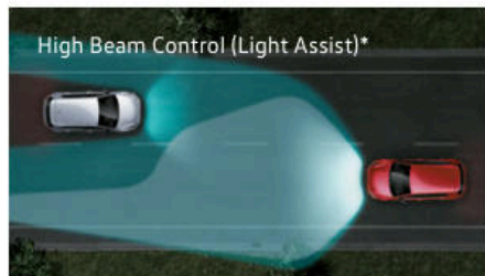
High Beam Control (Light Assist)*

Driver Assistance features can help give you more confidence on your drive.