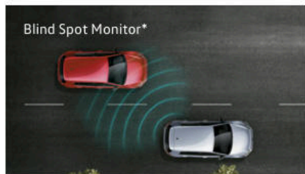
Blind Spot Monitor*