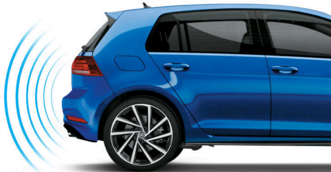
Rear Traffic Alert*

When driving, if you attempt to change lanes, the Blind Spot Monitor can help alert you to cars that may be in your blind spot. The Active Blind Spot Monitor can also counter-steer within the limits of Lane Assist to help keep you in your lane if you attempt to change lanes when a vehicle is in your blind spot.