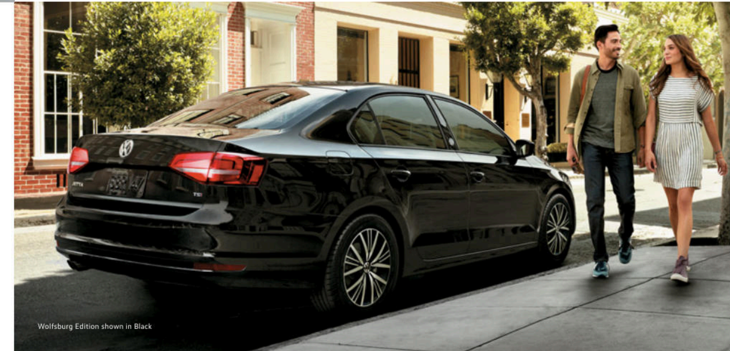
Wolfsburg Edition shown in Black

Take one look at the sport bumper, 16" Linas alloy wheels, V-Tex interior, and special badging, and you'll know pretty quickly this Wolfsburg is packed.