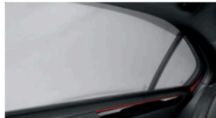
Magnetic Pop-In Sunshades**