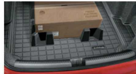
MuddyBuddy™ Cargo Liner and CARGOTECH® Blocks**