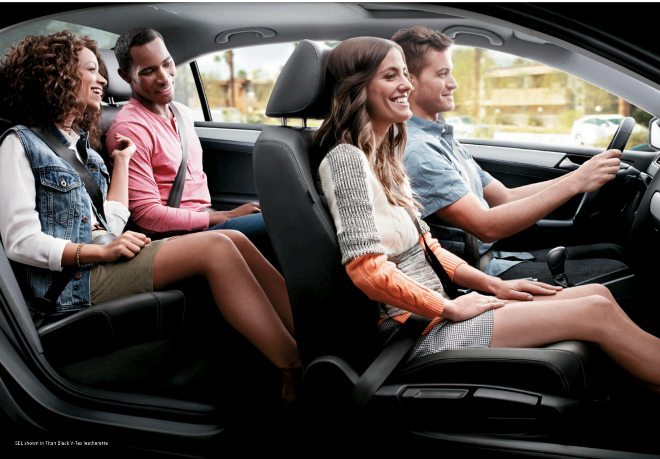
SEL shown in Titan Black V-Text leatherette