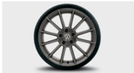
18" Rotary Wheel