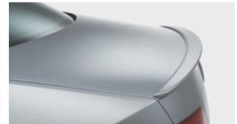
Rear Lip Spoiler

*6 years/72,000 miles (whichever occurs first) New Vehicle Limited Warranty on MY2018 VW vehicles excluding e-Golf. See owner's literature or dealer for warranty exclusions and limitations. **Genuine Volkswagen Accessories installed by an authorized Volkswagen dealer are covered for the greater of: (1) the accessory limited warranty period (12 months or 12,000 miles, whichever occurs first) from the time of purchase; or (2) the remainder of the New Vehicle Limited Warranty period. See dealer for details. Pop-In Sunshades are covered by a NSV warranty of up to three years or 60,000 miles. Please visit http://www.nsvauto.com for additional information. MuddyBuddy™ Cargo Liners by WeatherTech® and CargoTech® Cargo containment system are covered by WeatherTech® Lifetime limited warranty. Please visit http://www.weathertech.com/service/warranty/ for additional information.