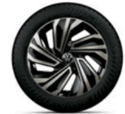
17" Tornado Metallic