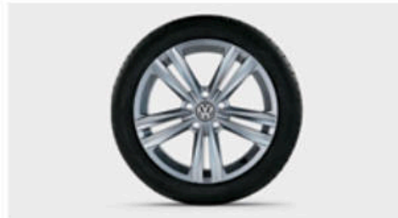
17" Trenton Wheel††