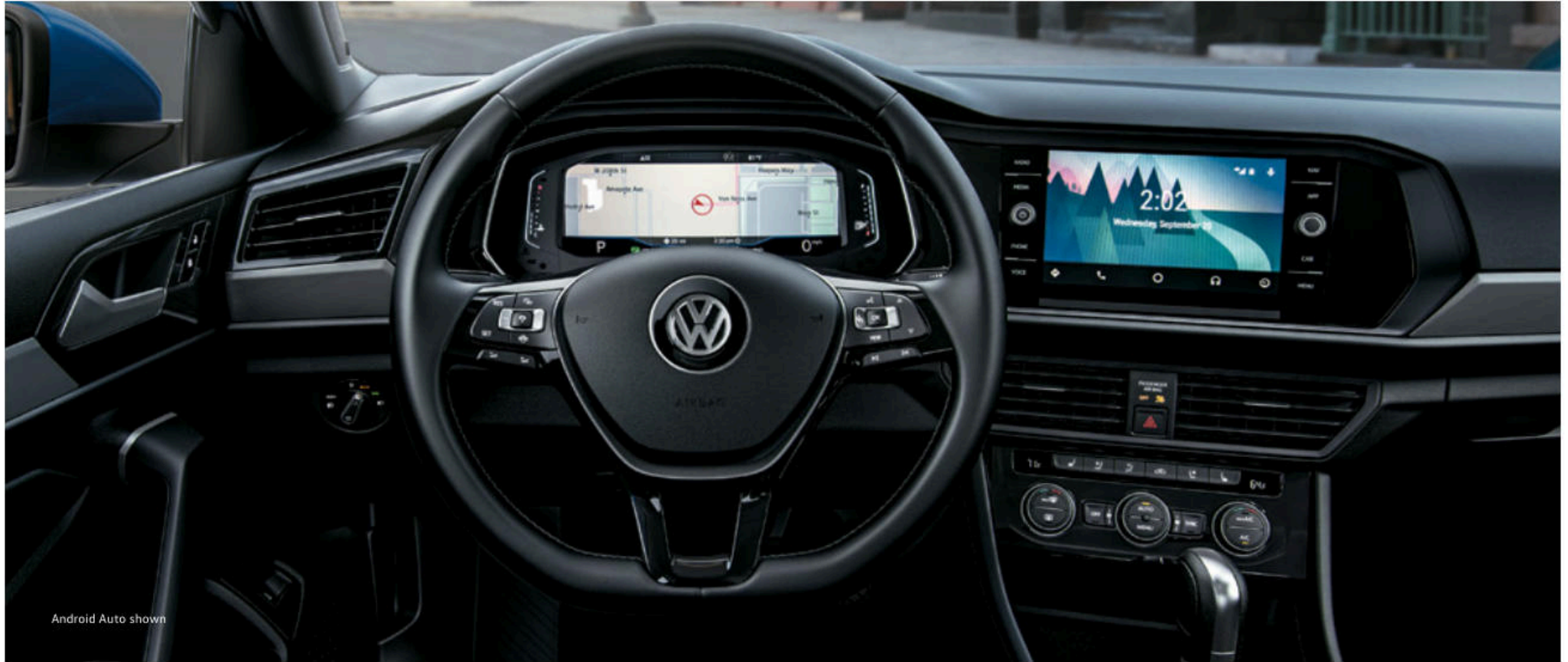
Android Auto shown

Besides looking great, the available sleek glass display helps make the map more prominent, while dynamic route guidance assists you with turn-by-turn information.