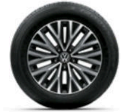
16" Rama Black