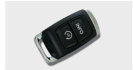
Remote Start (Extended Range Key Fob Shown)††††

*6 years/72,000 miles (whichever occurs first) New Vehicle Limited Warranty on MY2018 and newer VW vehicles, excluding e-Golf. See owner's literature or dealer for warranty exclusions and limitations. **Claim based on manufacturers' published data on length and transferability of car and SUV Bumper-to-Bumper/Basic warranty only. Not based on other separate warranties. †Genuine Volkswagen Accessories installed by an authorized Volkswagen dealer are covered for the greater of: (1) the accessory limited warranty period (12 months or 12,000 miles, whichever occurs first) from the time of purchase; or (2) the remainder of the New Vehicle Limited Warranty period. Non-genuine Volkswagen Accessories may be covered under separate manufacturer warranties, which can be found at VWAccessoriesWarranty.com. Visit VWAccessoriesWarranty.com or see participating Volkswagen dealer for complete details. ††Proper installation required. Professional installation may be recommended. See owner's literature or dealer for details. †††See vehicle Owner's Manual for further details and important warnings about the keyless ignition feature. Do not leave vehicle unattended with the engine running, particularly in enclosed spaces.