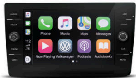
Apple CarPlay integration for your iPhone shown.

VW Car-Net App-Connect allows you to connect your compatible smartphone with Apple CarPlay®, Android Auto™, or MirrorLink® to access select apps on the touchscreen display. From streaming music to mobile apps, it can be accessed on the touchscreen.