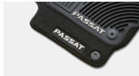
MojoMats® and Monster Mats®