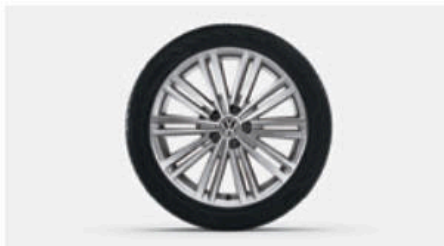
19" Luxor Wheel