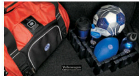
Heavy Duty Trunk Liner and VW CarGo Blocks