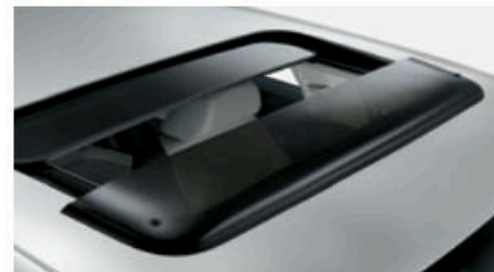
Sunroof Wind Deflector