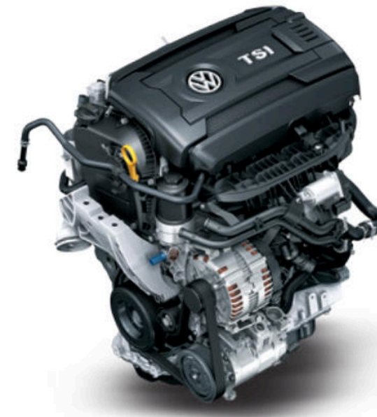
1.8L TSI engine

vw.com/models/passat/section/performance