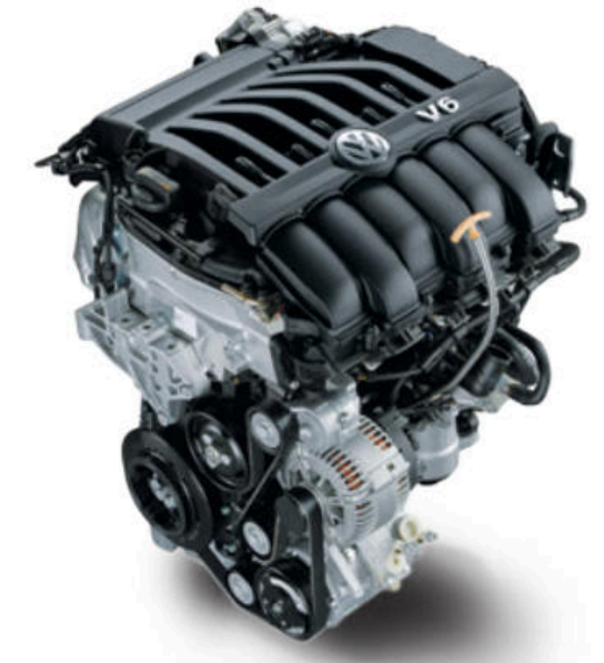
3.6L V6 engine