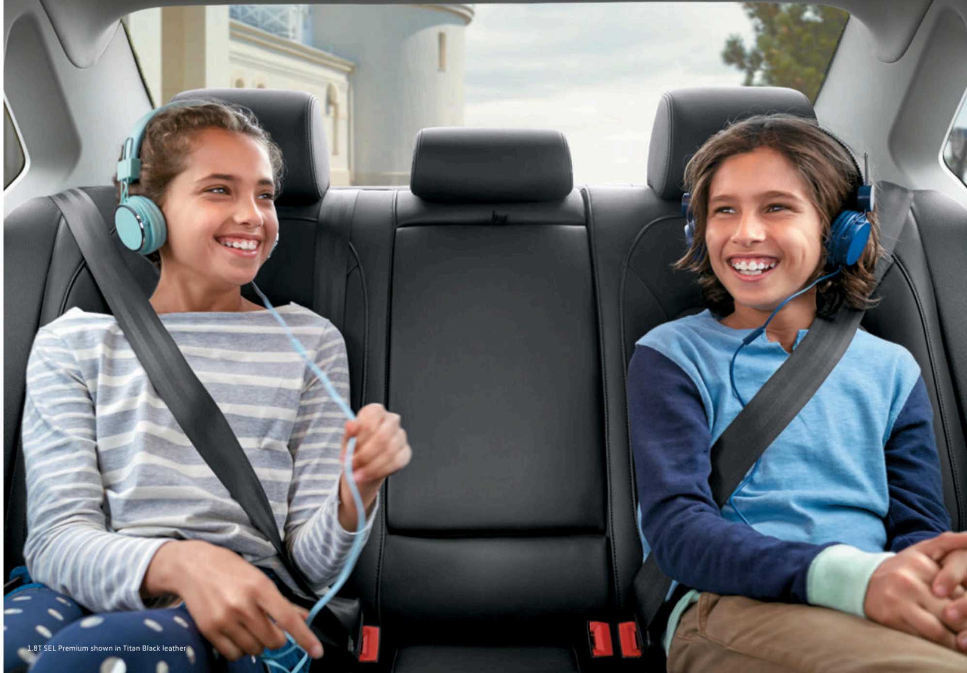
1.8T SEL Premium shown in Titan Black leather

It's often been said that "you can't please everyone." The Passat politely begs to differ, especially since it offers features like an available color multi-function trip computer that allows you to quickly view important trip information. Plus, the Passat has Climatronic® dual-zone climate control and available heated front and rear seats, both of which were designed to keep the family smiling.