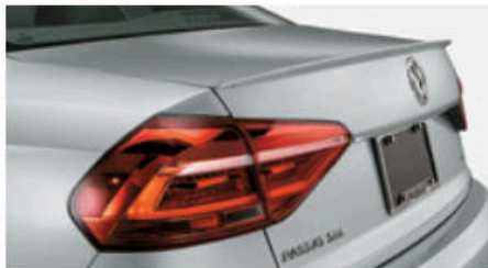
Rear Lip Spoiler