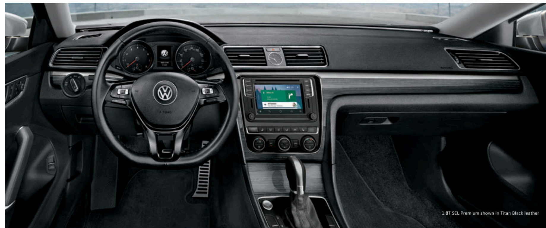
1.8T SEL Premium shown in Titan Black leather

It's often been said that "you can't please everyone." The Passat politely begs to differ, especially since it offers features like an available color multi-function trip computer that allows you to quickly view important trip information. Plus, the Passat has Climatronic® dual-zone climate control and available heated front and rear seats, both of which were designed to keep the family smiling.