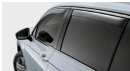
Side Window Deflectors — Tinted