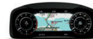
Wide Map Navigation View

The Tiguan can store up to four driver profiles, remembering your personalization preferences for a wide variety of different settings and systems.