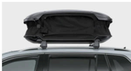
Base Carrier Bars and URBAN LOADER ®**