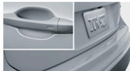
Rear Bumper and Door Cup Paint Protection Film