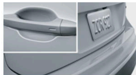
Rear Bumper and Door Cup Paint Protection Film