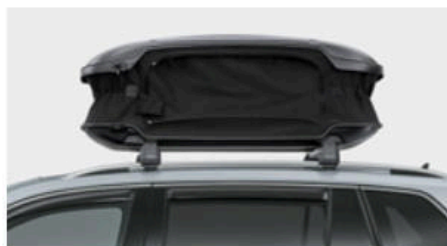
Base Carrier Bars and URBAN LOADER ®***