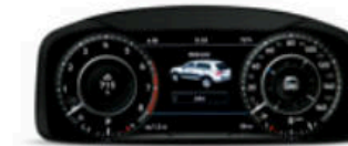
Driver profile selection